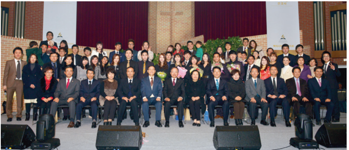
NSD Leaders and Golden Angels members pose for a group picture after the concert.