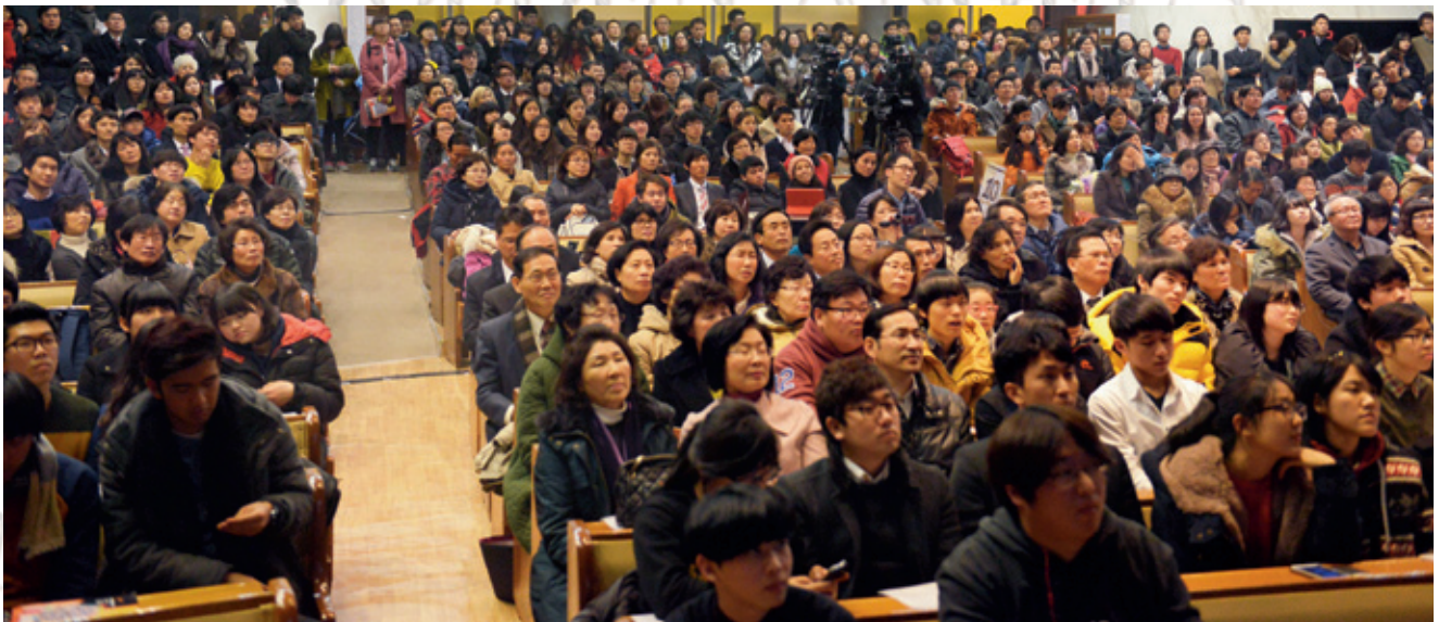
The Sahmyook University church was packed with people. The audience enjoyed the beautiful music of the Golden Angels.