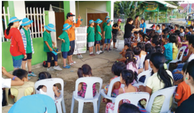
Children Missionary Movement members reach out to the people in the Philippines