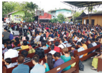
Participants of Mission to the Cities in the Philippines