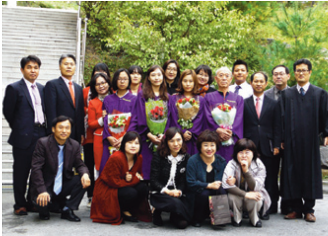
Newly baptized members at the Daejeon Sahmyook Middle School