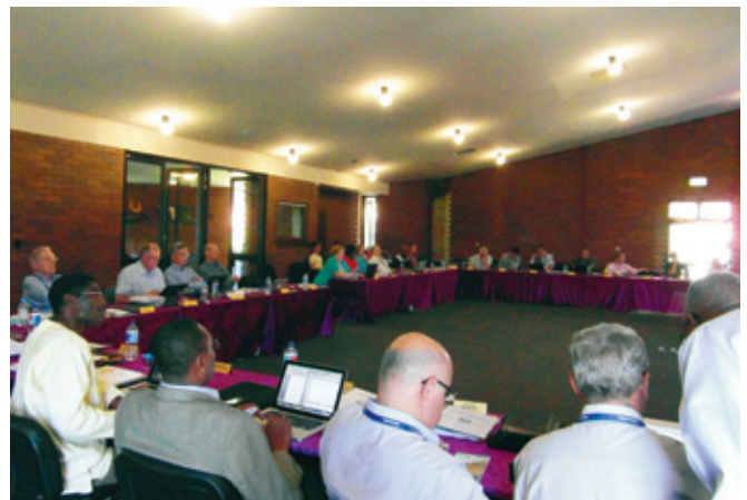
The Global Leadership Summit held in Avondale College, Australia