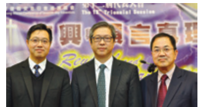
The newly elected Hong Kong-Macao Conference officers