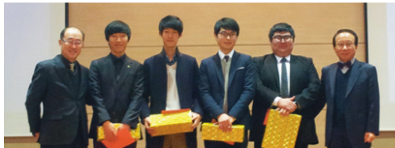
4 students from SHUC applied to be 1000MM missionaries