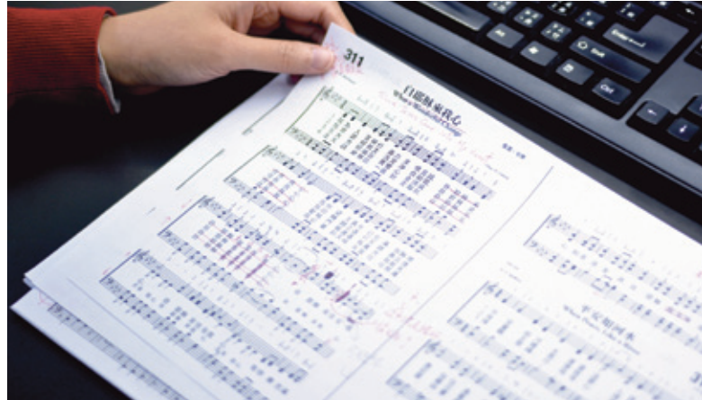
New hymnal of Chinese Union Mission

The translators made sure that the newly translated lyrics rhyme and that they are