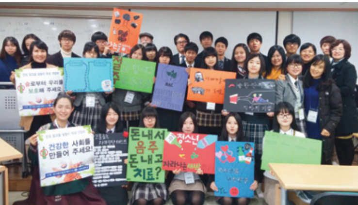
The first ‘Alcohol Alarmees’ members in Korea