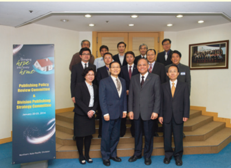
Publishing Policy Review Committee members