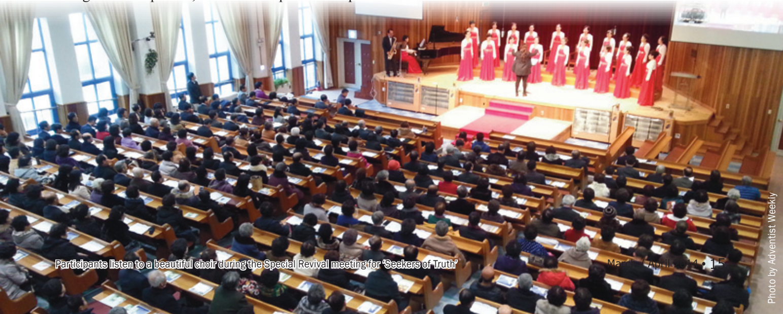
Participants listen to a beautiful choir during the Special Revival meeting for “Seekers of Truth”

The “Seekers of Truth,” with the help of the Local Missions Association, published 70,000 books and distributed them to all the Protestant pastors in Korea. They also hold regular Bible studies with Protestant pastors. More than 300 people are members of “Seekers of Truth.” Their donations are used to sponsor the new mission work of pastors who have left their work in other Protestant churches.