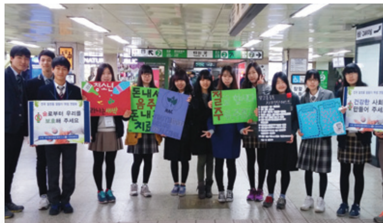
A group of students participating an Anti-Alcohol Campaign

The Korean Institute on Alcohol Problems has plans to create a network with organizations in Korea and throughout the world to develop a greater awareness and provide a depth of education on alcohol and the harm it brings to the individual, the family and to society.