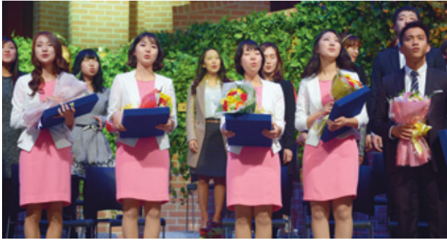
10th batch Golden Angels members received appreciation plaque