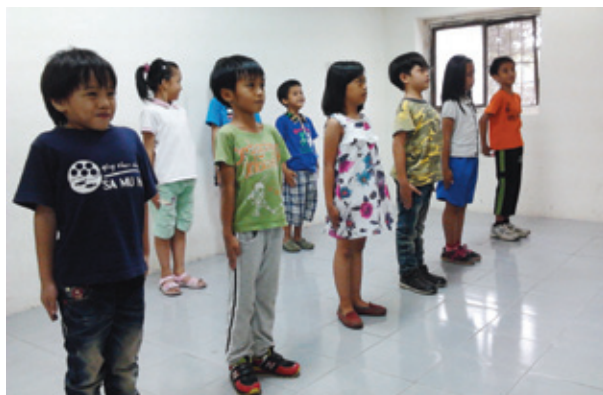
Children at an Adventist church on Green Mountain in Taiwan perform a special program