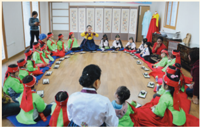
Children wearing hanboks learn the traditional New Year's bow