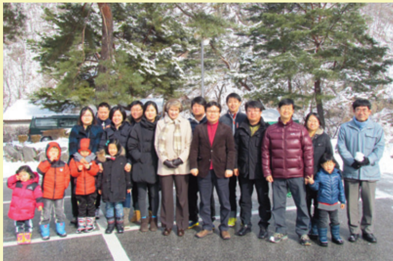
PMM pastors and family members. They finished 100 hours of missionary training.