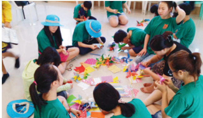
Children Missionary Movement members prepare materials for the mission activities

CMM was created as a result of the Northern Asia-Pacific Division Children's Directors Conference in June 2004, which took place in Hong Kong, to bring a revolution to children's work and to develop future missionaries. Every two years, since 2005, the CMM regularly sends missionaries.