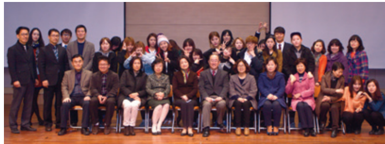
22 students of SHUC received baptism

On December 6 and 7, SHUC held their last baptismal ceremony for the year 2013 as 22 students received baptism. A total of 167 SHUC students received baptism during the year 2013. SHUC continues to strengthen its programs, helping students find stability in their local churches and encouraging them to participate in mission work so that they can lead others to Jesus.