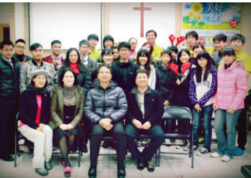
Beitun Church in Taiwan joined the HisHands Movement