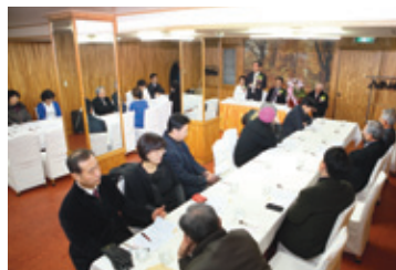
Share Life Association members