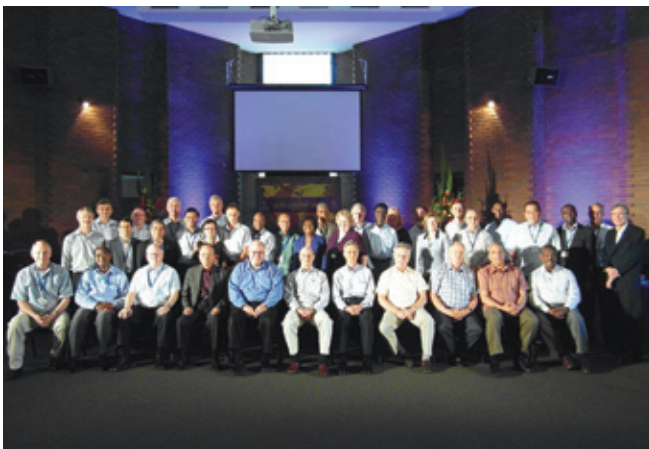
Adventist church leaders from all around the world