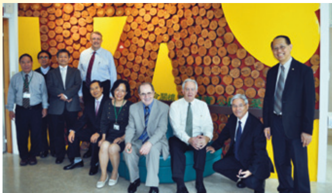
AAA Team with Taiwan Adventist College administrators

(AAA: Accrediting Association of Seventh-day Adventist Schools, Colleges and Universities)