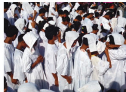
People are lined up to be baptized. 197 people received baptism through this evangelistic effort.