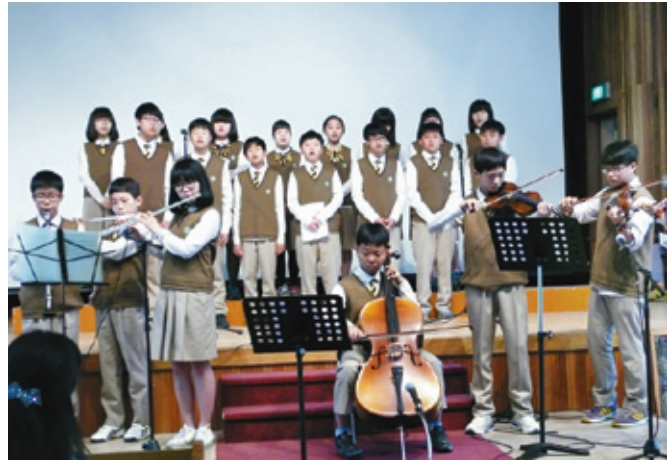
Students learn music and musical instruments at the school

According to the national scholastic assessment of 2013, Daejeon Sahmyook Middle School is now among the top 0.3% nationwide. Also, according to the scholastic assessment announced on February 2 of this year, Daejeon Sahmyook Middle School ranked 12th among 3,225 schools nationwide. The school’s vision is to “foster globally creative and outstanding students” through proper Adventist education, character development, and academic growth. Above all, Daejeon Sahmyook Middle School promotes knowledge, ethics and physical development based on the verse “love your neighbors as yourself.” The educational environment of the school is another one of its outstanding traits. For example, to create an atmosphere of comfort and happiness where students can feel at home, the school designed the classrooms and hallways like a house.