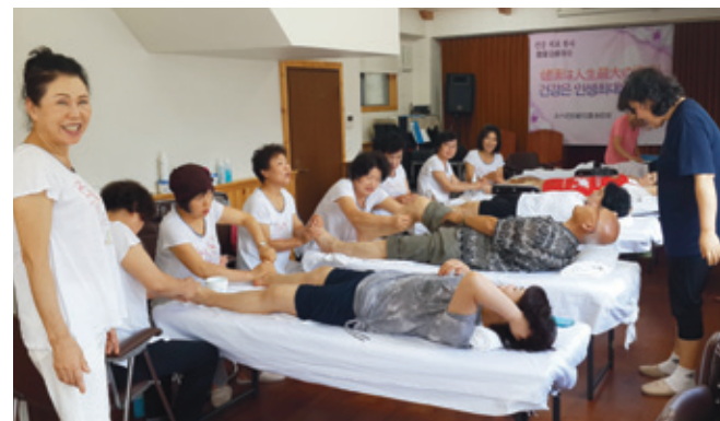
Korean Dandelion volunteers happily offer foot massage to Bible seekers.

There were thirteen members who participated in this outreach program. A group of Ephphatha medical mission volunteers were there to serve, and the Dandelion members offered foot massage. This was followed by