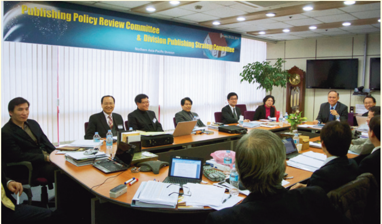
Publishing Policy Review Committee & Division Publishing Strategy Committee members discuss major agenda items. This meeting was a great learning experience to enhance the Publishing Ministries