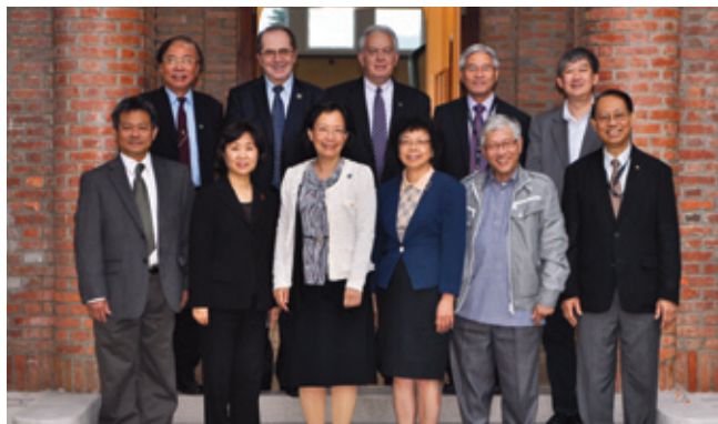
Hong Kong Adventist College administrators with AAA Team

A ccrediting Association of Seventh-day Adventist Schools, Colleges and Universities (AAA) visiting team made regular accreditation visits to Taiwan Adventist College (TAC) and Hong Kong Adventist College (HKAC) from November 5 to 7, 2013, and November 10 to 12, 2013, respectively. These are the only two colleges in the Northern Asia-Pacific Division (NSD) offering bilingual programs in Chinese and English.