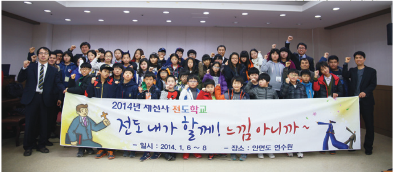
Participants of the Three Angels' Children's Evangelism School. The children who attended this program are now confident in their faith.

Children are being trained so that they, too, can be missionaries. From January 6 to 8, 2014 the children's department at Middlewest Korean Conference opened a "Three Angels' Children's Evangelism School." The training program took only three days. However, through topic discussion and practical exercises, the program was truly beneficial to the children. The main activity during this time period was memorizing Bible verses, enabling the children to later remember and explain the verses when necessary. While