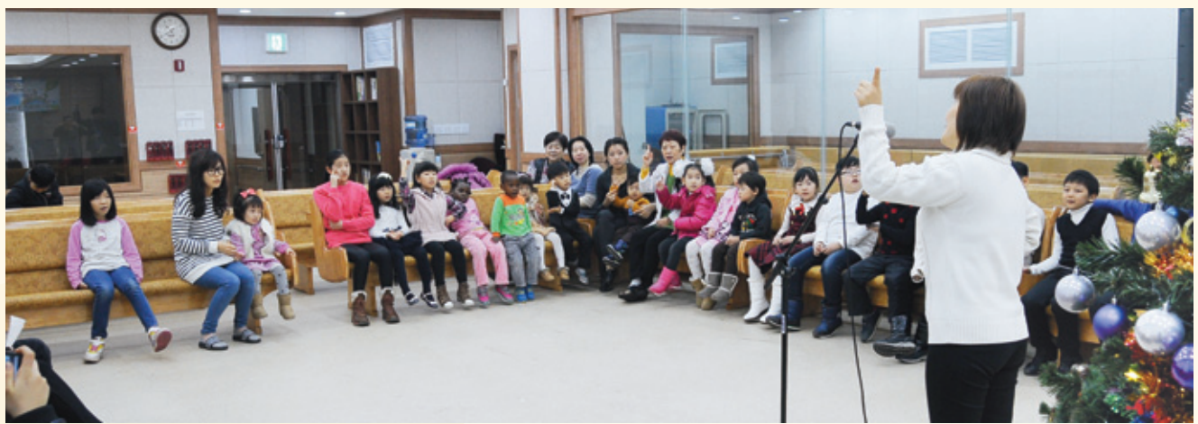
Children learn about Jesus through Winter Vacation Bible School

From January 14 to 23, the children at the center went to the Happiness Etiquette Education Center in Ansan City to learn the Korean traditional New Year’s bow and to experience the traditional ways of drinking teas and to play traditional games. They had lots of fun playing the traditional game yut and learned to wear a hanbok as they practiced their New Year’s bow. As Korea continues to grow as a multicultural society, the center is taking steps to put more effort into educating the second generation of our international friends.