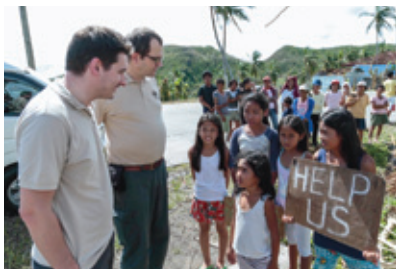
Girls in the Philippines ask for help after the disaster

The Hong Kong government Disaster Relief Fund has given a grant of HK$3 million to the Adventist Development and Relief Agency China (ADRA China) to provide food relief to survivors of Typhoon Haiyan in the Philippines.