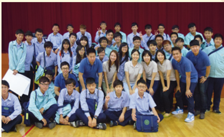
Golden Angels members with students during the PMM evangelistic activities

an important role during the evangelistic meetings, drawing many people to the churches. Their music was like an early sunrise on a calm morning delicately touching souls and directing them to see the righteous Son of God. Doesn’t the saying go like this, “As the night deepens, doesn’t the dawn draw closer?” The Gospel is going forward in desolate lands through the dedication and sacrifice of these PMM missionaries. Our hearts tremble with great expectation as we look forward to the work God is going to carry out in the year 2014.