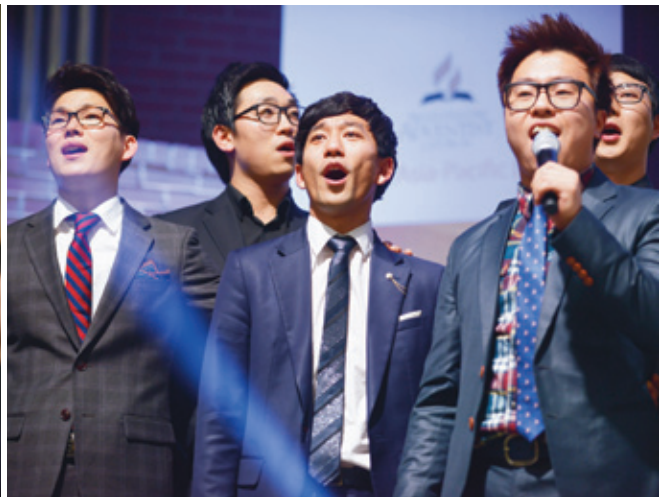
Golden Angels male singers