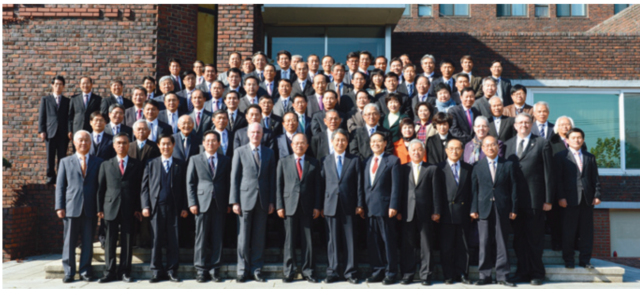
Delegates of the 2013 Korean Union Conference Annual Council