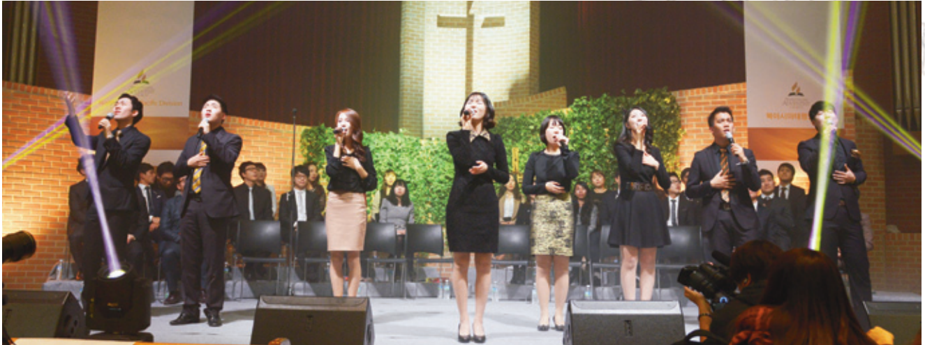
10th batch Golden Angels members praise God during the 10th Anniversary Concert