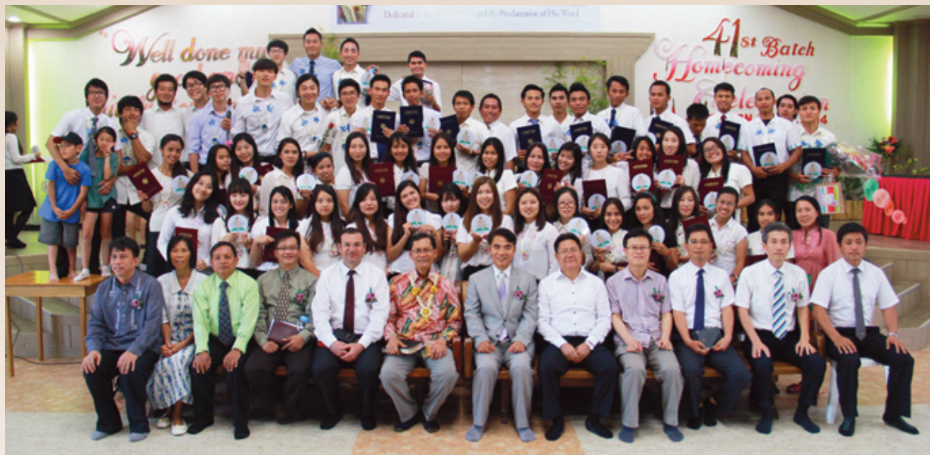
41st batch 1000MM missionaries during the Homecoming Celebration. They have faithfully finished their one year of service for the Lord.

came back to the fold, and six chapels and four churches were constructed. The 41st batch pledged before God and before those who were present, including former missionaries, new missionaries, and church members, that they would forever be missionaries. As these missionaries go back to their home countries, we pray that God will work through them and that they will follow His calling.