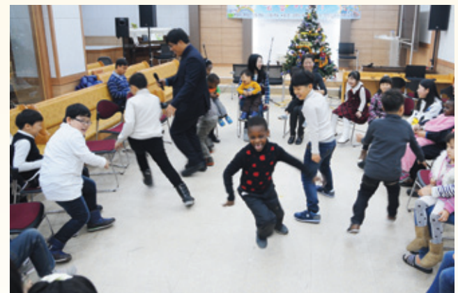
Programs include fun activities for the children