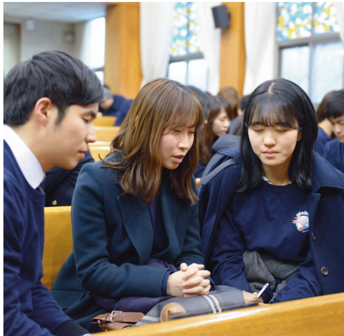
They prayed together with united spirits before the activities