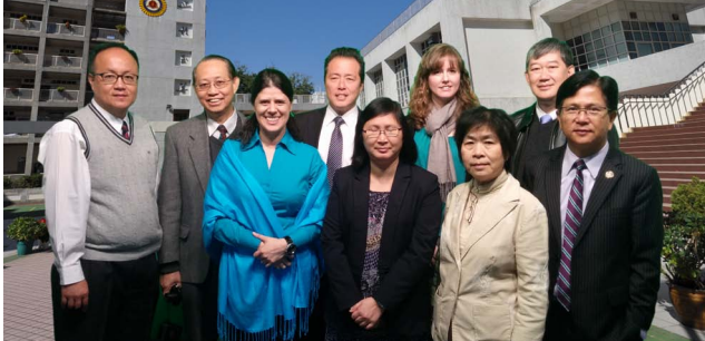
Evaluators with TPSY Administration