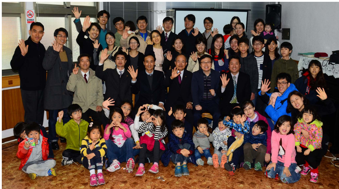
PMM families attend Family Revival Meeting in Taiwan