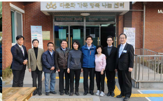
MFSC staff pose for a group picture with the governor