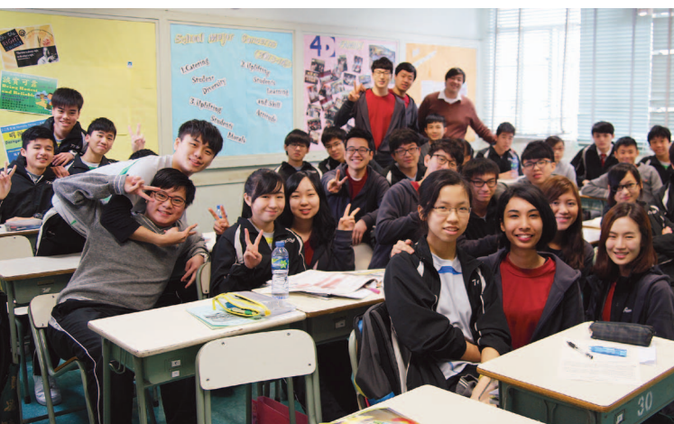
11th Golden Angels visit a class at TaiPo Sam Yuk Secondary School