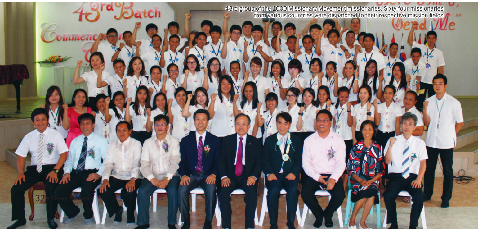
43rd group of the 1000 Missionary Movement missionaries. Sixty-four missionaries from various countries were dispatched to their respective mission fields