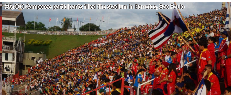
35,000 Camporee participants filled the stadium in Barretos, Sao Paulo