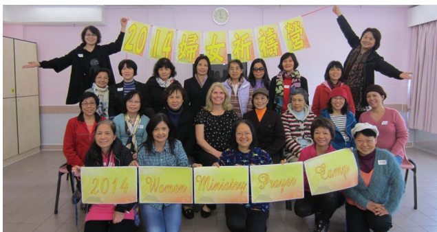
26 Adventist women in Hong Kong joined together to experience the power of prayer during the Prayer Camp