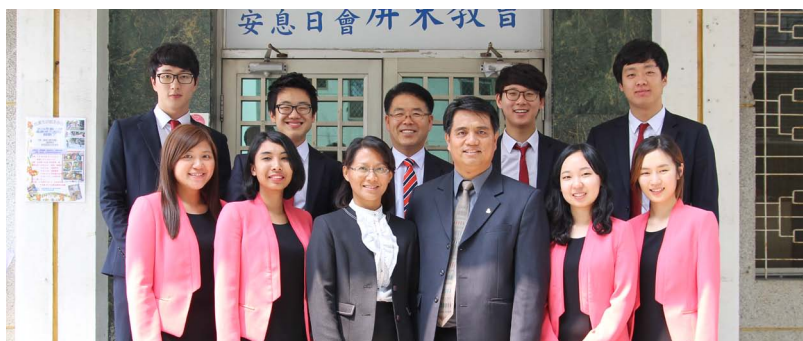
11th batch of Golden Angels worship God with music at Ping Dong Church on Sabbath