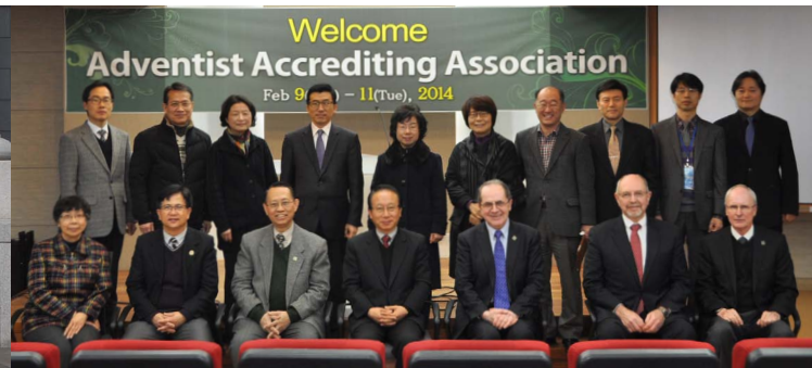
AAA committee members with SHUC leaders and staff

The Accrediting Association of Seventh-day Adventist Schools, Colleges and Universities (AAA) made an interim visit to Sahmyook Health University College (SHUC) from February 9 to 11, 2014. This visit was one of the conditions for accreditation recommended in the regular evaluation visit in 2012. Because there was a change of leadership at SHUC and also because there was a major concern about the physical development of the school, the visiting team felt that it would be appropriate to review SHUC's progress toward fulfilling the recommendations by the last evaluation committee.