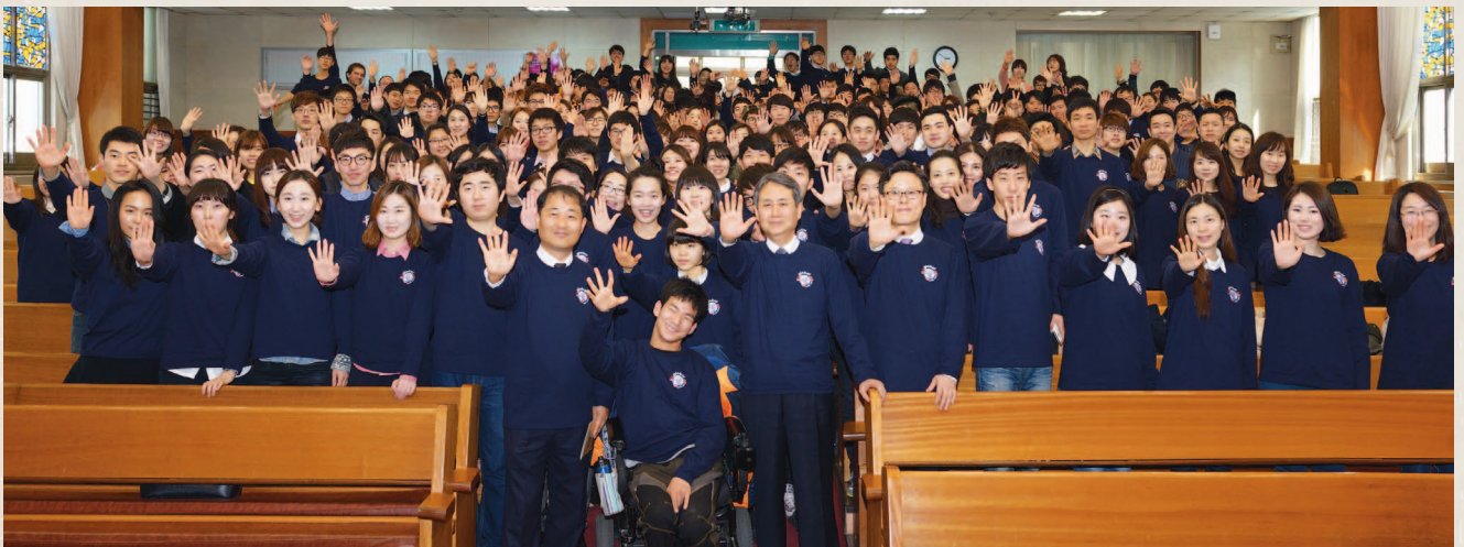
Korean Adventist youth chant for mission activities on Global Youth Day at the Seoul English Institute Church