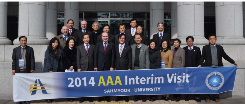
Sahmyook University leaders welcome AAA committee members