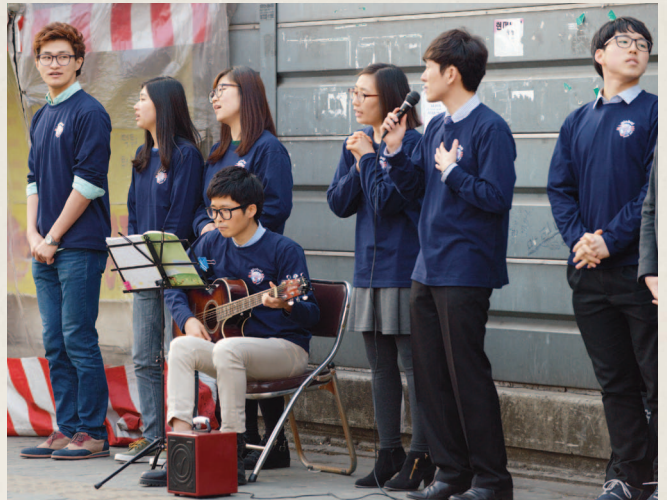
A group of young Adventists doing street evangelism