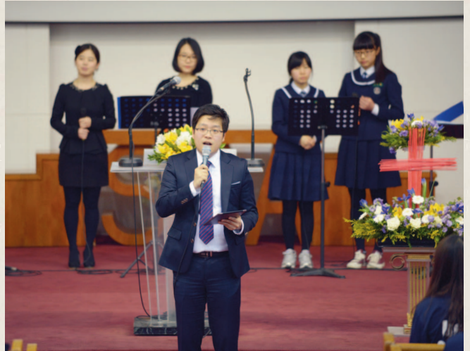
Praise team from the CheongRyang district led the worship and praise