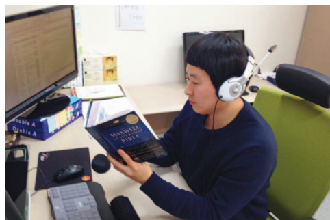
CLAP members can learn English while memorizing Bible verses through Scripture songs