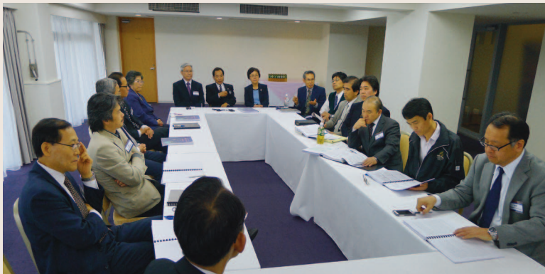
Japan Union Conference brainstorming session