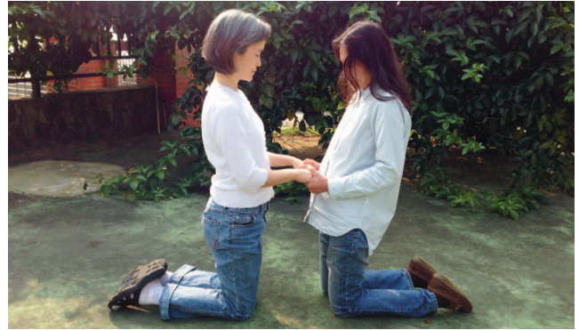
"Women Can Do" seminar participants hold hands together to pray for Women's Ministry in Taiwan

Seventy percent of Taiwan Adventists are women; the ratio of women to men is quite high. Many more women seem to be enthusiastic and proactive in the church. If these women are led and utilized, their influence would be tremendous. Participants encouraged each other through activities, and all of them were willing to serve and offer financial assistance for the ministry. Although there were only 15 women who