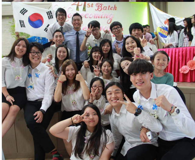
Above: Missionaries enjoy the mission activities at the mission fields Below: 1000 MM missionaries who finished their one year service

guidance, the financial capacity of the 1000MM will be bigger and deeper by repeated emptying and filling. To make such a miracle possible, the unconditional faith of leaders should grow, and focus on financial affairs should increase. I am sure that God will help us.