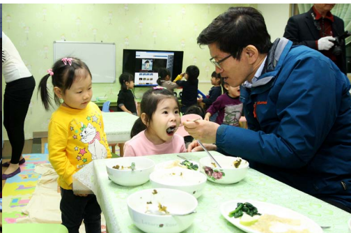
Governor Kim MoonSoo feeding a child at the kindergarten inside the MFSC