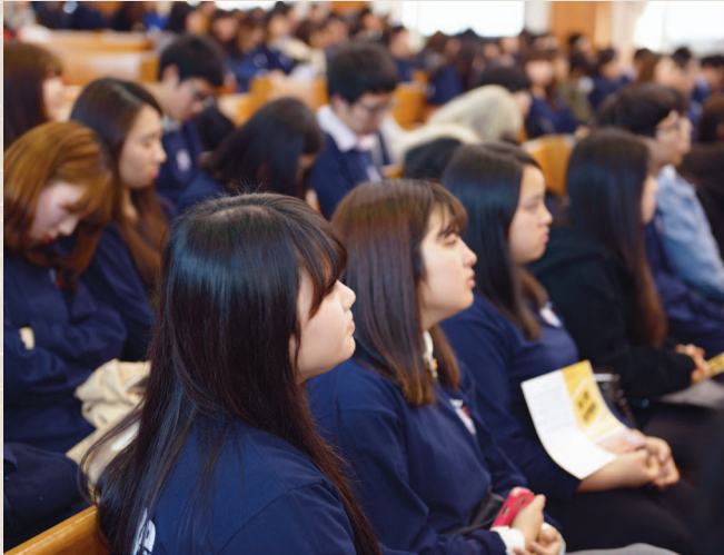
Global Youth Day participants attentively listen to the message during the special worship