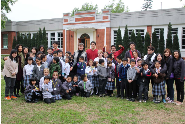
HKAC and HK Adventist Primary School hold a gospel week

Hong Kong Adventist College (HKAC) was our second mission field from March 17 to 22, 2014. There, we also experienced God's grace. God used imperfect human beings, the Golden Angels, to preach His gospel at HKAC. Consequently, many students raised their hands to praise the Lord.