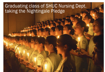
Graduating class of SHUC Nursing Dept. taking the Nightingale Pledge