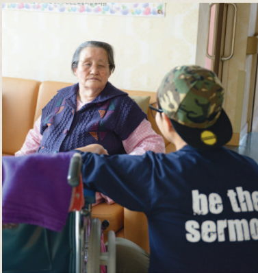
A young man spends time taking care of an old lady