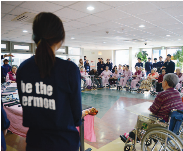
A group of Korean Adventist youth held music concert for the elderly at the YuJaWon Nurshing Home