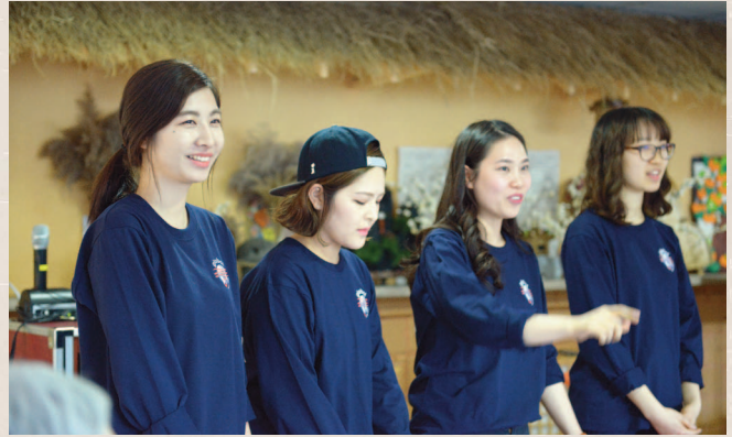
Korean Adventist ladies present a special program for senior citizens