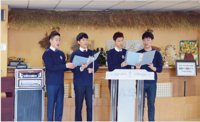
A men's quartet sings a beautiful melody for the elderly at a nursing home