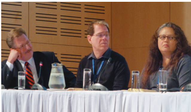
Another panel discussion