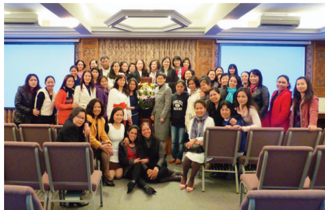
Hong Kong International Church members on International Women’s Day of Prayer

The church’s women’s ministries department is very