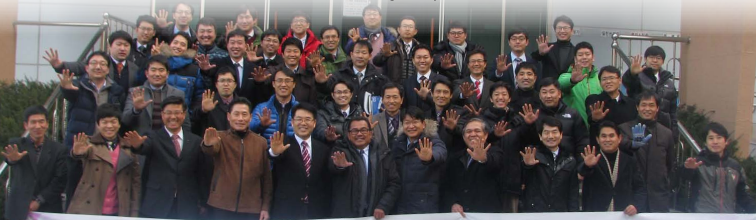
Korean pastors who are in charge of youth ministries in local mission councils. Pastors were able to grasp some new ways of effective youth ministries through this seminar.

In addition, there were also discussions about the Youth Leader Congress and 2014 Korean Adventist Youth Convention, which will be held in Taiwan in February next year and at Sahmyook University this coming June, respectively.