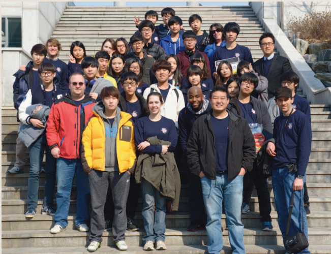
KAPA (Korean Adventist Preparatory Academy) students came to Seoul all the way from YangPyeong to participate in Global Youth Day