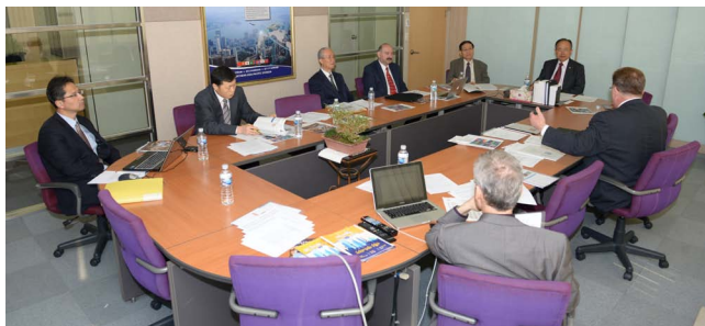
Editors of Adventist World magazine discuss major agenda