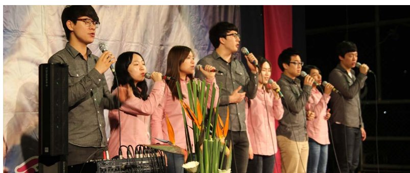
Golden Angels hold a concert for Ching Shan Church members