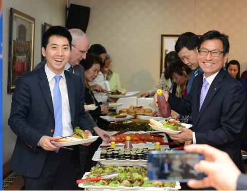
Invited Mission Day visitors enjoy lunch at NSD office