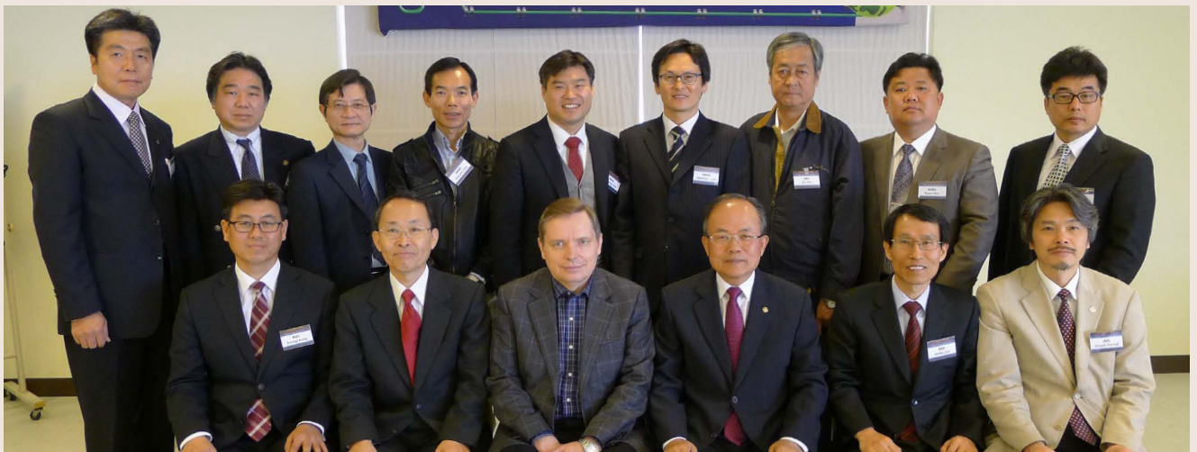
Retention and Reclamation coordinators of each union and conference