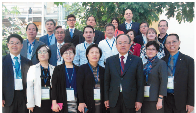
Group photo of NSD delegates at the Convention Center

The program was power-packed with devotionals. Panels addressing the main issues behind alternative sexualities, studies into hermeneutics of texts often used to condone homosexuality and presentations covering the social, legal, ethical and medical perspectives rounded out the conference. Breakout sessions were held both at the Pavilion