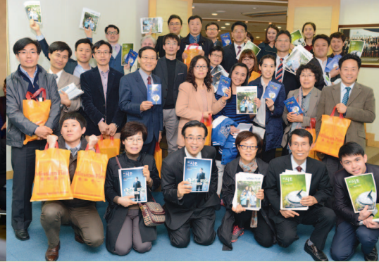
NSD leaders and staff holding tracts and booklets