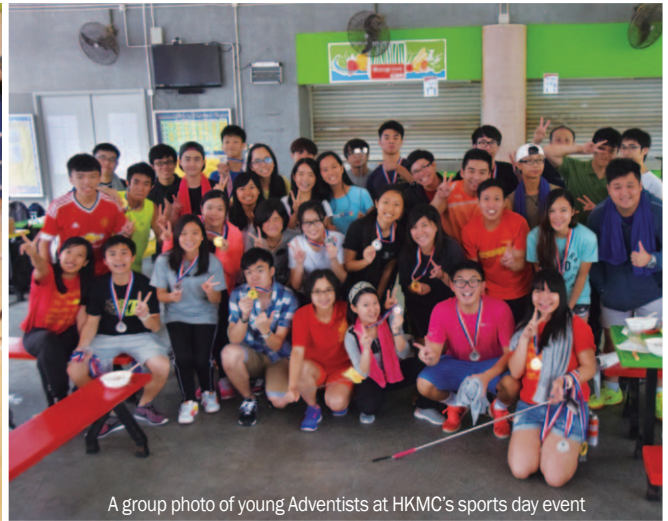
A group photo of young Adventists at HKMC's sports day event