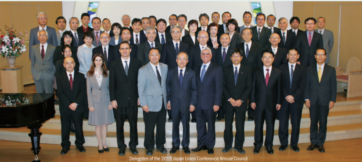
Delegates of the 2015 Japan Union Conference Annual Council