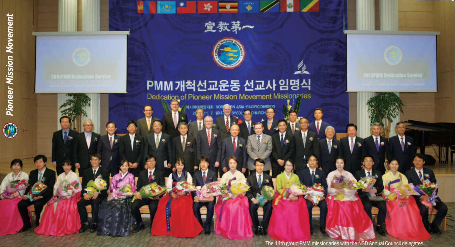
The 14th group PMM missionaries with the NSD Annual Council delegates.