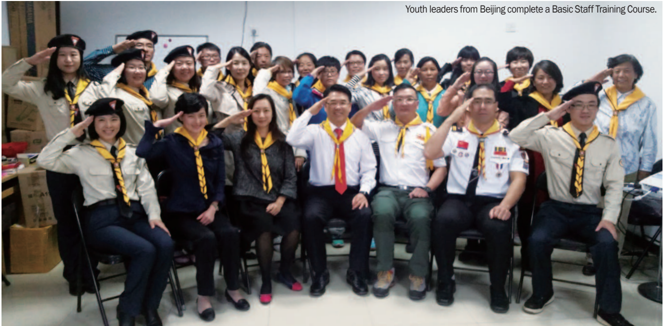
Youth leaders from Beijing complete a Basic Staff Training Course.