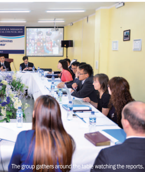
The group gathers around the table watching the reports.

Please pray for God's Church in Mongolia!