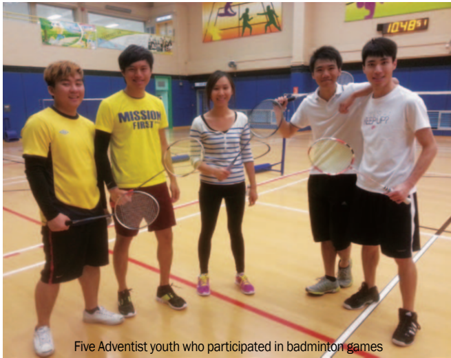
Five Adventist youth who participated in badminton games