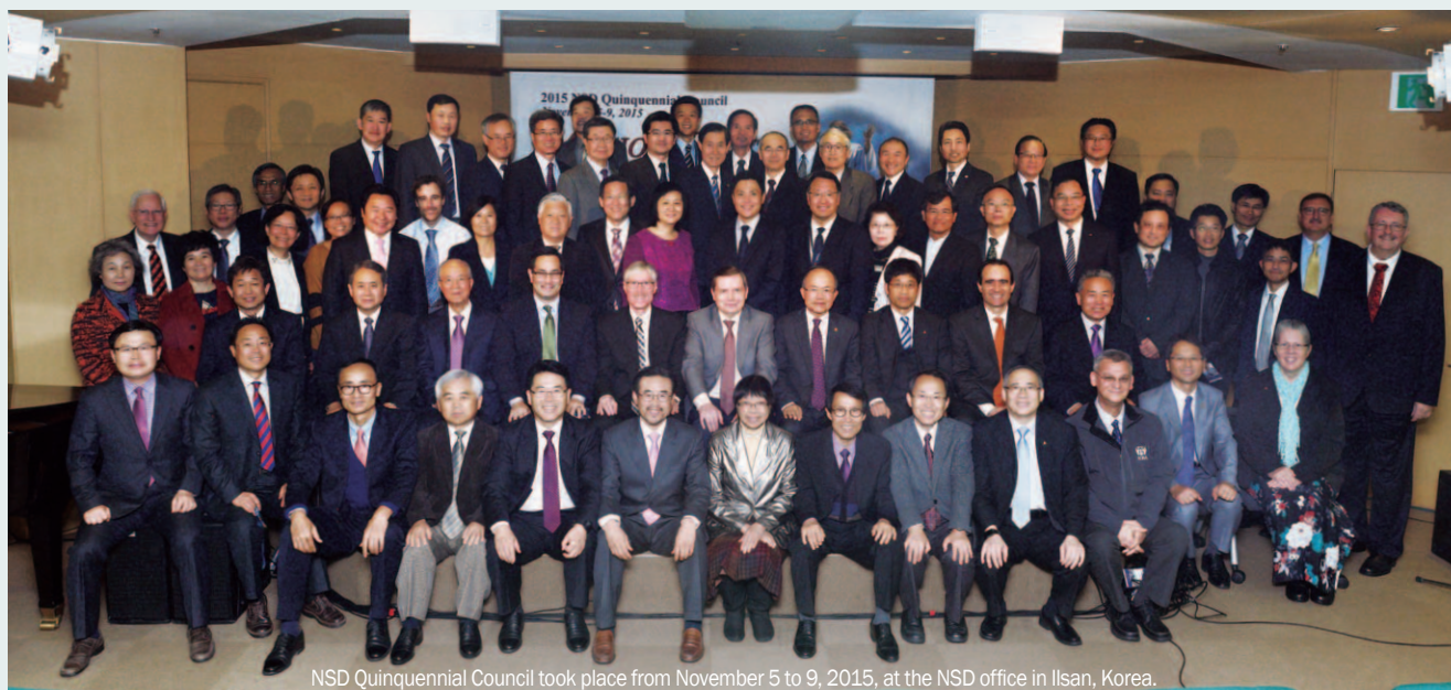
NSD Quinquennial Council took place from November 5 to 9, 2015, at the NSD office in Ilsan, Korea.