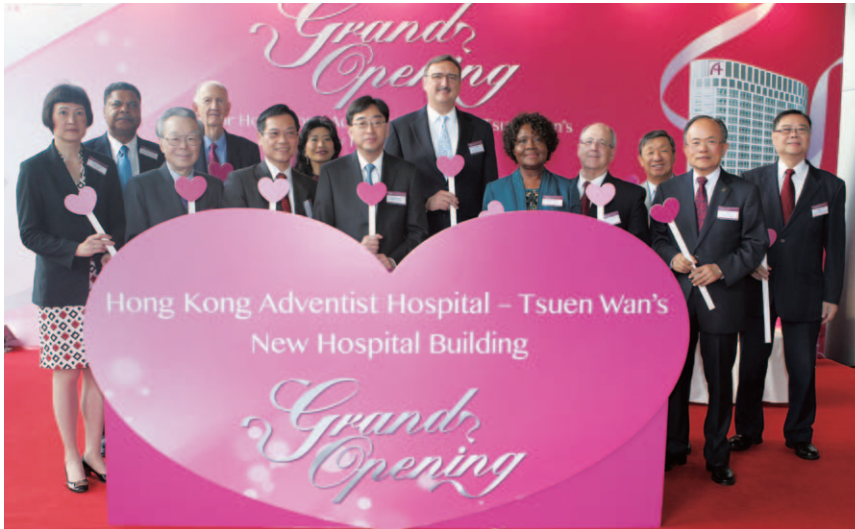
The guests of honor ushering in a new era at Hong Kong Adventist Hospital – Tsuen Wan