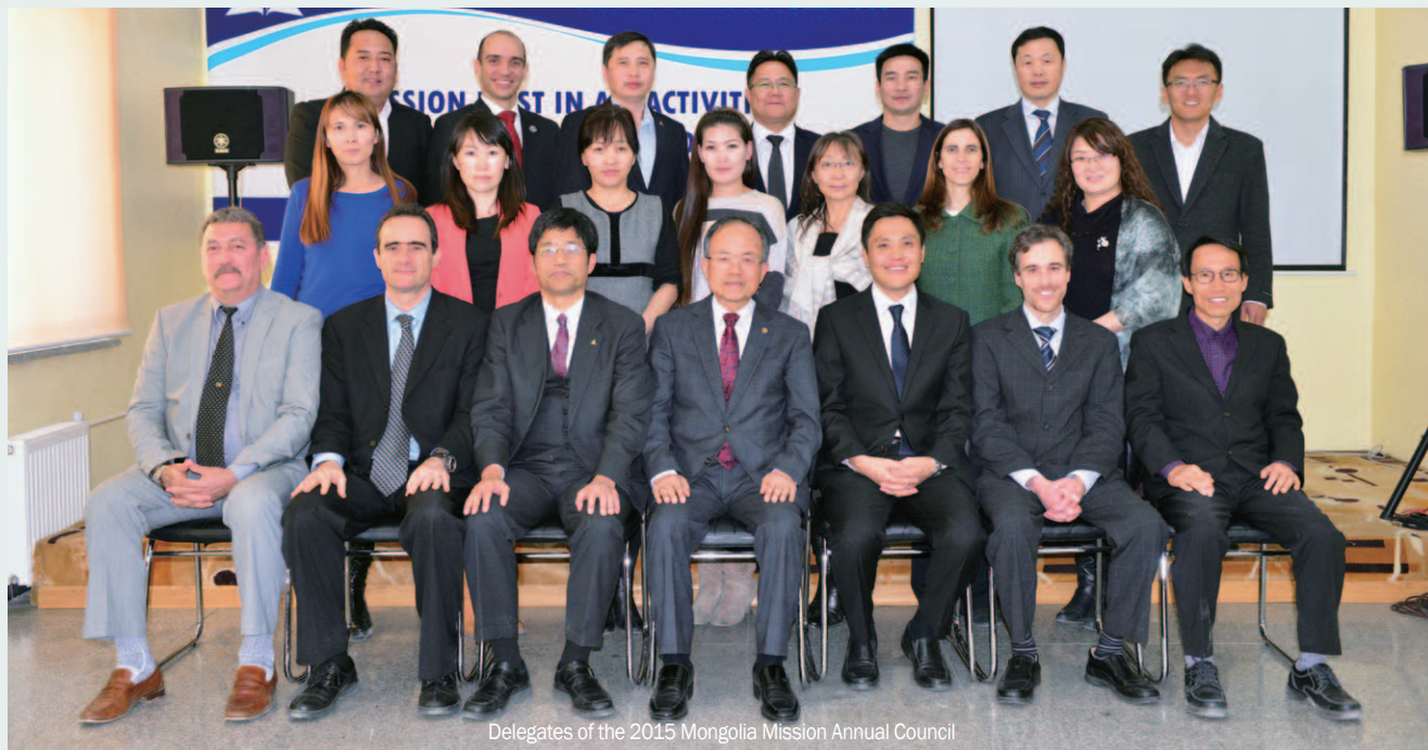
Delegates of the 2015 Mongolia Mission Annual Council