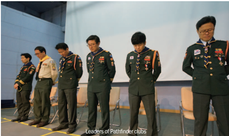
Leaders of Pathfinder clubs

congress. Members felt that it was difficult to study the Bible, but they became more and more used to it and worked together with one another. It was a great experience for us to learn how to read and study the Bible.”