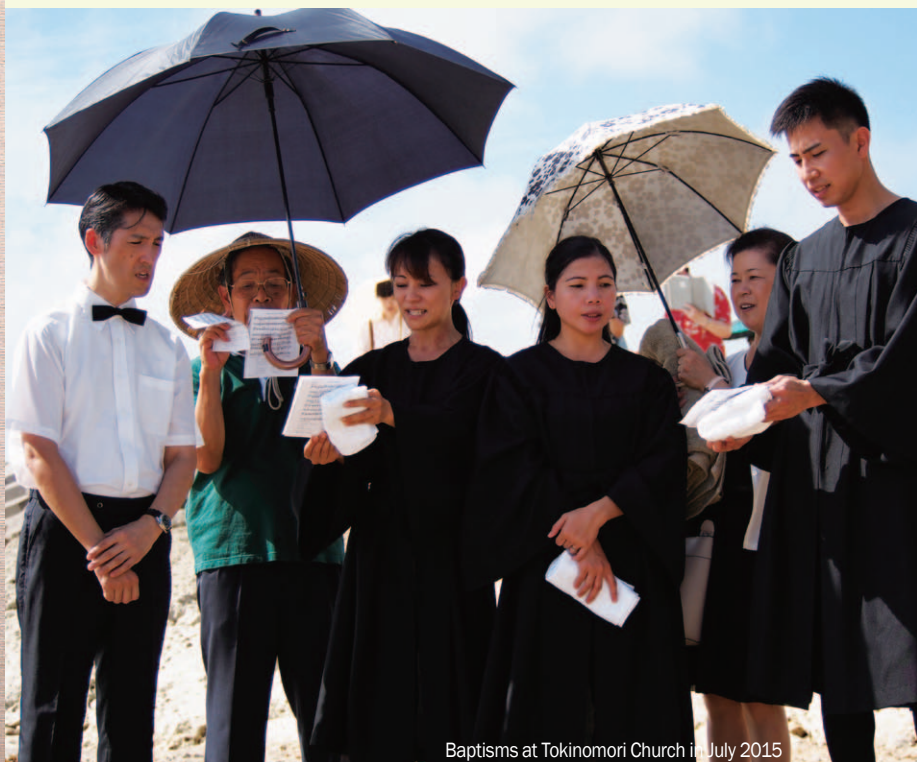
Baptisms at Tokinomori Church in July 2015

Evangelism among the local churches seems to be slowly bearing fruit. The following list includes lessons we learned in the process of engaging in the Big City evangelism efforts.