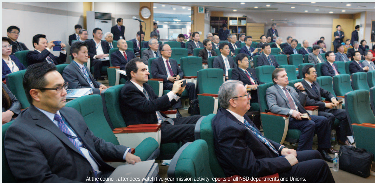
At the council, attendees watch five-year mission activity reports of all NSD departments and Unions.

We pray that God may rain down His Holy Spirit abundantly to bless the NSD's new quinquennium 2015-2020, the goal "Vision One Million 2020," and the new leadership team by refreshing the spirit of Mission First in all activities to reach out to the world!