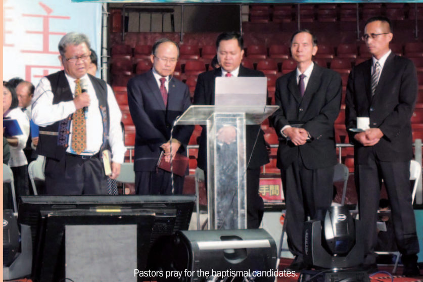
Pastors pray for the baptismal candidates.