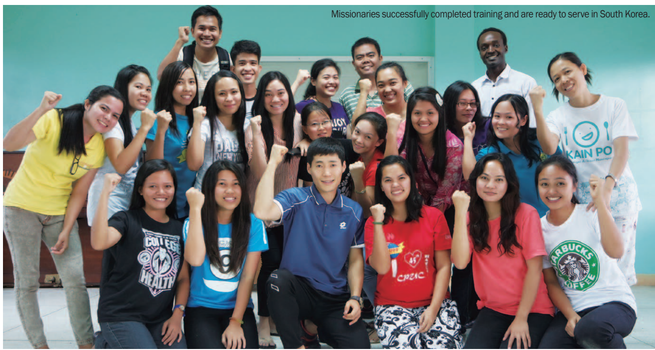
Missionaries successfully completed training and are ready to serve in South Korea.