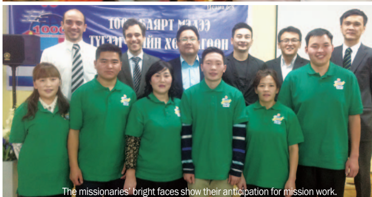
The missionaries’ bright faces show their anticipation for mission work.

graduates, relatives, and friends gathered to attend the 1000MM graduation that was held at Bayan Khair Church in Ulaanbaatar. Six ordained pastors laid their hands on the new missionaries, dedicating them to the service and asking God’s blessings and the power of the Holy Spirit over each one of them. Even though the graduates have not been sent out yet, they have already received God’s call. God will send them out in His time and then, they may say boldly as Isaiah, “Here am I, send me” (Isaiah 6:8).