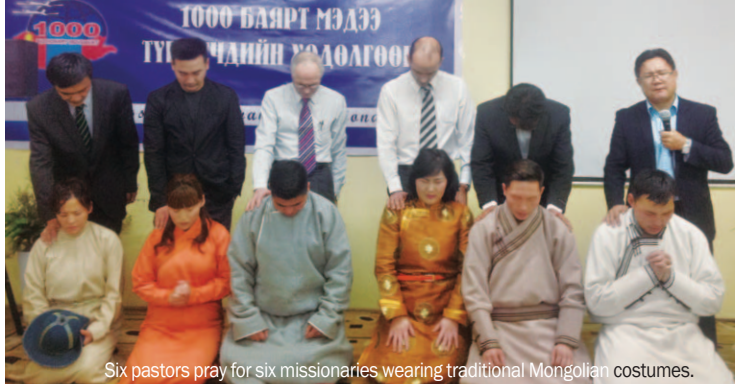
Six pastors pray for six missionaries wearing traditional Mongolian costumes.

At the graduation ceremony, the missionaries wore traditional Mongolian costumes, and many of them, with bright eyes, shared their powerful testimony about the missionary training and how God had blessed and guided them along this path. Administrators, local pastors, church leaders, lay members and other missionaries as well as