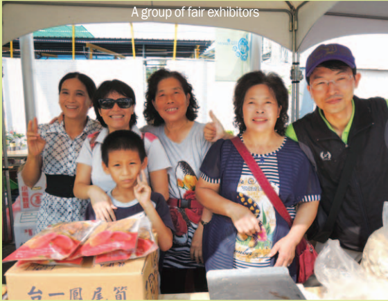
A group of fair exhibitors

Programs included a joint worship, musical praises, LOHAS (Lifestyles of Health and Sustainability) and health promotion activities, a fair, etc. Considering that in the past 60 years, few have come to know our church, it was a great opportunity to reach out to the public and increase the public's awareness of our church. Praise God for the success of the programs and glory to His name!