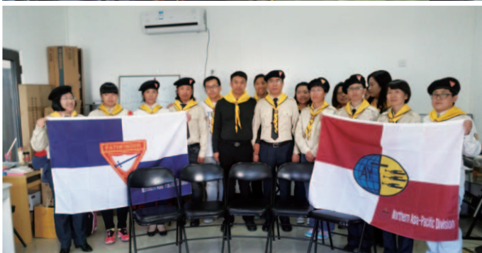
Above: Attendees of the training course learn the art of knot tying. Below: Youth leaders hold the Pathfinder and Northern Asia-Pacific Division banners.

The Pathfinders ministry of Chinese Union Mission (CHUM) before and after the 2012 Northern Asia-Pacific Division (NSD) Pathfinder Camporee look distinctly different. Before the Camporee, the main concern for pastors working for youth ministries in CHUM was trying to figure out “how to nurture the youth in our church and guide them.” However, the Pathfinder work is now finding its place as the best youth ministries program.