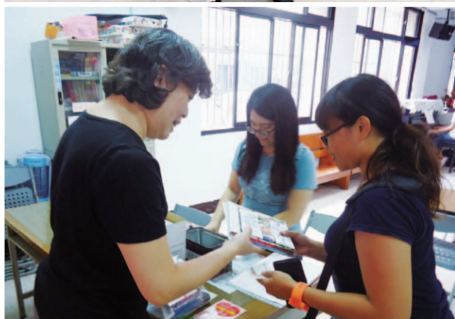
Above: Local people receive free hairstyling from volunteers of Taiwan Conference. Below: The conference introduces various books published by an Adventist publisher in Taiwan.