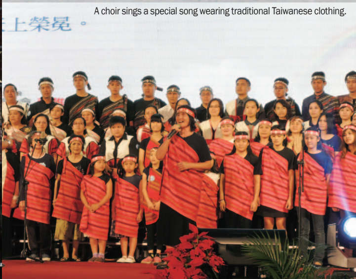
A choir sings a special song wearing traditional Taiwanese clothing.

Our goal for the 2015 City Evangelism Project was that 3,000 would attend and 100 would be baptized. More than 30 decisions for baptism were to come from churches within the project district. We also expected to see Fongshan Church become the first “evangelistic church” in the TWC as an evangelism model for the rest of the churches. The goal was to fully utilize this precious opportunity to make Fongshan Church the greatest success of the 2015 City Evangelism Project.