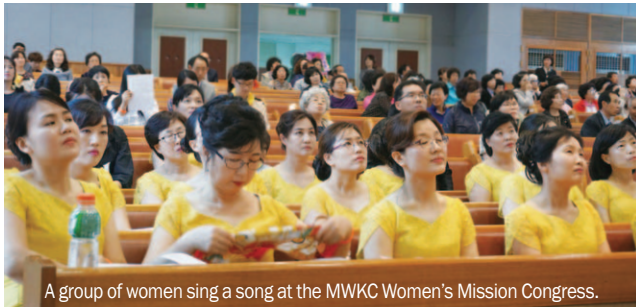
A group of women sing a song at the MWKC Women's Mission Congress.