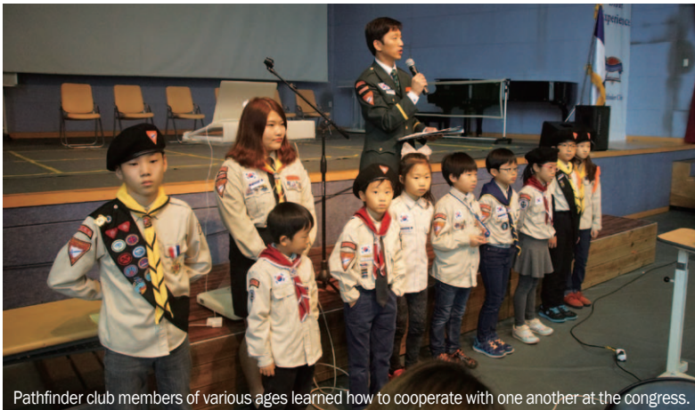
Pathfinder club members of various ages learned how to cooperate with one another at the congress.