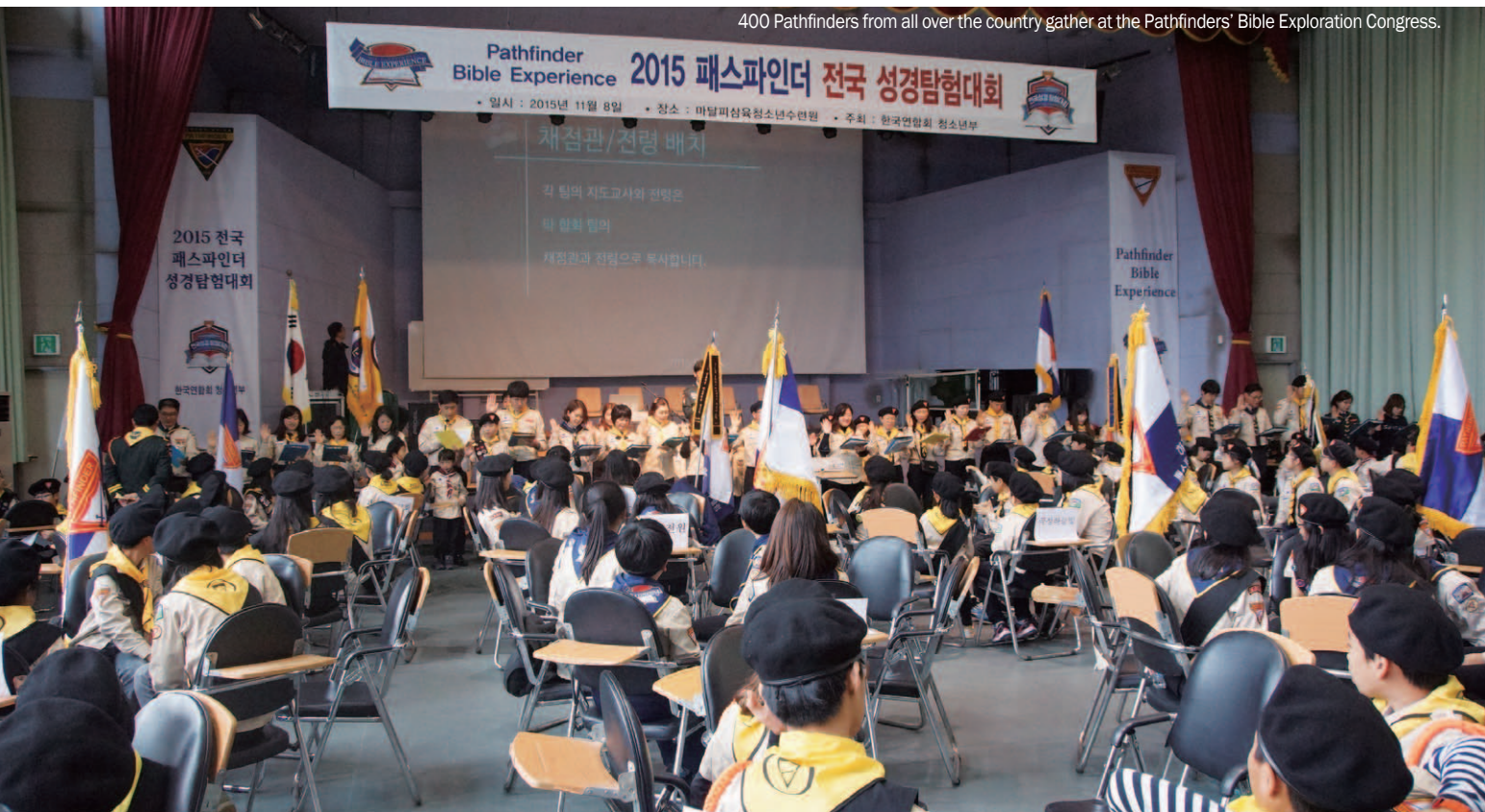
400 Pathfinders from all over the country gather at the Pathfinders' Bible Exploration Congress.

Sahmyook Retreat Center. The theme was the book of Genesis. This was the first nationwide Pathfinders' Bible Exploration Congress in Korea. The 400 members and leaders from