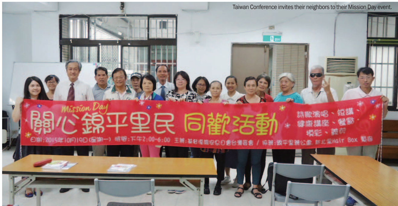
Taiwan Conference invites their neighbors to their Mission Day event.

Taiwan Conference was able to build a bridge between the conference and the local community through this event. We see a possibility of leading our neighbors to Jesus and completing our mission.