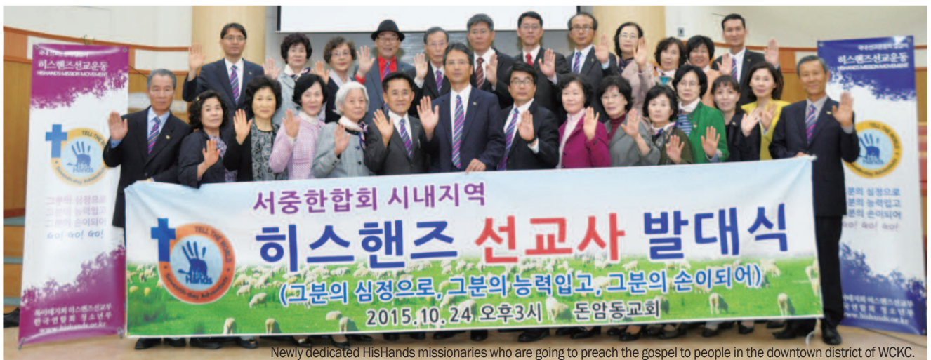
Newly dedicated HisHands missionaries who are going to preach the gospel to people in the downtown district of WCKC.

Twenty-four newly dedicated HisHands missionaries gave their pledge as missionaries before God and the Church. "I will look up to Christ on the cross every second, and I will put all of my heart and passion into mission work."