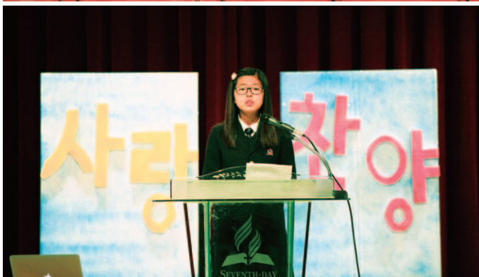
Above: A team of six children on stage at MWKC Children’s Bible Love and Praise Festival Below: An elementary school student participating in a Bible recitation test