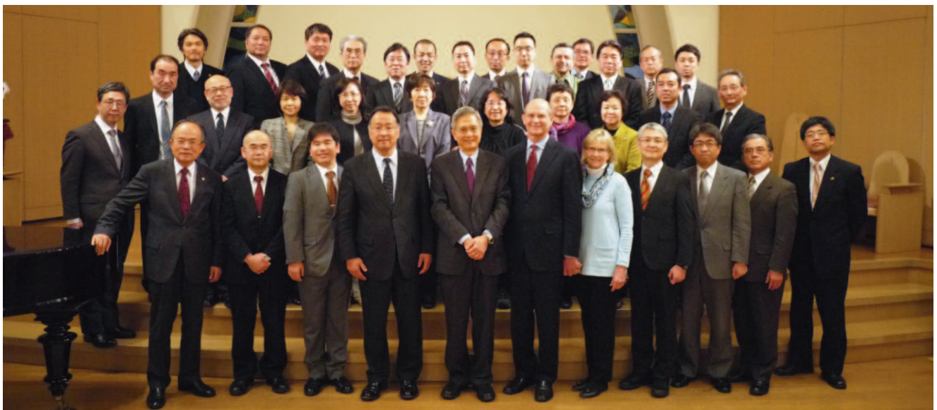
Japan church leaders and GC officers discussed the evangelistic campaign scheduled for May 2018 in Japan.