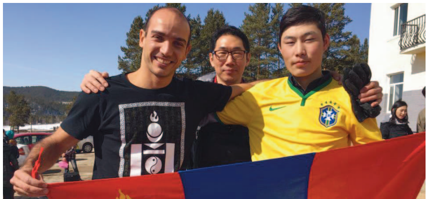
Multi-cultural missionaries from Brazil, Mongolia, and Korea have one and the same mission.

“The Lay Congress was remarkable for me. I learned that when we share the gospel with our ‘neighbor,’ our faith is also revived because the more