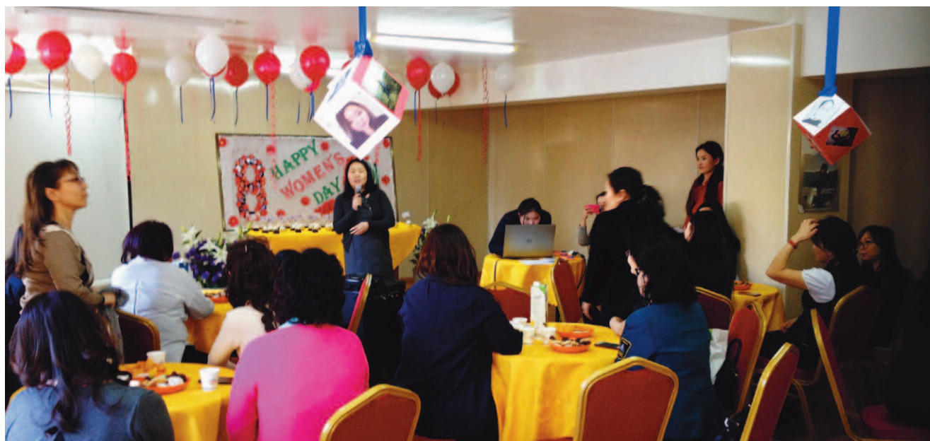
Tusgal Adventist School invited students' mothers and had a celebration with various programs.

All the mothers were thrilled and touched by the honor they received. Our school also paid tribute to all the women employees by handing them roses and cookies. And with that, we celebrated Mother's and Women's Day in Tusgal Adventist School, in Ulaanbaatar, Mongolia.