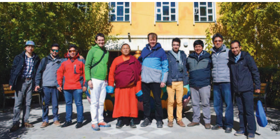
Chilean students, theology teachers from Chile Adventist University and a Mongolian Tibetan-Buddhist monk (Lama) in a monastery in Ulaanbaatar.