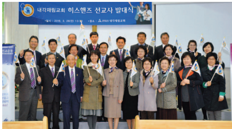
Above: Pinning ceremony during the HisHands dedication service at Naegak Church.