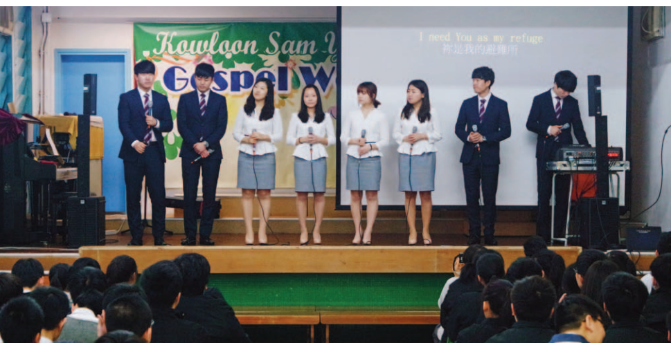
Golden Angels sing a praise song at Kowloon Sam Yuk Secondary School.