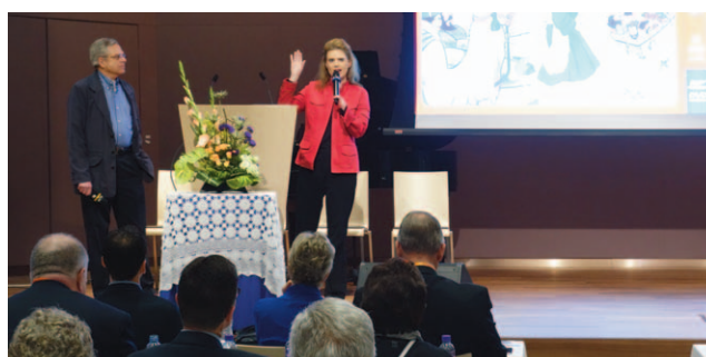
Various ministries were reported at the convention.

The delegates presented many reports from their fields of ministry. They asked how they could better assist in the work in the Unorganized Territory (UT). The meeting itself was an eye-opening experience for many delegates who wanted to learn more about the UT, despite the fact that most of them had attended the Convention multiple times over the years. “The UT is one of the most challenging fields. The Adventist churches there are dynamic and pose new questions on a regular basis,” one delegate commented.