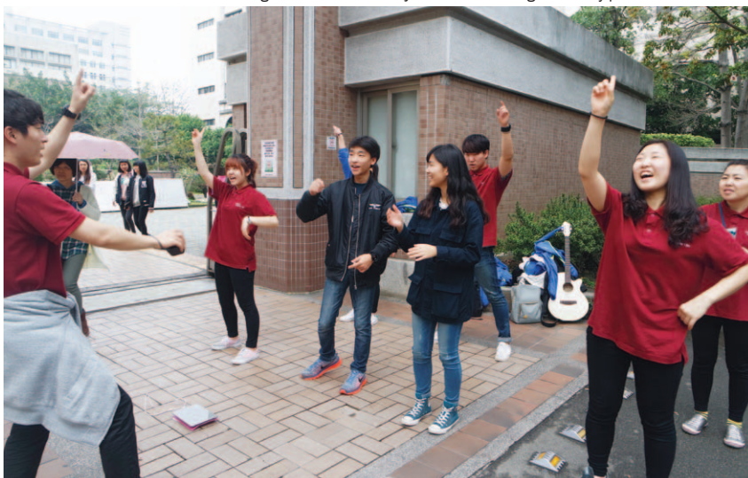
College students in Beitun join the Golden Angels as they perform on the street.

God is so great that the Beitun Church baptized sixteen souls through this evangelistic series. We pray that these sixteen people who were baptized, will be disciples of God, and make other disciples.