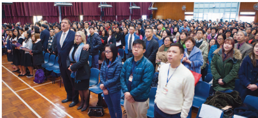
Many Adventist church members from different parts of Hong Kong gathered to celebrate a Sabbath together after the Lunar New Year festival.