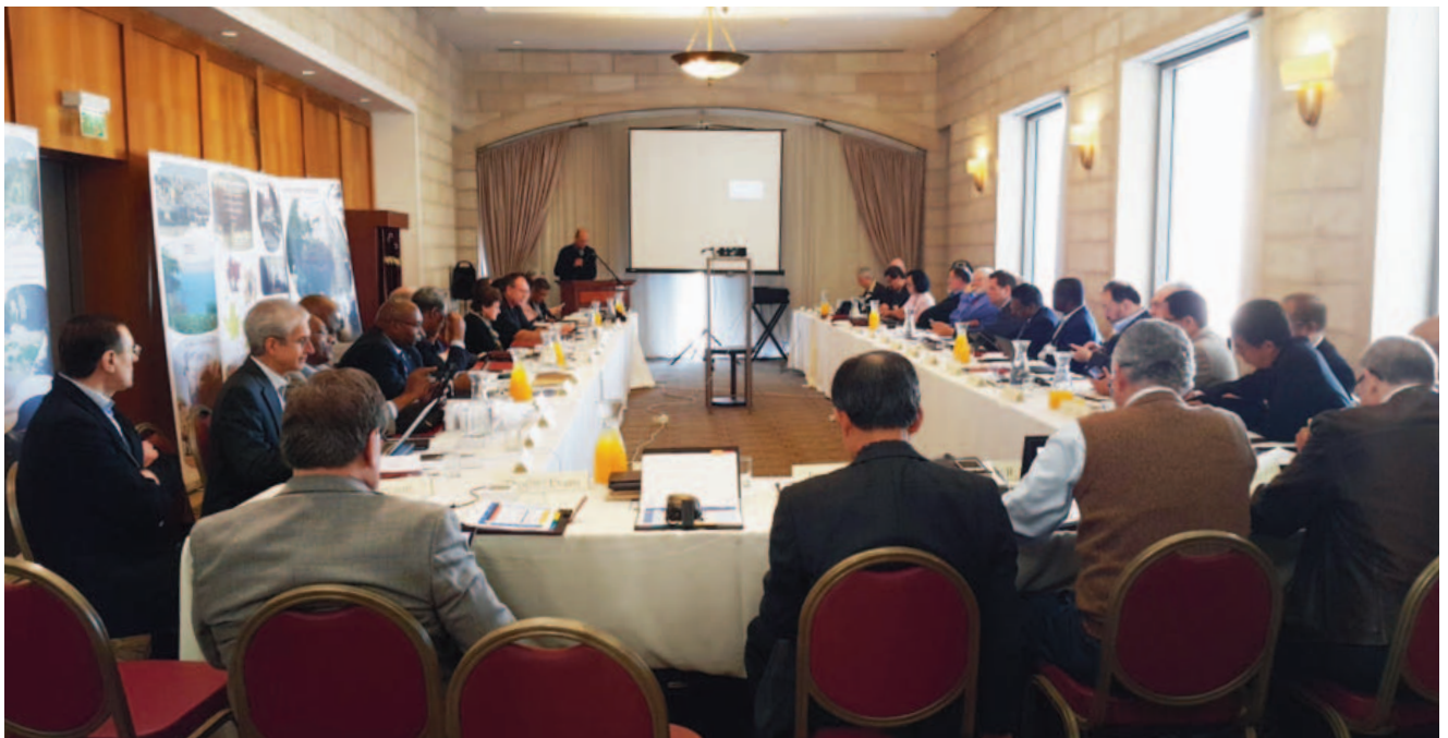
The 9th Global Leadership Summit was held in Jerusalem, Israel. Leaders from the GC and the 13 Divisions attended to discuss various matters of church leadership.