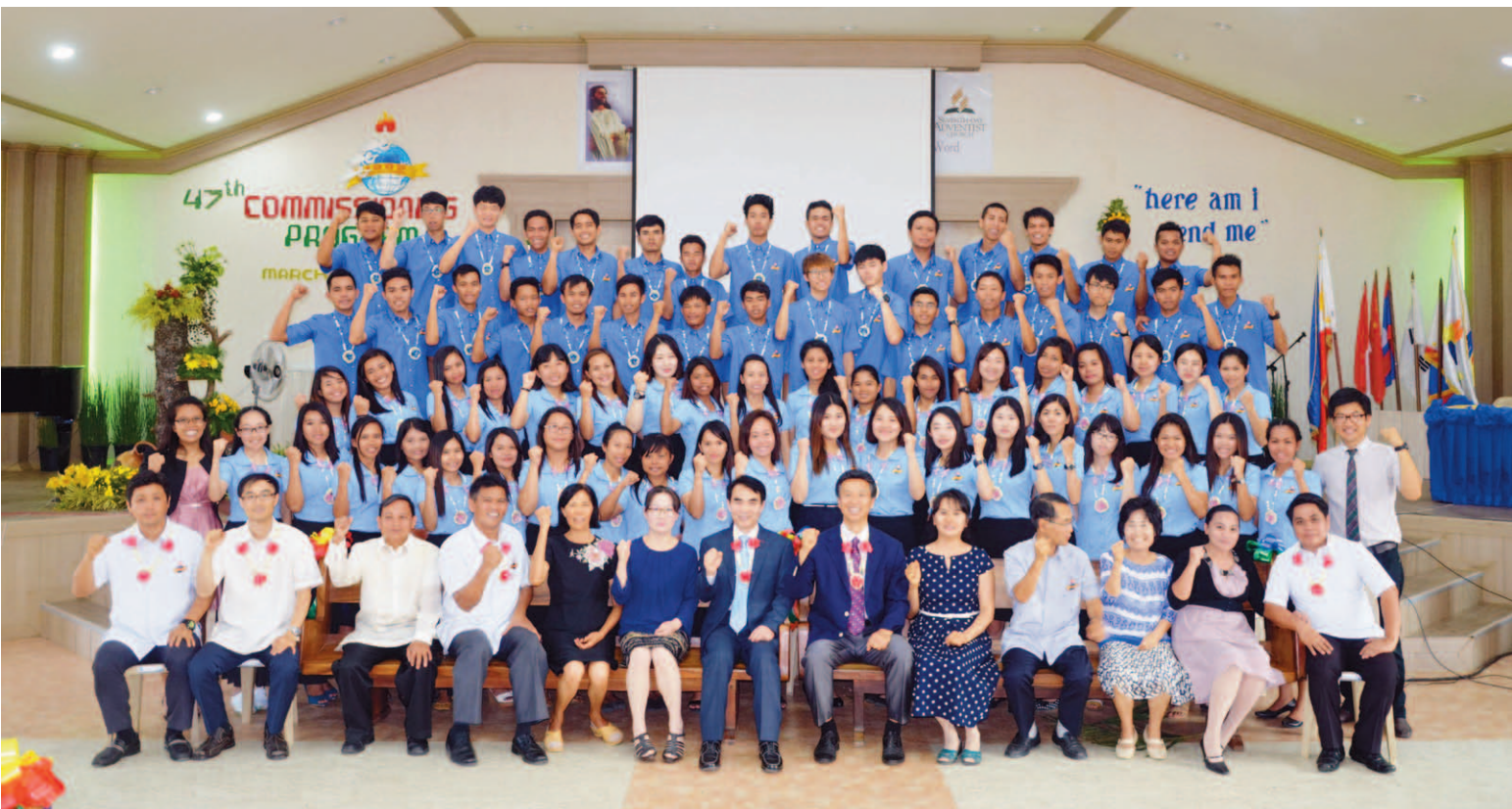
A graduation ceremony for the 47th batch of 1000MM missionaries, made up of 68 people from 5 countries.