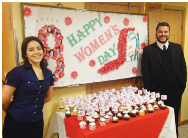
Tusgal Adventist School prepared the Women's Day event.

In the afternoon, we invited the mothers of the secondary students, too. We decorated the school cafeteria using the pictures of the mothers and their children. The tables in the cafeteria were also arranged in such a way that they could eat their snacks in groups while having conversations.