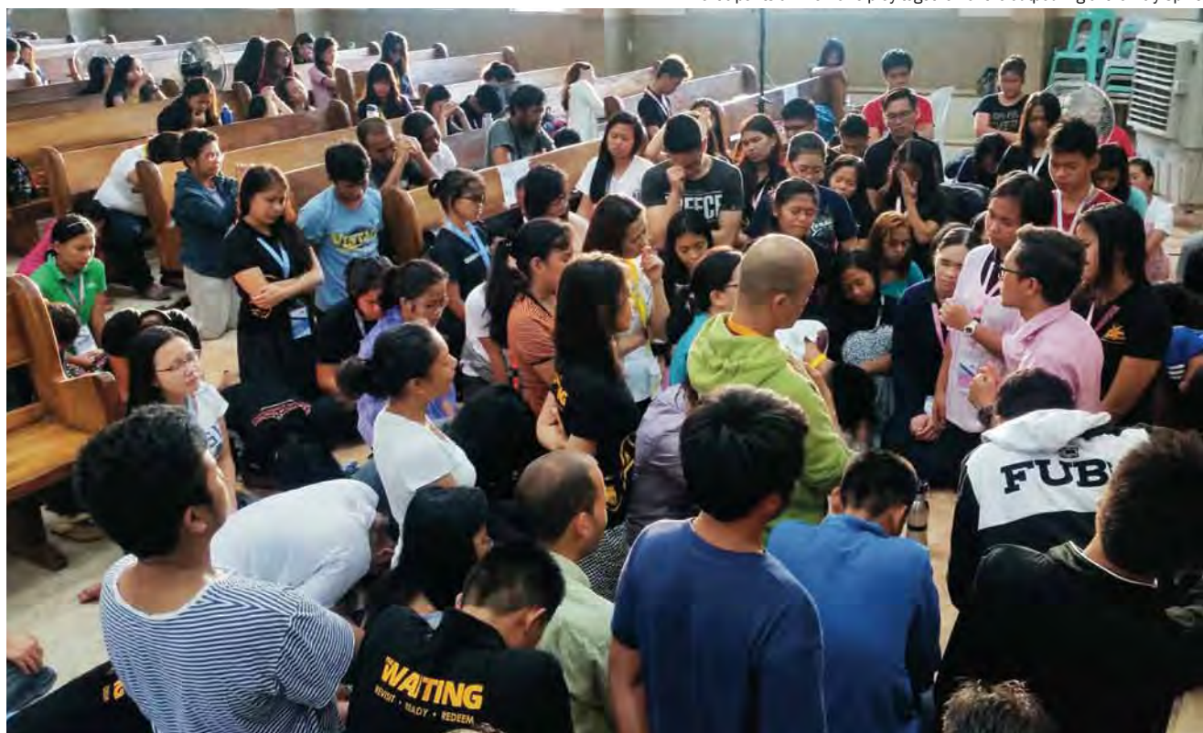
Participants of PYC 2016 pray together for the outpouring of the Holy Spirit.

Sabbath was the highlight of the event. From midnight to 5 a.m. everyone gathered inside the church for an all-night prayer and devotional time. At the stroke of midnight, the PYC choir sang “The Midnight Cry” accompanied by the PYC ensemble. Heavenly music and genuine joy filled the campus. It was a blessed and blissful event indeed!