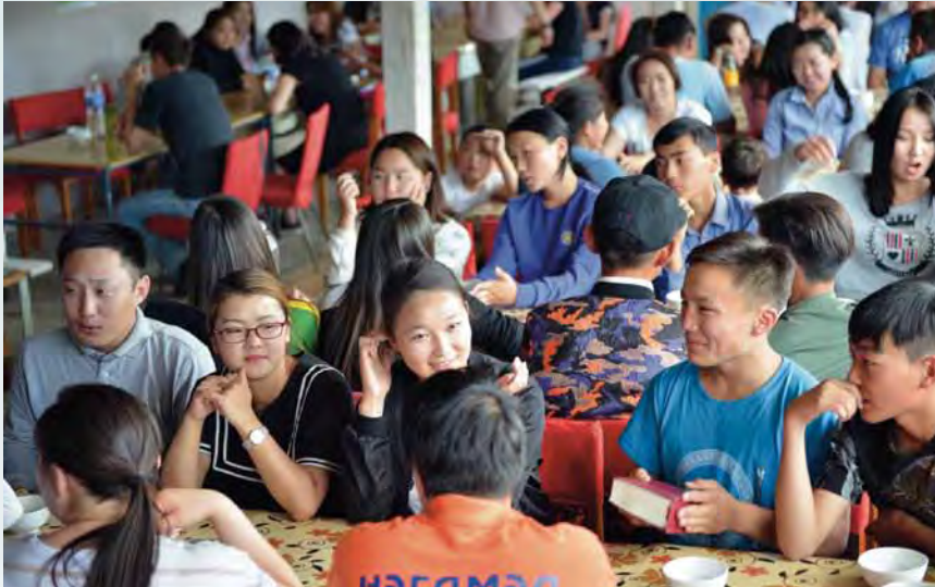
Young Mongolians have a good time together during the youth camp.

In that appeal to the group, I could see a silent appeal being made by the Holy Spirit to our own hearts – a call to mission which happens not only when we take a passport with a visa and go to the “uttermost parts of the earth” (Acts 1:8), but an appeal to the eternal and continuous mission that happens wherever we are, wherever we work and wherever we live— a mission that has no geographical boundaries, but that calls us to live God’s dream of sharing the privileged opportunity to say yes to the calling of the One who sacrifices Himself for us. This message was so unprecedented to the Mongolian youth that it revived and strengthened itself in us too.