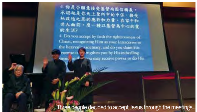
Three people decided to accept Jesus through the meetings.