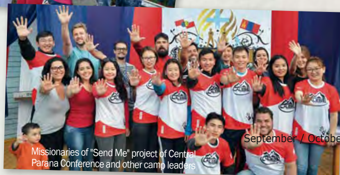
Missionaries of “Send Me” project of Central Parana Conference and other camp leaders