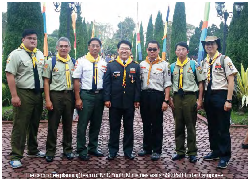
The camporee planning team of NSD Youth Ministries visits SSD Pathfinder Camporee.