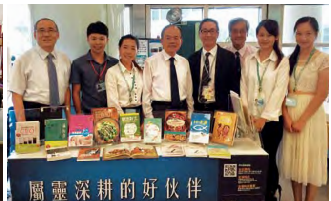
NSD leaders and the Taiwan Adventist Hospital president visited the student literature evangelists at the hospital entrance.