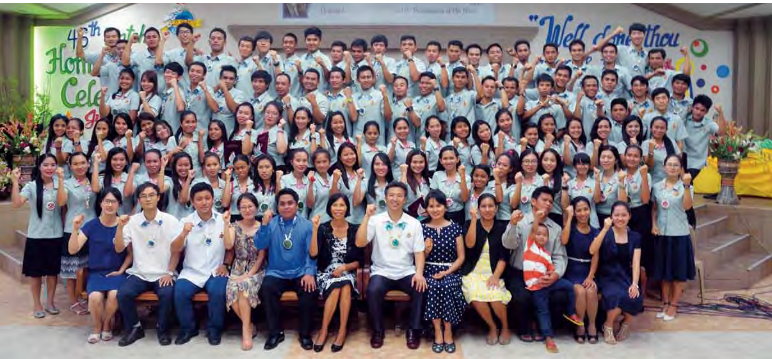
46th batch of 1000MM missionaries at their homecoming ceremony