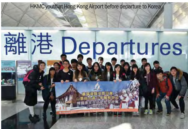
HKMC youth at Hong Kong Airport before departure to Korea

philosophy, and the spiritual heritage of the Adventist Church. They were taught the details of Pathfinder courses and activities, Adventist Youth Clubs, and ministry through praise. The participants were also given time to share the vision and experiences of youth ministries.