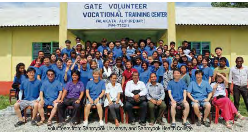
Volunteers from Sahmyook University and Sahmyook Health College