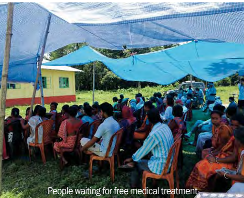
People waiting for free medical treatment.