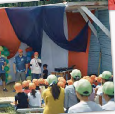
The 6th Children's Camp in Mongolia was organized by MM Children's Ministry and nine South American volunteers.

year, to have our children's camp in our Youth Training Center (YTC)," she said.