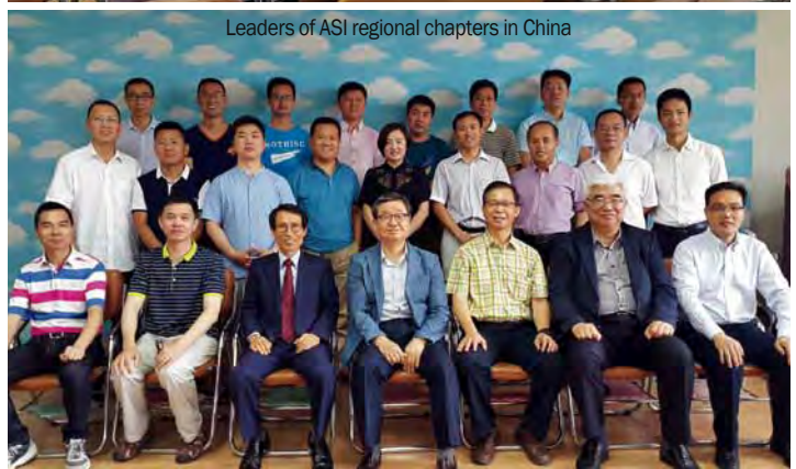
Leaders of ASI regional chapters in China

meetings. Whenever they meet, instead of talking about their own business items, they spend time praying for other business people. This regional ASI started the Bezalel Youth School for opening new business. They had conferences in 2014 and 2015 to introduce new businesses to youth in the church.