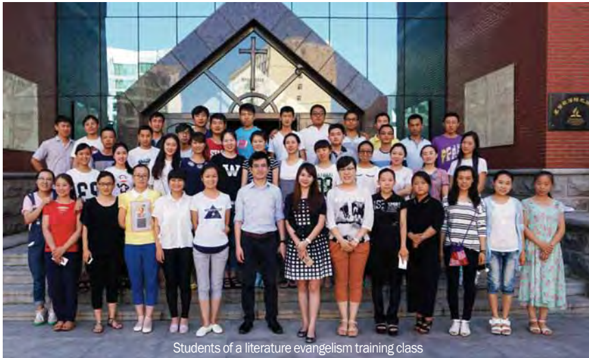
Students of a literature evangelism training class

provinces, participated in this one-week long intensive training program. The contents included the philosophy and vision of literature ministries, personal ministries and salesmanship. After the training, the students took their books and went into the streets for actual sales and contact with people. They prayed for the people they met and that our publications, like growing seeds, will lead people to the Lord and that many souls will be touched by the message of hope.