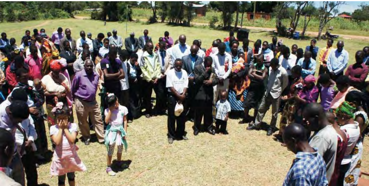
Isanzu Church held an evangelistic series from February 28 to March 13, 2016, and 21 precious souls accepted Jesus Christ in baptism through the series.

Even in the age of rapid technological advancements, there are people who still have never even heard of Jesus. It is my prayer that these people will get to await and prepare for the second coming of Jesus Christ.