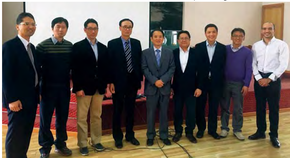
NSD and MM church leaders had a special meeting for "Mission 2016."

“Soul winning is our vision, our goal and our mission. We have 13 churches in the UB area, and all of them will be totally involved in this huge evangelistic project,” he said.