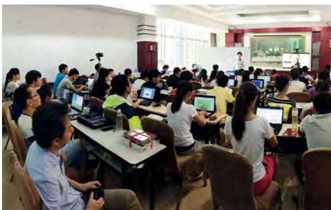
Literature evangelism training class