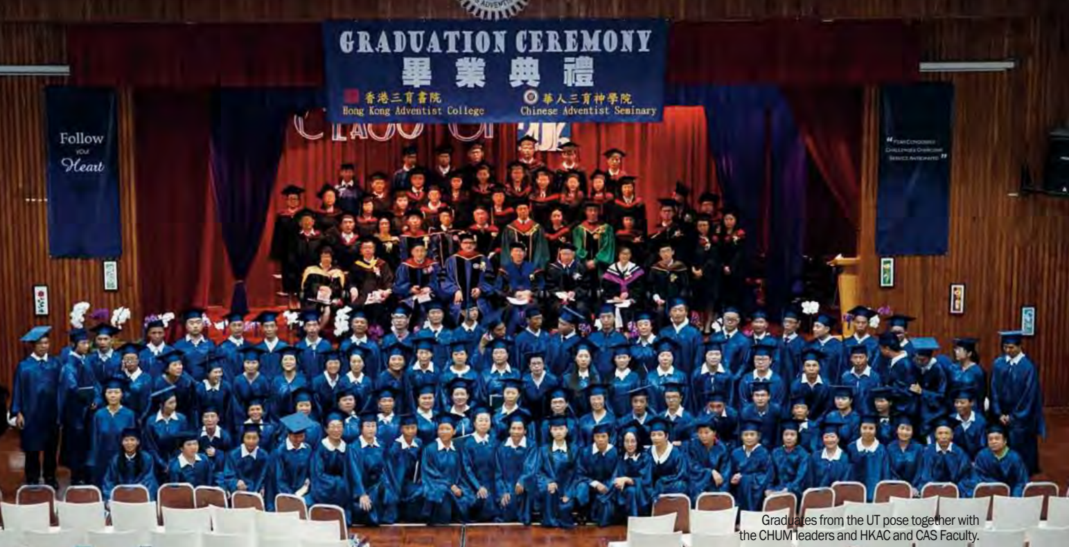
Graduates from the UT pose together with the CHUM leaders and HKAC and CAS Faculty.