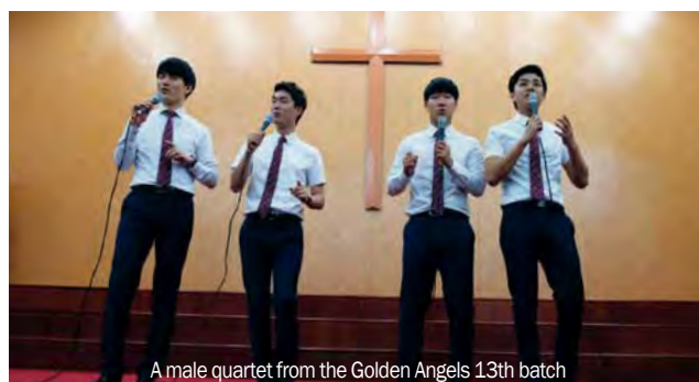
A male quartet from the Golden Angels 13th batch

During the mission work in Xiamen, in the southern part of China, we faced another unexpected hardship, which was extremely hot and humid weather. It seemed like the weather was causing us to stumble, but everything was completed successfully by the protection of God. We experienced miraculous moments as we visited churches and houses, met with souls, told them about the gospel and shared heavenly music.