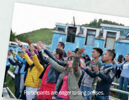
Participants are eager to sing praises.

Please pray for the young people in Mongolia!