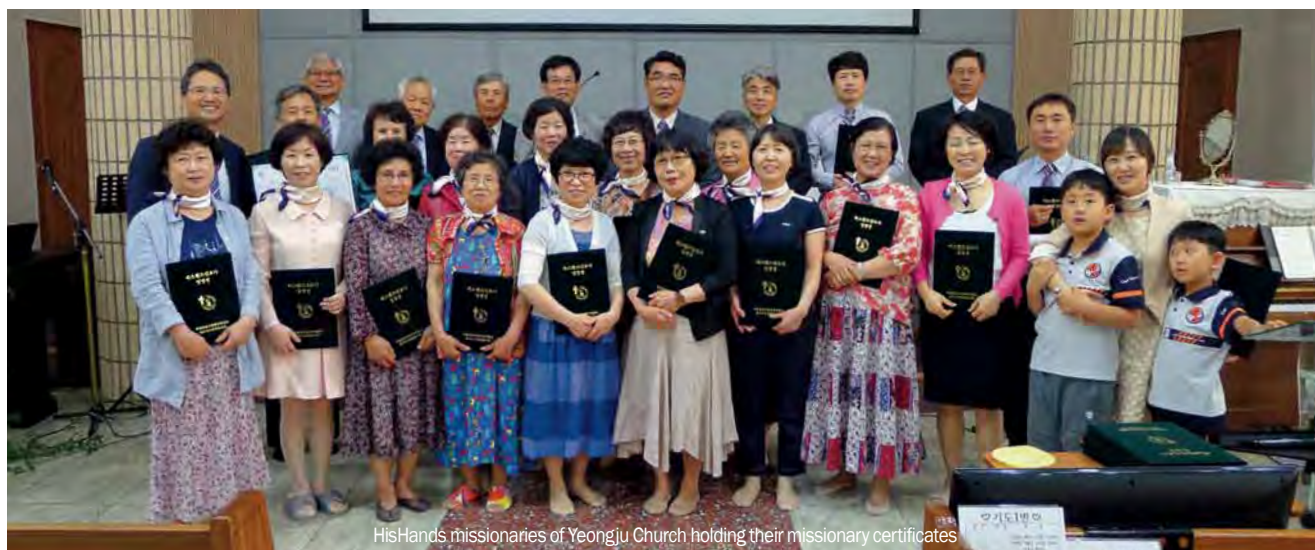
HisHands missionaries of Yeongju Church holding their missionary certificates

Since June 2014, members of Yeongju Church have been involved in seed-sowing evangelism, which is a way of spreading the gospel by distributing booklets, publications, and tracts. Ten to twelve church members have been gathering together to pray, and then they disperse into the different areas that each member is responsible for. For the last two years, they have gone out once a week, rain or shine. Last January and February, the members got together to study the Bible once a week to prepare for door-to-door visitation.