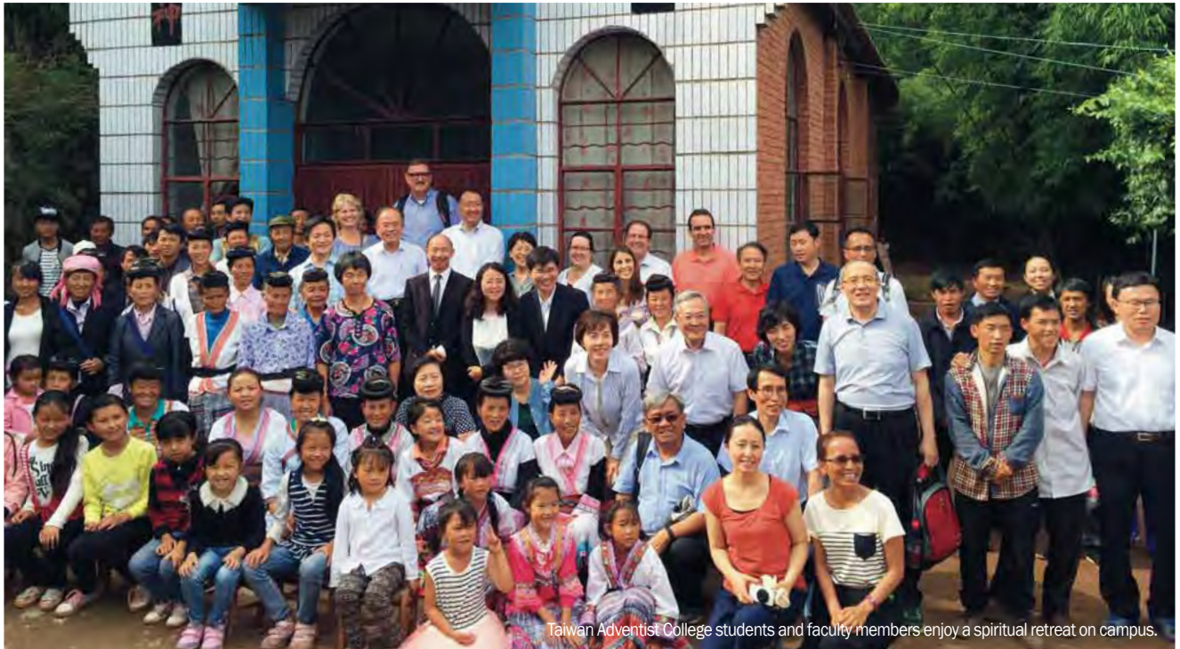
Taiwan Adventist College students and faculty members enjoy a spiritual retreat on campus.