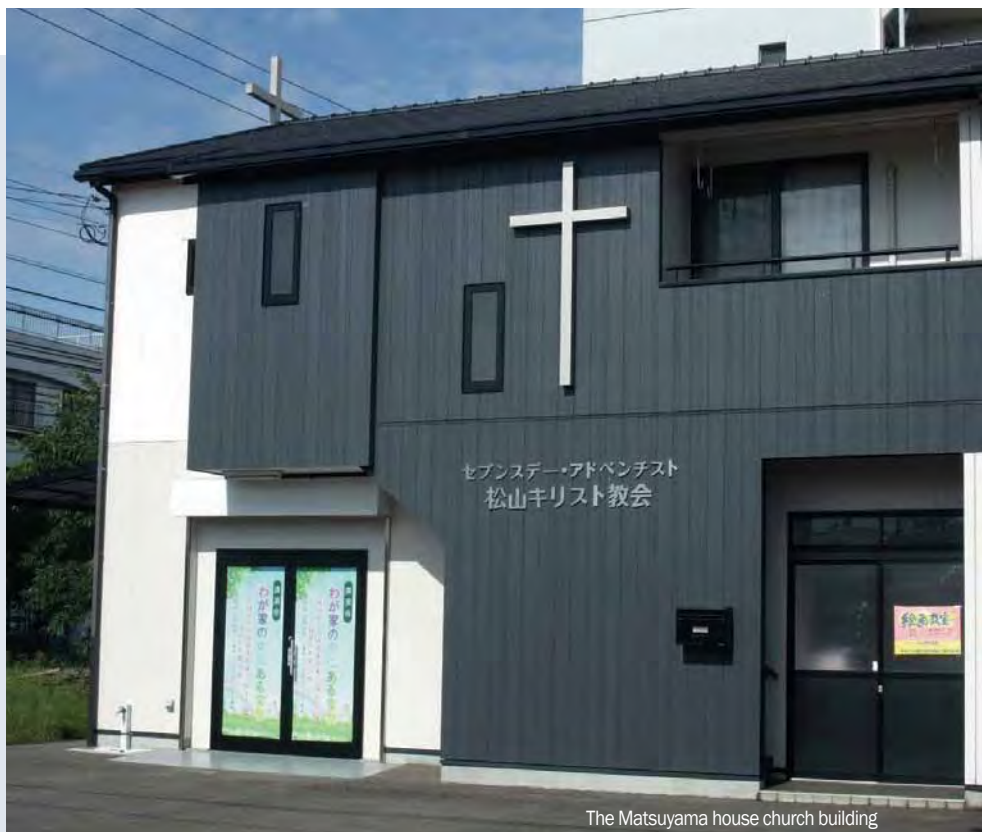
The Matsuyama house church building