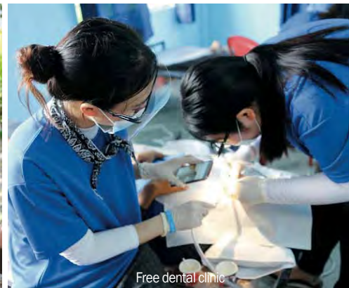
Free dental clinic