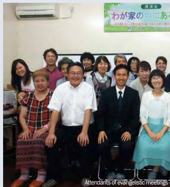
Attendants of evangelistic meetings