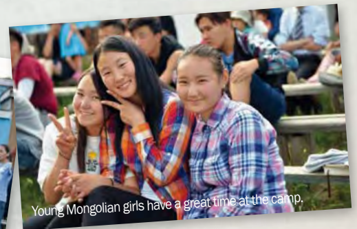
Young Mongolian girls have a great time at the camp.