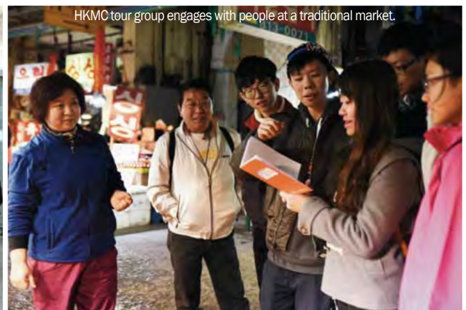
HKMC tour group engages with people at a traditional market.