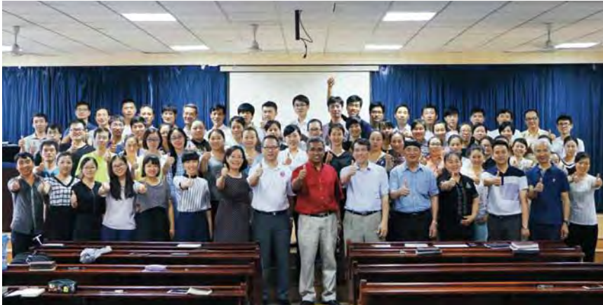
TAC has recently organized an Alumni Association and had an alumni reunion from July 19 to 21, 2016.