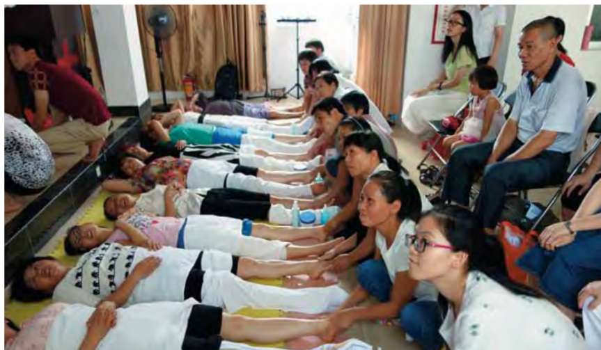
HisHands missionaries are eager to learn foot massage skills.