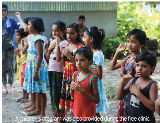
A children's program was also provided during the free clinic.