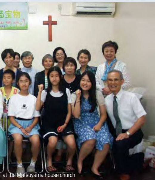
at the Matsuyama house church

The retreat ended with prayers. Various matters, such as mission in North Korea, the low birthrate in Korea, worldwide terrorism, mission projects including Total Member Involvement and Vision One Million 2020, the spiritual revival of the Korean church, and mission through women workers were included on the prayer list. There is hope for the church as women leaders pray earnestly.