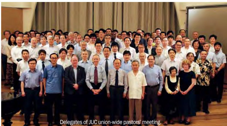
Delegates of JUC union-wide pastors' meeting.

What if we could gather together all the Adventist business people to dialogue and make bold plans for God's Kingdom in Mongolia? That's exactly what happened on July 20, 2016, in Ulaanbaatar, the capital city of Mongolia. A remarkable inauguration ceremony of the ASI