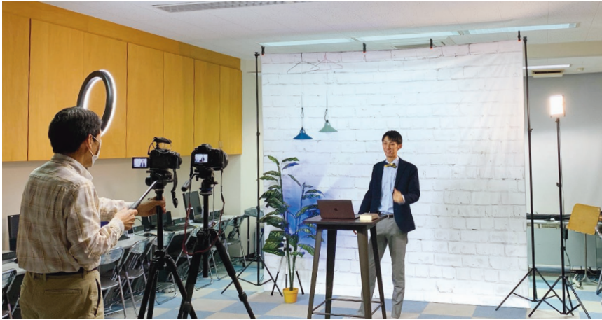
Kagoshima Church set a studio for online evangelism

A “unique viewer” means a user who watched the content. By comparing it with the number of views, we can know that the same user watched the content more than once.