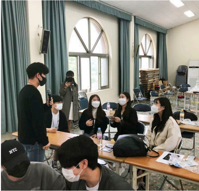
Participants spent the afternoon in small group activities.

Adventist youths from various churches such as East ACT Church, Sahmyook University Church, the theology department of Sahmyook University, Dasan Church, and Daegu East-central Church joined together for this program.