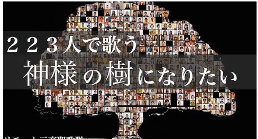
223 people gathered online as a virtual choir to deliver a song to praise God.