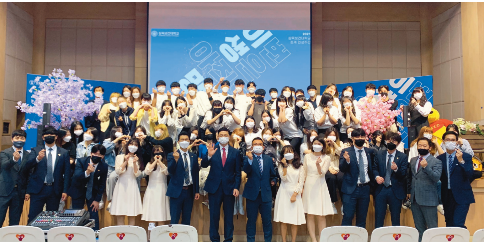
Golden Angels led out in the Week of Prayer at Sahmyook Health University.

University is an important mission field. Students are facing various choices, and they start to think of their future direction and plan their life. That's why schools of the Seventh-day Adventist Church have a great responsibility to educate their students to walk in the right path, not only delivering academic knowledge to them but also leading them to know the source of wisdom, the omniscient God.