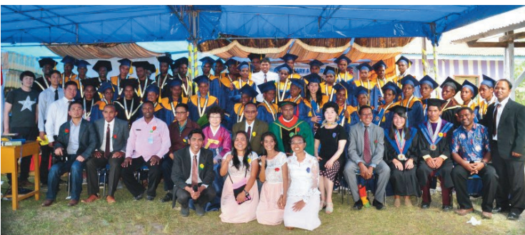
Graduate ceremony of Sogokmo Middle School

One day during our sabbatical year, at the church, our sons also prayed to someday become missionaries. Since the commemorative vow planting has been done on the training center campus, they cannot remove it. I pray for the day when my sons will go as missionaries soon, because, they’ve already been sworn in!