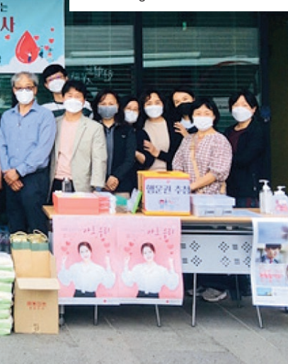
Byollae Church ran the blood drive as an effort for serving the local people. They prepared gifts for blood donors.

Wrapping up the charity concert, the group delivered a message of comfort, saying, "We will continue to pray for the Karens and all the citizens of Myanmar until the day the seed of freedom finally blossoms. May every individual's light of hope shine farther and brighter. Lastly, hang in there, as many people here in Korea are praying for you."