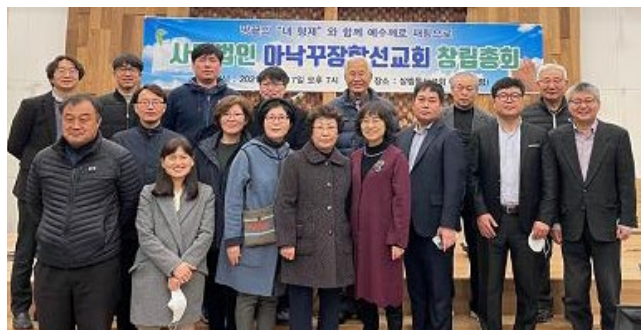
Inaugural meeting of the Indonesia Anakku Missionary Scholarship Association