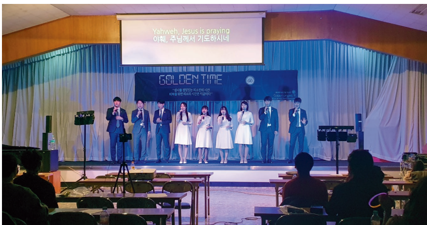
Golden Angels had a concert during the youth worship program, "Golden Time."

The health and safety protocols for the prevention of COVID-19 were well maintained throughout this program. In an auditorium which has a maximum capacity of 250 people, a total of 42 people participated, comprised of 32 youth and 10 Golden Angels members. KF-94 facial masks were distributed to all participants and a mandatory usage of those masks was enforced. In addition, constant checking of temperatures as well as strict social distancing was practiced.