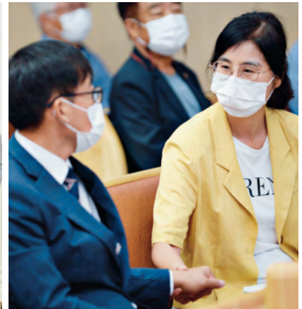
The Golden Angels offer mini concert before the opening service.