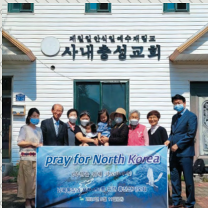
Sanae Choongseong Church