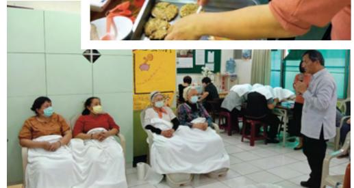
TWC Health Promotion Department visits Fong Shan Church to provide health checkups, healthy foods, and hydrotherapy.