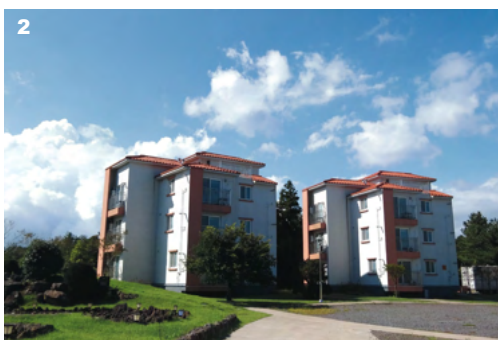
1. Groundbreaking ceremony of the NSD Leadership Training Center in 2013. 2. Residence halls of the center.