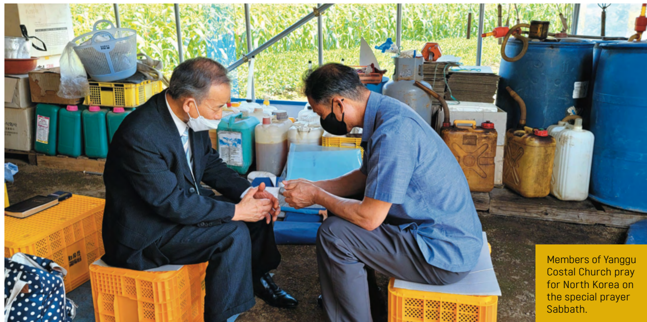
Members of Yanggu Costal Church pray for North Korea on the special prayer Sabbath.