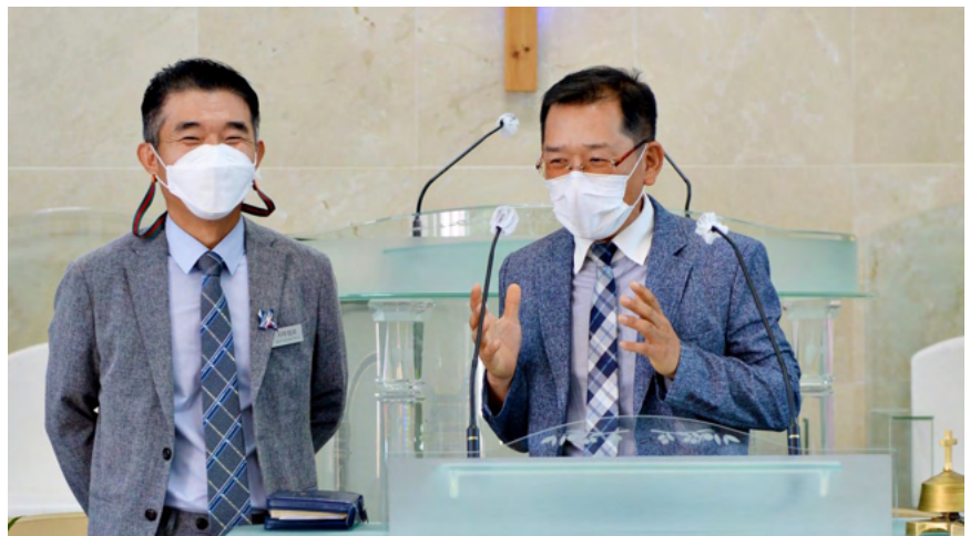
Church members shares a story of experiencing God’s special guidance during Sabbath School.

The Sabbath worship finished, and the camp meeting was declared to be closed. The signal on the projection screen went off. However, some members of the Shintaecin Church stayed at the church to receive training in small group leadership. Although the seven-day rally is over, the Shintaecin Church continues to carry out their mission.