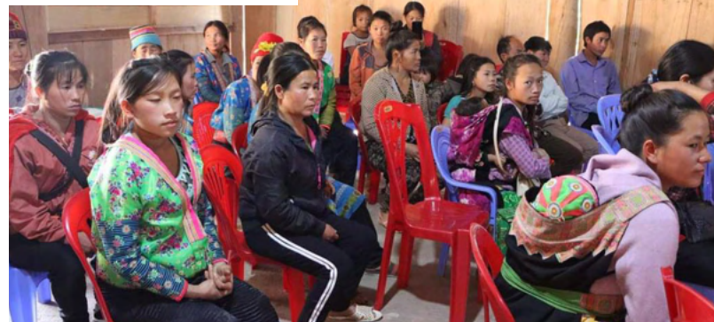
Most of the Pu Hong B Church members are Hmong, a minority ethnic group in Vietnam.