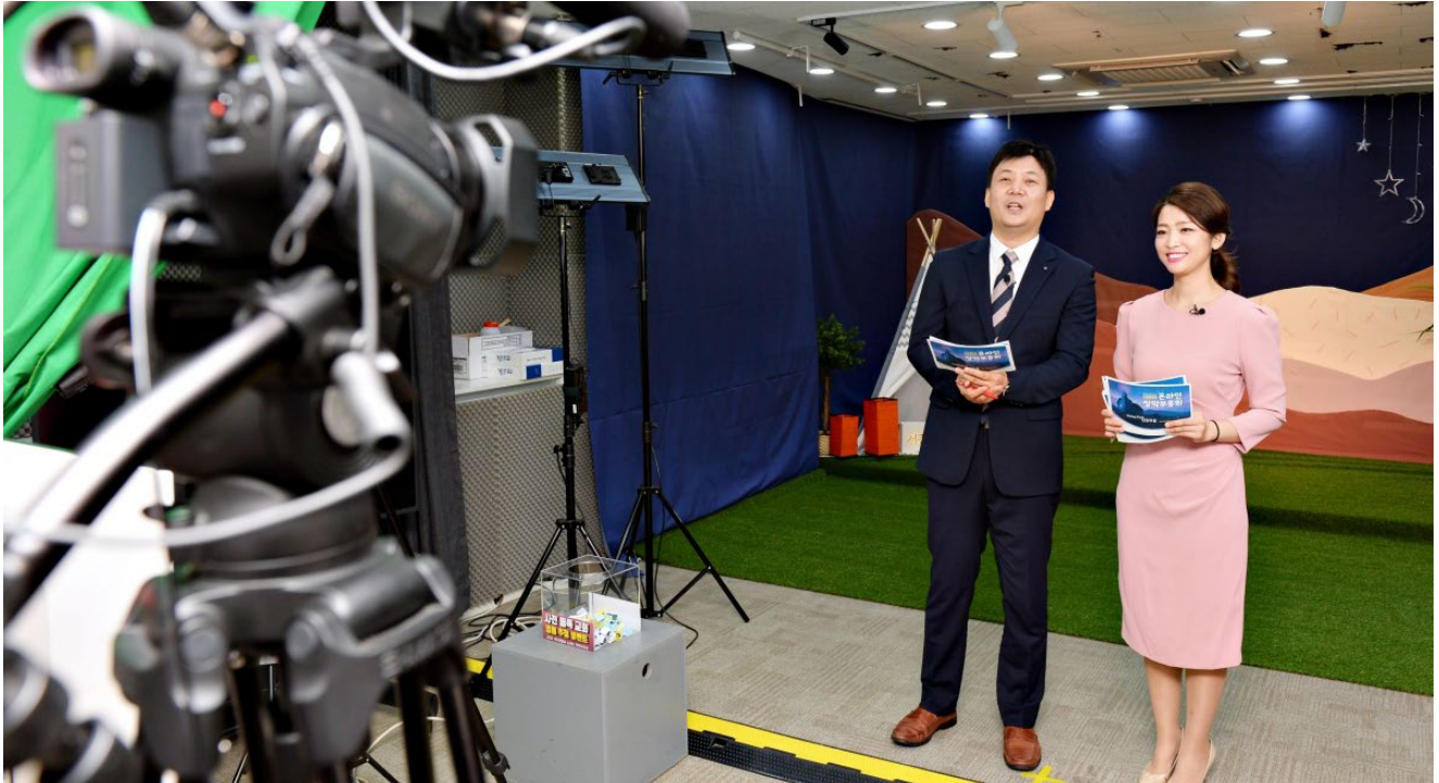
Two hosts open a four-day online camp meeting of WCKC.