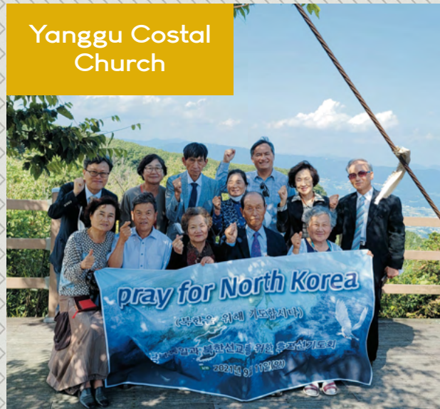
Yanggu Costal Church