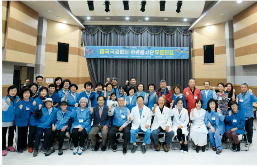
To improve relationships with the community, the Leadership Training Center invited a medical service team from the United States to provide health services to the community.

There were three important characteristics set when developing the curriculum: practical and specialized leadership programs for each target group; two-way learning systems with lectures, discussion and reports; healing time in nature such as trekking Olle trails (a series of walking trails on Jeju Island), climbing Oreum (volcanic cones on the island) or walking on forest paths.