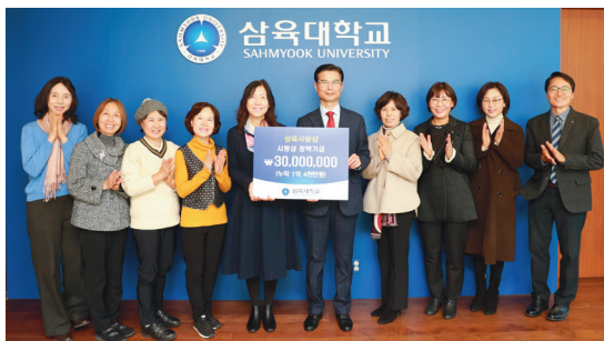
Members of Sahmyook Charity Shop.