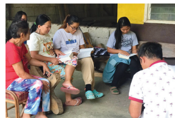
Missionary leads the Bible study.

done, good and faithful child." I'll go and follow Him, not speaking the language of this world, but in His word, the language of love, until the grandest homecoming when I can see my Jesus face to face, having my name written not just on the plaque of the dispatching arch of our campus, but in the book of life in heaven.