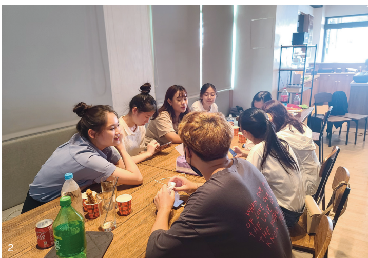
1. Beitun Church Youth members together with College students at "Come n See" cafe. 2. A group of Beitun church youth holds a meeting for campus mission.