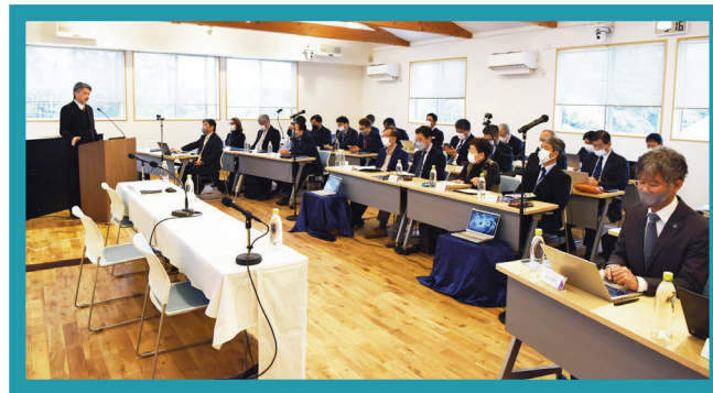
JUC Yearend Meeting Delegates.

During the meeting, leaders of JUC, its local conferences, and institutions presented their mission reports for the year 2022. Due to the ongoing pandemic and the country’s aging population among Adventist Church members in Japan, the number of deaths (149) was higher than the number of baptisms (100) up to the 3rd quarter of 2022. Each report showed that despite this