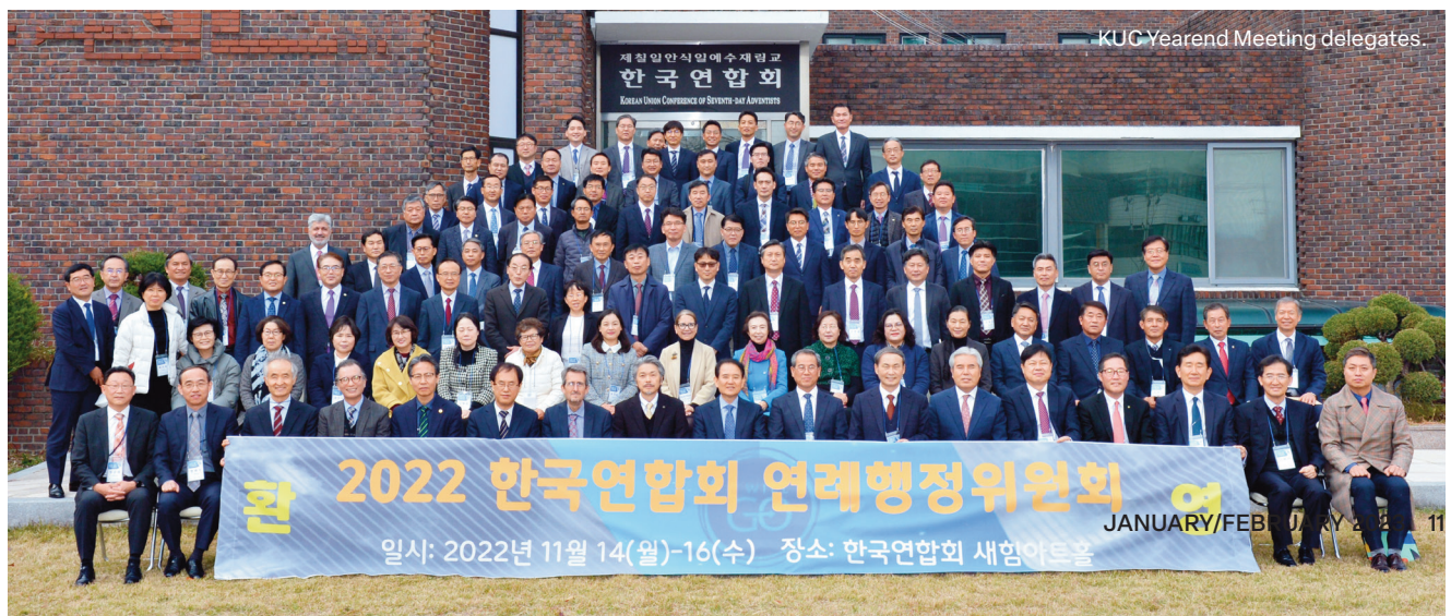
KUC Yearend Meeting delegates.

During prayer sessions, attendees prayed together for the following topics: Praise for God's blessings on KUC and all Adventist institutions in Korea; Korean missionaries spreading the gospel abroad; God's guidance during the yearend meeting of KUC's five local conferences, Jeju Region, and institutions.