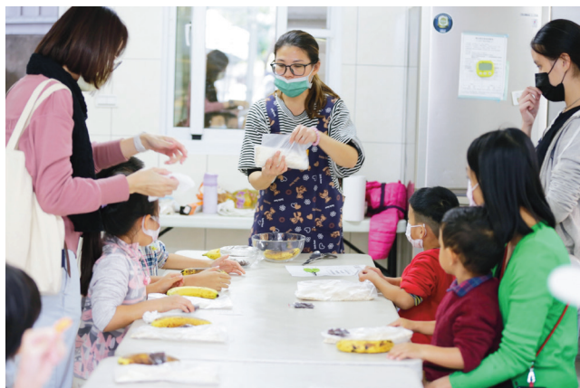
Leading the baking class for healthy dessert.

The Pingtung Church board in Taiwan wanted to make our year-end evangelistic meeting something special that would help the people in the community feel more comfortable and welcome to visit our church. After some discussion, the board members decided to have the meeting on the Sabbath of Christmas Eve because Christmas is considered a day for sharing love with one another.