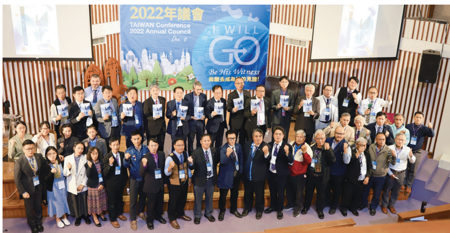
TWC Yearend Meeting delegates chant "I Will Go"

During COVID-19, TWC's traditional ways of ministry were not useful in many cases, but God helped us to find new, and more modern ways to preach the gospel. It is by God's grace that TWC's online ministries allowed us to keep sharing Jesus with people and to learn that God can do His work anytime and anywhere.