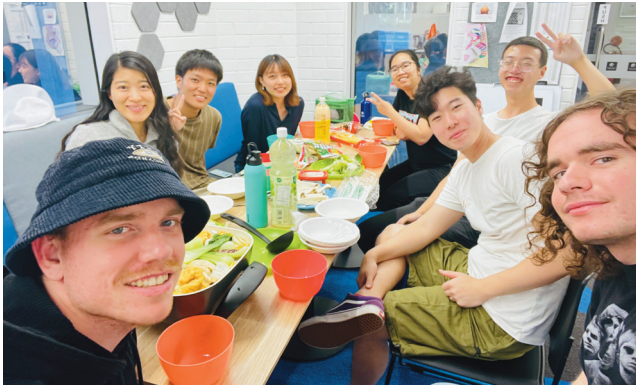
With Newcastle University Students

at the beginning of 2018, saw a doubling of participants from the first week of preaching on campus. Eventually, there were so many participants that one house could no longer accommodate all of them. So, after a few months, CARE was held at two houses. By 2022, it was held at three locations, including the university chaplain's office.