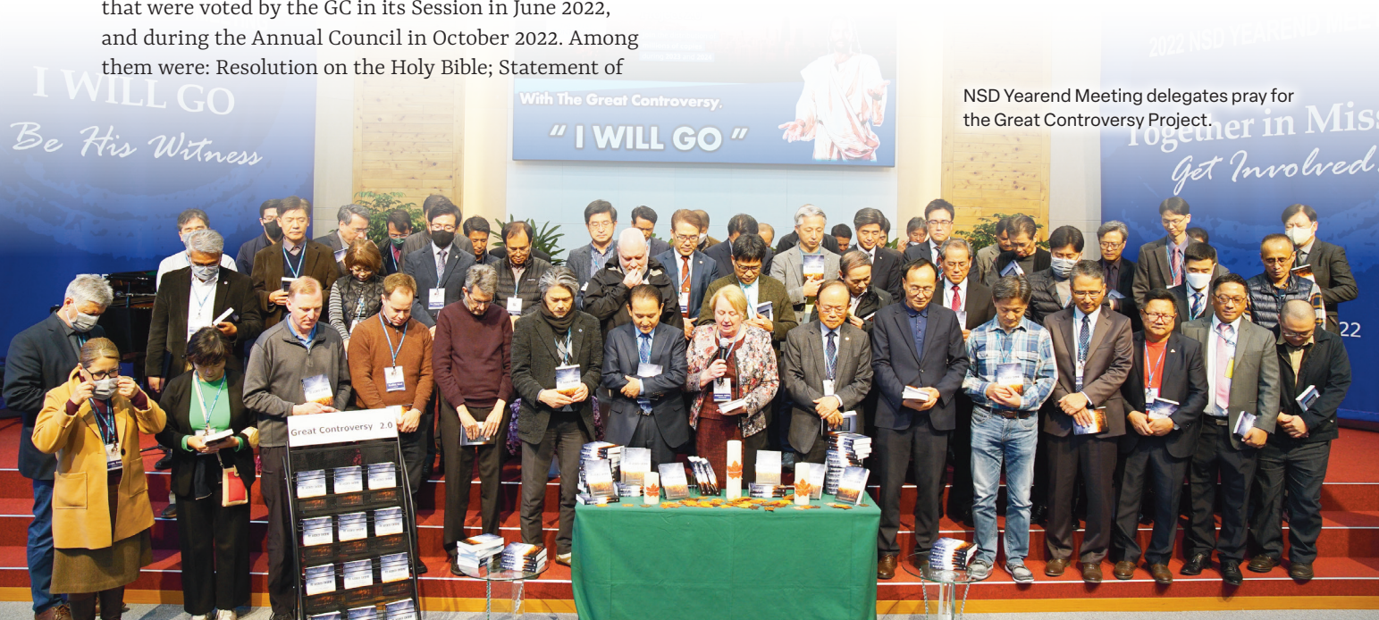
NSD Yearend Meeting delegates pray for the Great Controversy Project.