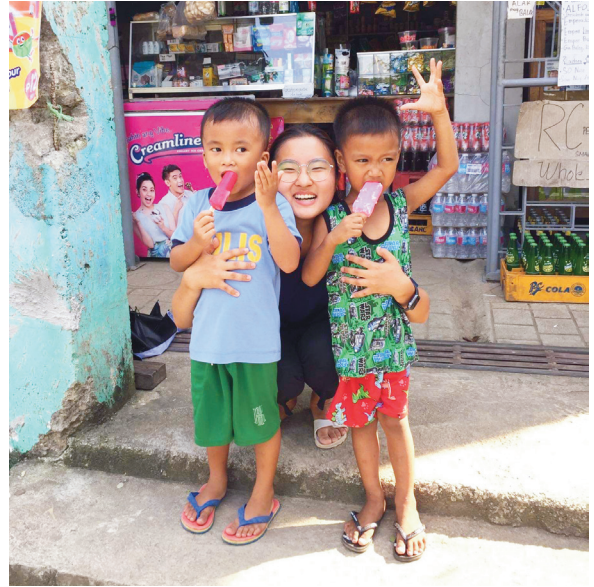
A missionary's joy in serving children

"For so the Lord has commanded us: 'I have set you as a light to the Gentiles, that you should be for salvation to the ends of the earth'" (Acts 13:47).