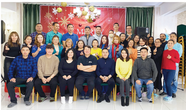
Members of the Mongolia chapter of ASi.

During the meeting, attendees were reminded of God's promise in Psalms 81:10, "I am the Lord your God, who brought you out of the land of Egypt; Open your mouth wide, and I will fill it." This meeting of the ASi Mongolia Chapter was a blessed time for all ASi members to share experiences, build friendships, and encourage each other from God's word. May they open wide their vision and plans, holding onto the promise of God to bring fulfillment.