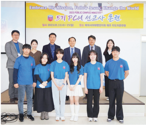
5th PCM Missionary Training at the Jeju NSD Leadership Training Center.

Children’s Ministries director of Middlewest Korean Conference, was the main speaker. His lectures included practical lessons on Bible study methods, meditating on God’s word, writing prayer journals and practical demonstrations to help missionaries shape a spiritual life in the mission field. Additionally, Pioneer Mission Movement pastors who have been working with PCM missionaries in their churches and senior PCM missionaries vividly shared their experiences in the mission field through an online meeting.