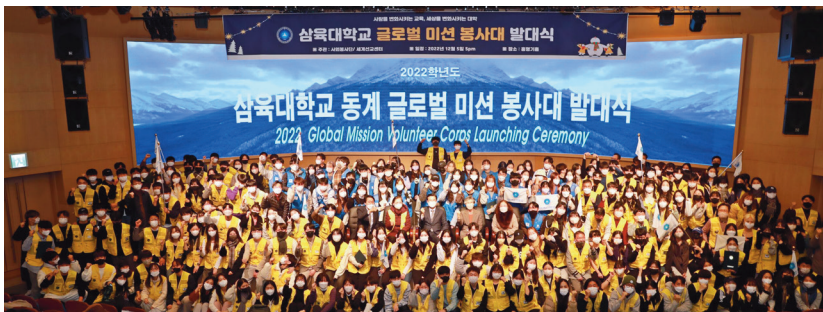
2022 Global Mission Volunteer Corps Launching Ceremony at Sahmyook University.