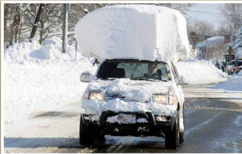
A vehicle with a large chunk of snow on its roof drives along Route 20 after a massive snowfall in Lancaster, New York, on Wednesday, November 19. A ferocious storm dumped large piles of snow on parts of upstate New York, trapping residents in their homes and stranding motorists on roadways, as snowstorms and record-low temperatures hit much of the country.

SHARES WORTHLES Crash! Stocks tumble assets anxiety deepens Interest rates liquidity RECESSION FORECAST