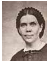
Ellen G. White, 1827-1915, received the spiritual gift of prophecy, and the fruits of her life and work accord with the biblical tests of a true messenger of God. To this day, her counsels are an incalculable blessing to God's people around the world.