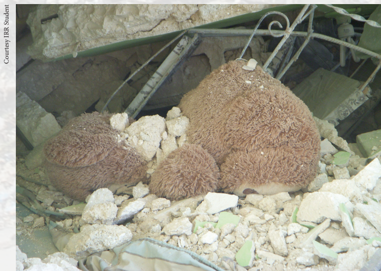
A teddy bear signifies a glimpse of life in the rubble.

It might test their strength to the brink of collapse, yet