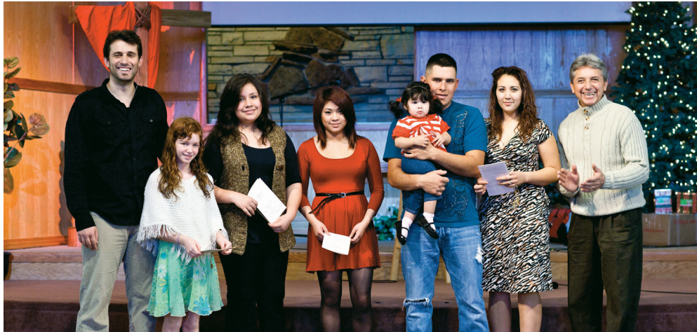
Some of the many new members who have joined the Arvada Church family

The church family of the Arvada, Colorado district is praising God for 116 new lives added to the Kingdom last