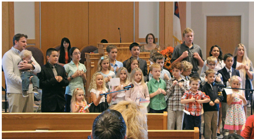
Children's choir performing at the Family Celebration Weekend

In conjunction with the North American Division's designation of September for particular focus each year on family life, West County Church in Chesterfield, Missouri that month held its first annual Family