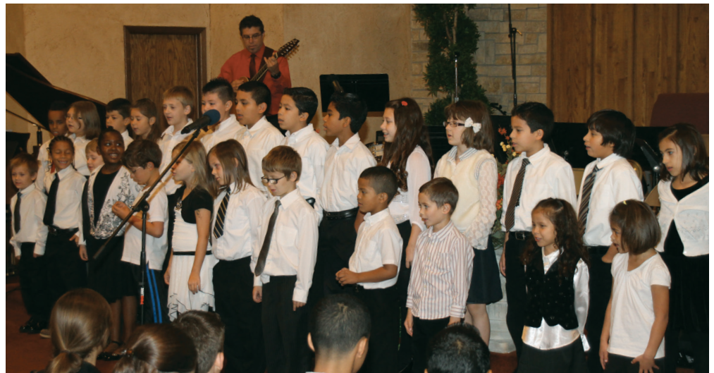
Wichita Adventist Christian Academy students provided music for the celebration.