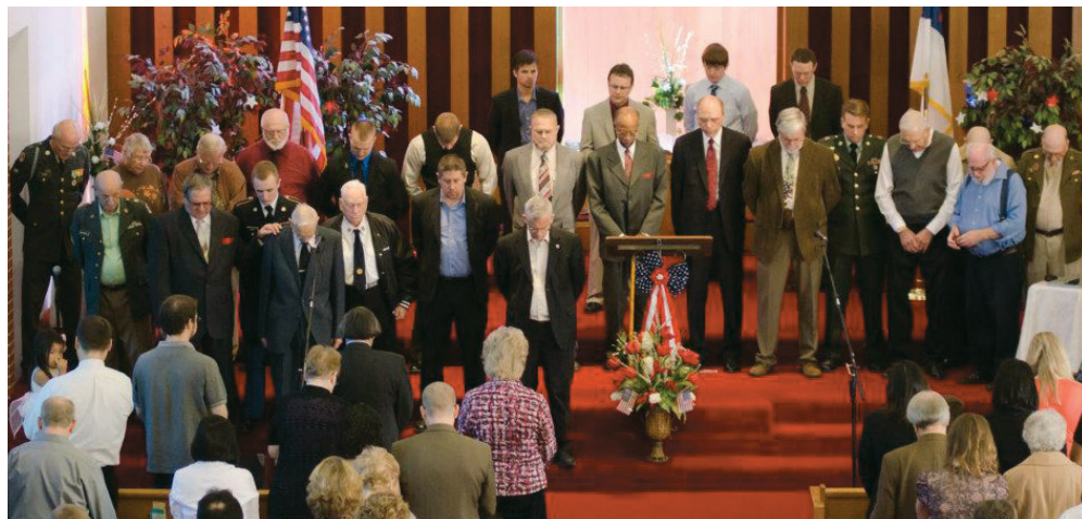
Piedmont Park (Lincoln, NE) honored veterans during a special worship service.

Piedmont Park Church celebrated the service of Armed Forces veterans on November 10 during a special worship program. As the tune of Lee Greenwood’s “God Bless