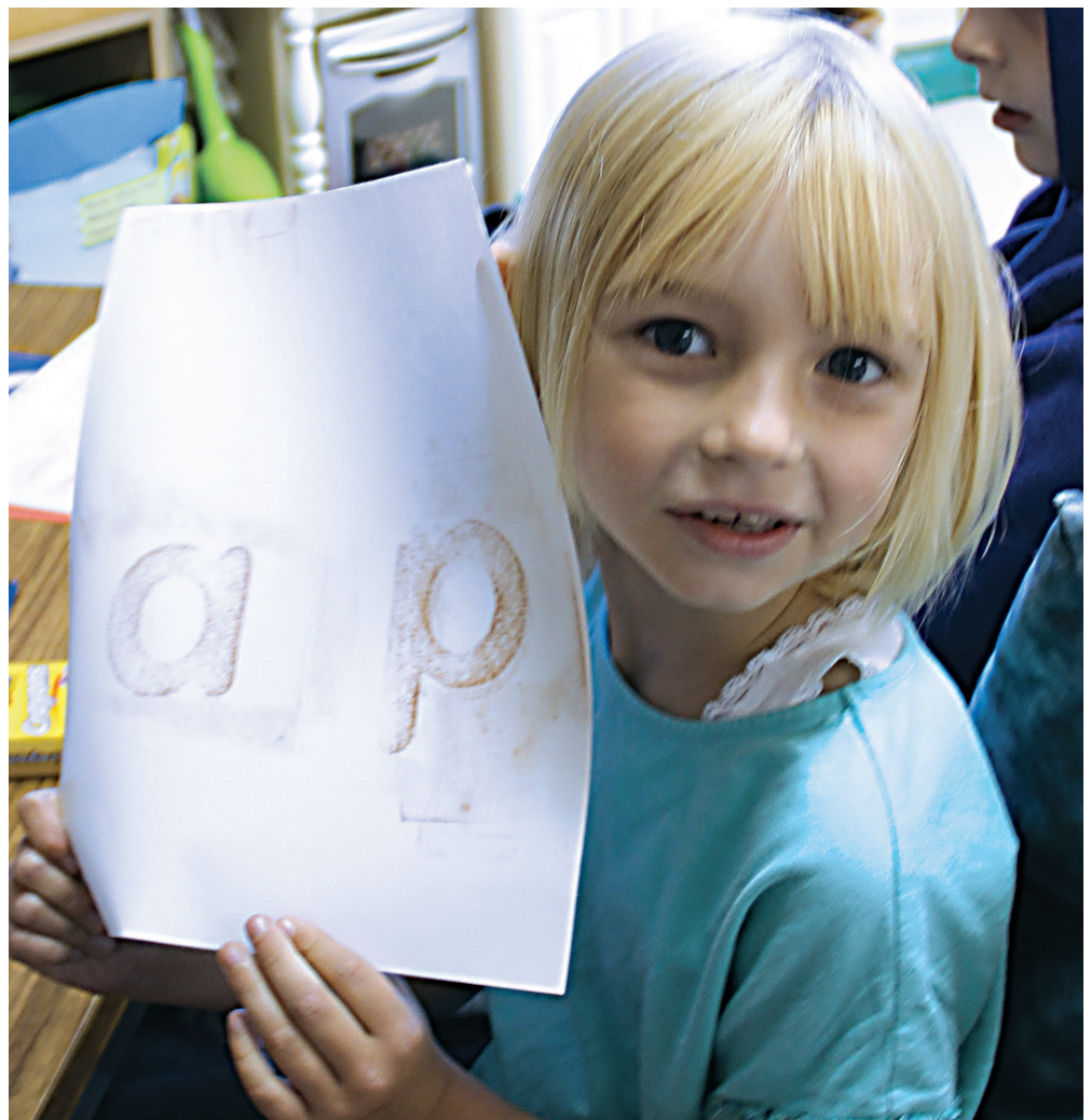
Kindergarten students at Stone Ridge Adventist Christian School are benefiting from the newly-purchased Stairway to Reading curriculum.