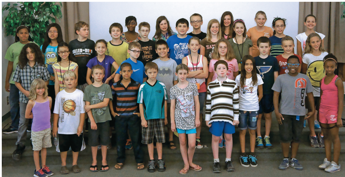
Students in 5th and 6th grades gathered at Camp Heritage to learn practical life skills during the recent conference-sponsored Outdoor School.

In mid-September the Iowa-Missouri Conference Education Department held its annual Outdoor School for 5th and 6th graders at Camp Heritage. Thirty-five students and