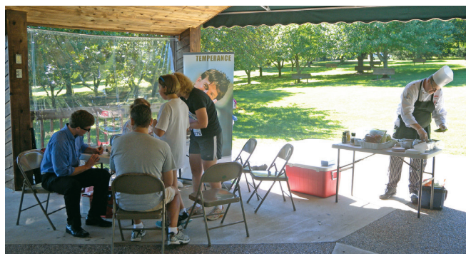
Attendees participate in health screenings while a Hy-Vee chef prepares healthy food samples.

The Dubuque (IA) Church sponsored a walk-a-thon for Let's Move Day 2013 at the Dubuque Arboretum and Botanical Gardens. Volunteers organized various healthy living stations for the 80 participants to visit along the way, including 60-second "seminars" on how to burn fat, the importance of water, how