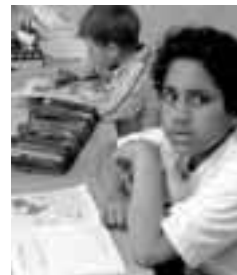
Creative participation was encouraged throughout the Kids Underground program.

ADRA in Australia is donating $A1 million over two years to the Armed Forces College in Malawi for HIV/AIDS awareness and home-based care programs for those with the disease. It is also donating $A300,000 over three years to raise awareness among high school students in Honiara, Solomon Islands, of HIV/AIDS.—with World Vision Media