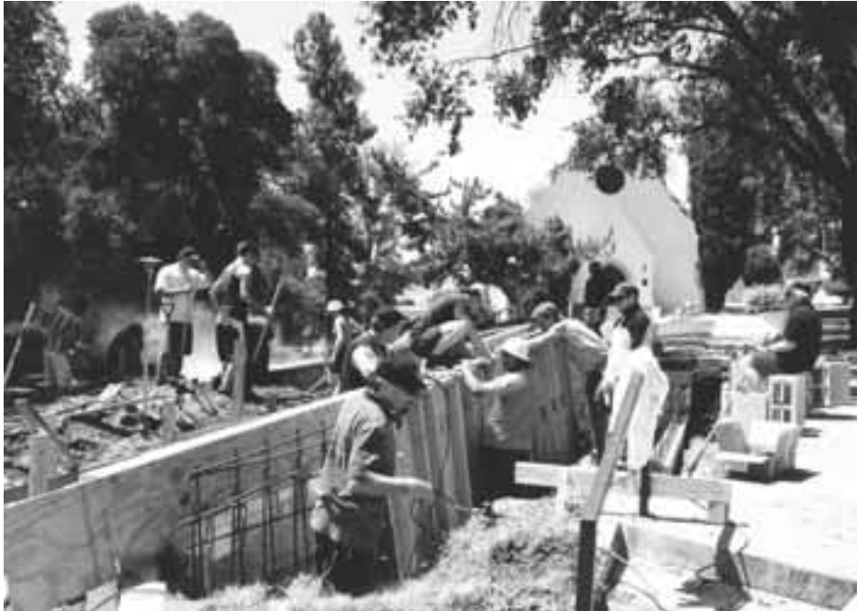
Adventist young adults from Australia have helped build a landscaped patio at La Sierra University as a tribute to contemporary heroes.