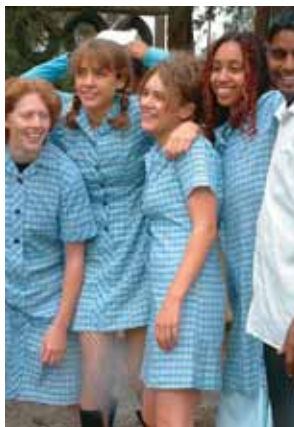
Almost 9000 students enrolled in Adventist schools in Australia last year.

calls about child sexual assaults. This is a 50 per cent increase over 2001. It also received 27 calls about adult sexual assaults and nine about adult sexual harassments. Its Professional Standards Committee investigated 29 cases (down from 46 in 2001).