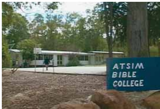
Mamarapha College for Aboriginal and Torres Strait Islanders is the new identity for what has been previously known as ATSIM Bible College.

And it has led to some confusion—"ATSIM" is similar to "ATSIC," the Aboriginal and Torres Strait Islander Commission, a Commonwealth statutory authority established in 1990 to include