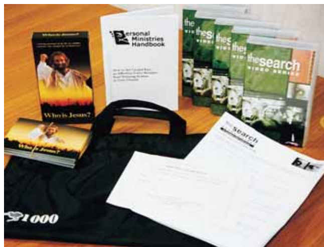
Kiwi 1000 participants receive a kit that provides ready-to-use tools for putting into action the skills learned for relational evangelism.

development director for the NZPUC, says, “The Kiwi 1000 participants will receive exclusive access to our Kiwi 1000 web site. They will also receive a kit containing among other things a resource CD-ROM, seven outreach videos including Who Is Jesus? and the Search videos, and a personal ministries resource book.”