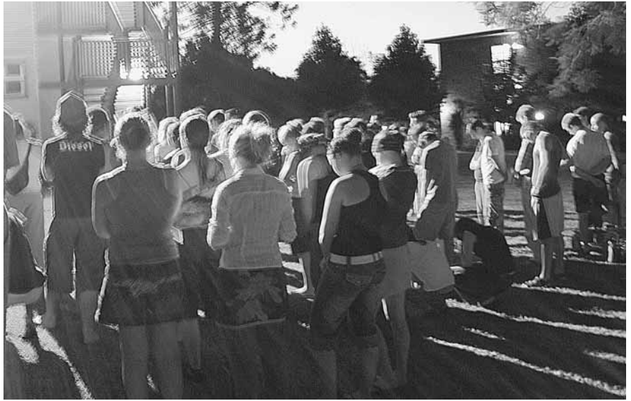
Avondale College has started this year with its highest ever number of enrolments and a Week of Prayer that saw students and staff sharing many opportunities for prayer and reflection.