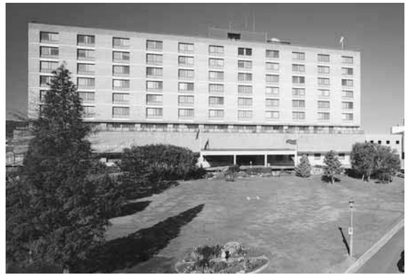
The Sydney Adventist Hospital.