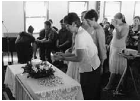
Current Bencubbin church members light candles to symbolise them carrying their faith to new locations.

The day closed with all current and past