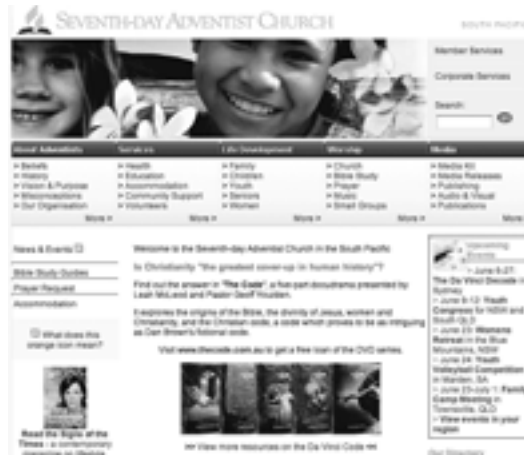
The South Pacific Division's website now features RSS feed.

RSS, which stands for Really Simple Syndication, is widely used by the online community to share the latest entries' headlines or full text of their websites. The use of RSS has also spread to many major news organisations including Reuters, CNN and the BBC. A program known as a feed reader or aggregator can check a list of feeds on behalf of a user and display any updated articles that it finds.