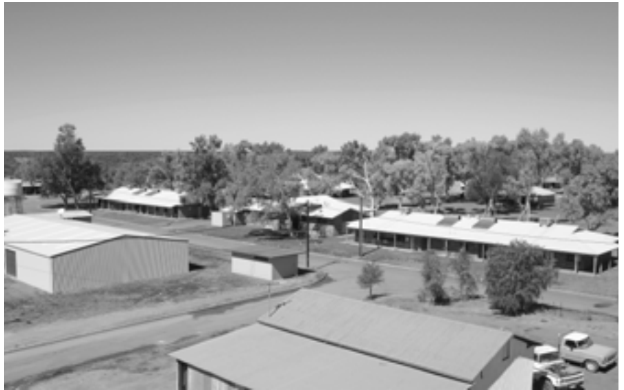
The Karalundi Aboriginal Education Centre (pictured above) recently celebrated an open day that was attended by community, business and government leaders.