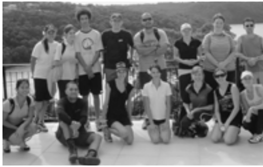
The Wahroonga Seventh-day Adventist church youth group, The Way, who have been saving money for a missionary trip to South Africa in July.

sees the trip as an opportunity to get out of his secure boundaries and try something different. "I have never been on a mission trip before," he says. "I hope to be able to spread the message of God to these people and give them something better in their village that they can use."