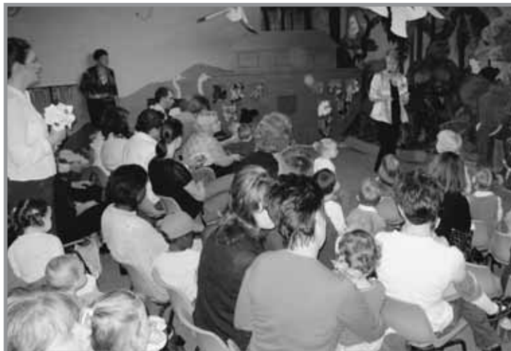
Springwood’s children’s Sabbath school rooms are packed each week. The church has as many as 80 children in the beginners age group alone but many of these families do not stay for worship services because there is no room for them.

“But,” she says, “the growth in numbers is insignificant compared to the growth in community, ownership and involvement of our youth. Springwood—a church known for a big