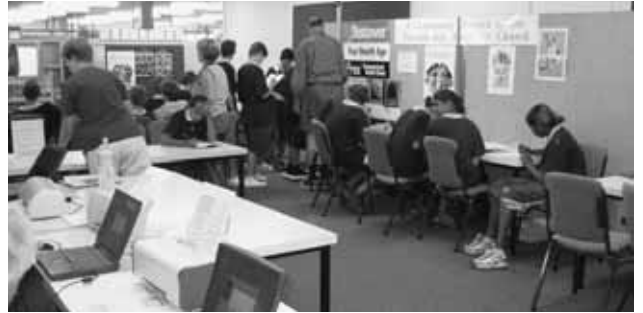
The Adventist Health Association assess students' "health age" in the library of the Karratha Senior High School.

A program was run at Karratha Senior High School, a few days before appearing in the local shopping centre. When the