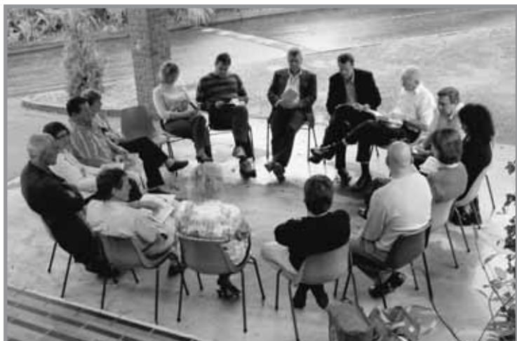
Sabbath school is an important component of church life at Springwood, demonstrating both the unity and diversity of the church, with classes conducted in four languages.