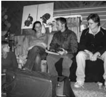
The OOO team shared the Bible with people in Bourke as part of their outreach efforts.

In the afternoons, the DUST team travelled to the other side of town to "Glitter street"—so named because of the broken glass littering it—with the goal of cleaning up the thick layer of glass and rubble that covered the ground. The team also ministered to the neighbourhood and worked to create friendships with the local people.