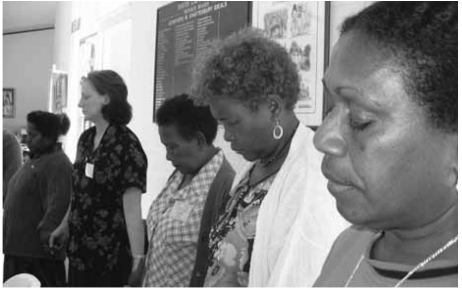
Women's Christian Temperance Union members praying for wisdom on how to lobby governments on issues of alcohol, tobacco and drugs.