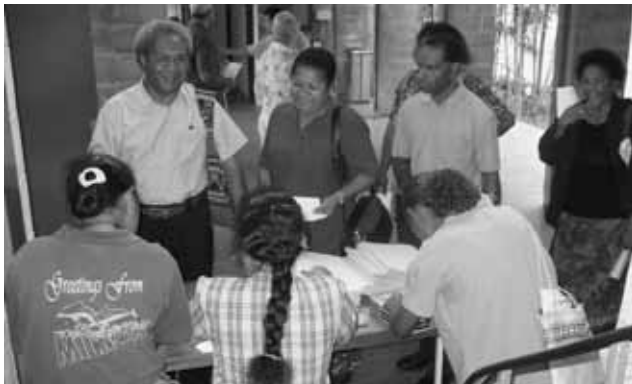
Program attendees registering for workshops at Pacific Adventist University.