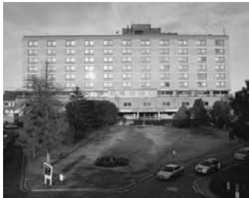
The Sydney Adventist Hospital, which recently received an award for excellence in patient care.