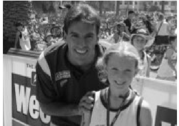
Australian Olympic swimmer Matt Welsh with one of the hundreds of children who attended the TRY-athlon event in Melbourne on February 4.

The day encourages children from all backgrounds to try these exciting sports