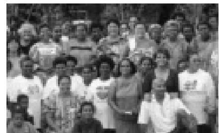
Some of the women who attended the retreat in New Caledonia.

"This small mission has been experiencing a revival in recent times with many people becoming Adventists. It has all happened because of strong prayer ministry and unity of heart and working together among the mission leaders and church people. The women have consistently had good retreats on this island for the past 10 years."