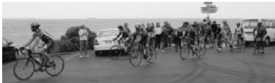
The “Circle of courage” team setting off from Bluff, destination Gore.