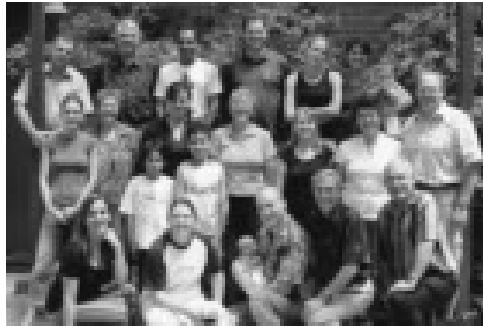
"Re-entry retreat" attendees.

"The quiet bush surroundings of Crosslands is an ideal environment for couples and families to unwind and process some of the challenges of returning home,"