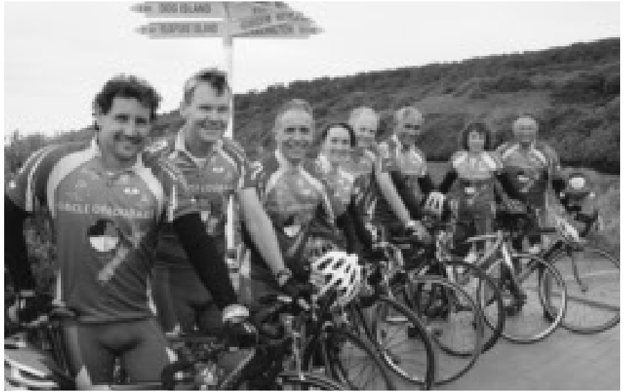
The "Circle of courage" team as they prepare to leave Bluff on their 23-town tour of New Zealand.