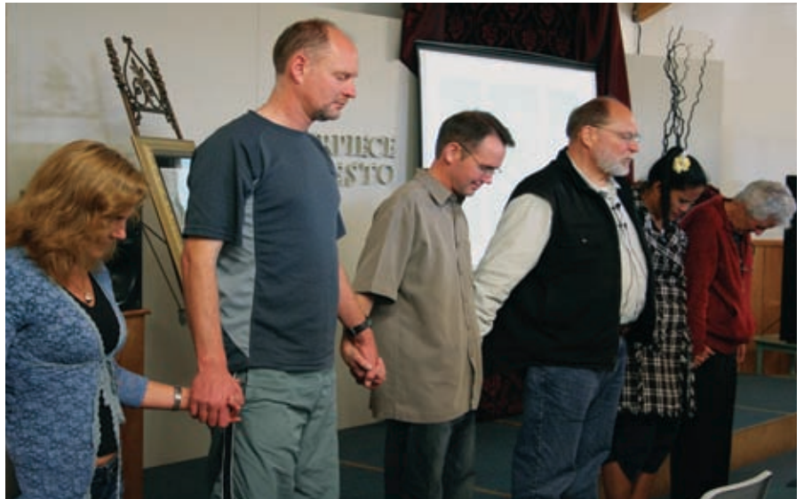
Teachers and presenters pray for God's help to create "masterpieces" in children at the recent teachers' retreat, held at Lake Taupo.