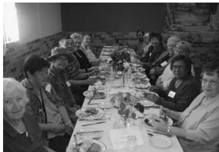
Some of the members of the Livingston Friendship Club at one of the lunches run by the club.