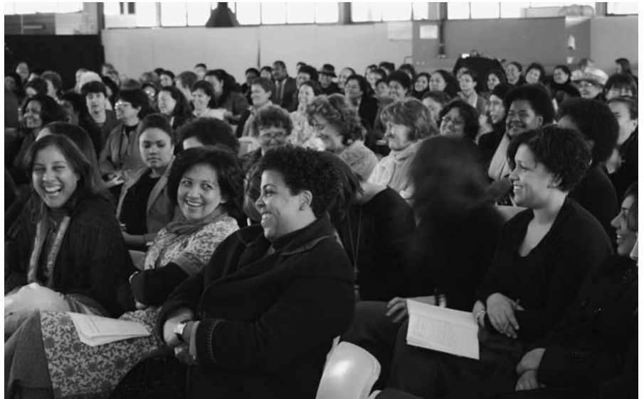
Some of the women at the women's spiritual retreat conducted by the Greater Sydney Conference, where $A12,000 was raised to help Indian women.