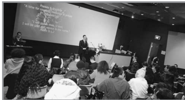
The next Gateway: The launch of Gateway Hawthorn at Swinburne University’s Hawthorn campus on May 24.

Meanwhile, GAC measures its growth on a baptism ratio, rather than sheer numbers, as they believe the critical mass is only