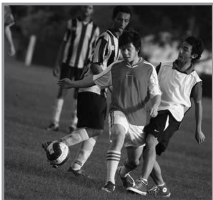
Gateway provides many opportunities for building community, such as a recent soccer match.

Once seekers come into contact with members, the members have been trained to know how to grow their interest. GAC members are perhaps some of the most trained in the country, making contacts at university, business places and in the course of whatever profession they are working in. Such is their commitment that since General Conference vice-president Pastor Mark Finley challenged young people to become full-time Bible workers for six months, many GAC members have taken time off from being doctors, professionals or successful businesspeople to answer the call.