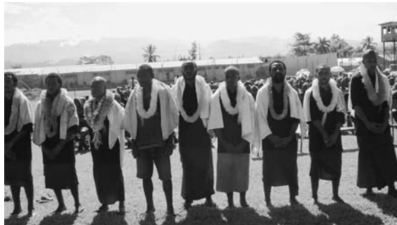
The inmates following their baptism.

On the final night of the program, Jochabed Pomaleu, from the local Discover Bible school, gave out 48 certificates and diplomas to inmates who completed Bible