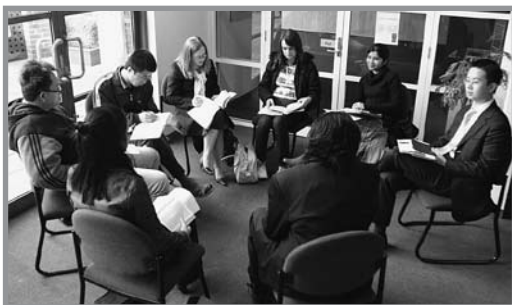
Small groups—in members' homes and in focused Sabbath-school groups—are a key element of Gateway's ministry model.