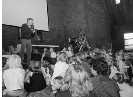
The children's story during the Sabbath program at Tweed Valley College.