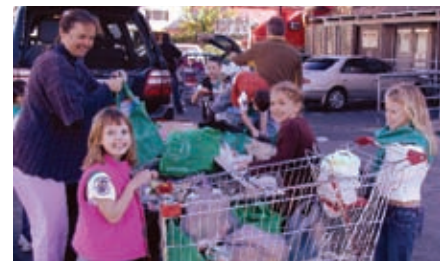
Unloading some of the collected cans.