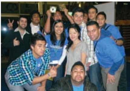
Some of the people who attended the iGeneration concert.

Students from Sydney Adventist College (SAC) raised almost $A4000 in four hours when they took the ADRA Appeal door-to-door in their local area on August 14, and students from Mountain View Adventist College (MVAC) took the initiative to hold a concert on August 24 to