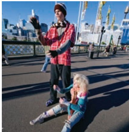
“Freezing” in Sydney.