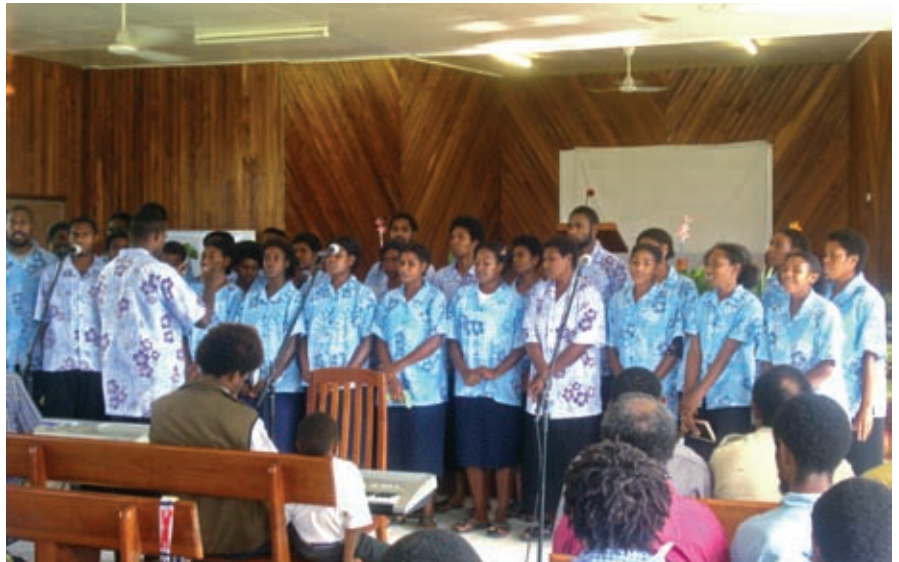
Praise and worship time during the outreach program, conducted by a team of Adventist church members from Western Australia.