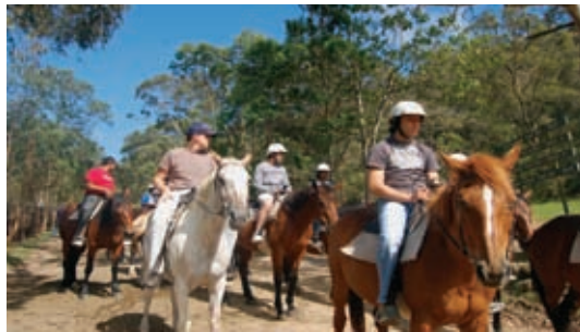
The group of Redfern young people starting the ride.

Mr Murison says, “They must have had a good sleep, because it was hard to wake the happy campers the next morning. We had a good Sanitarium breakfast, packed up and got ready for a horse ride through the rainforest, then ended up taking a dip