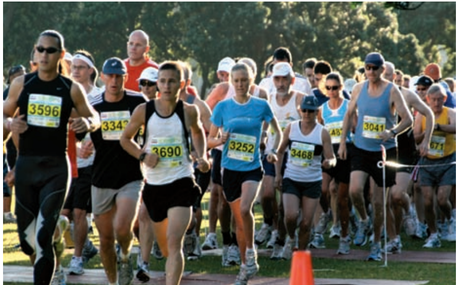
Some of the participants in the ADRA New Zealand charity run, which raised $NZ46,000 for disadvantaged people.