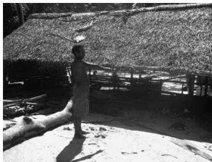
A church elder points to damage done to one of the churches on Ruprup Island.

Several people on the island lost their homes and Samson Wagi, a member of the group from Apotiko church, says the waves also destroyed the building of one of the two Adventist churches on the island, which had been located on the beachfront.