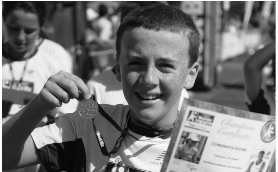
Winners are grinners—one of the thousands of children who were part of Sydney's Sanitarium Weet-Bix Kids TRY-athlon shows off his medal and certificate of participation.