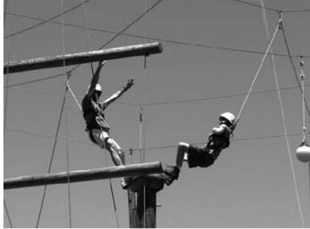
Karalundi Aboriginal Education Centre staff participating in team-building exercises.