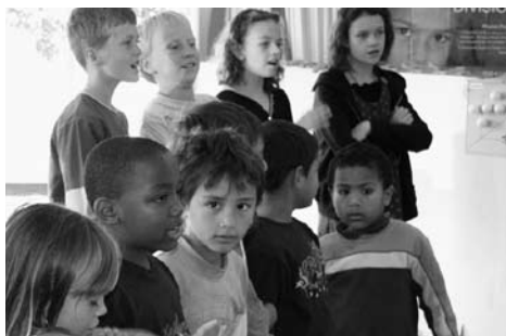
The needs of children, like these at the Taupo church children’s Sabbath school, will be the focus in churches this year.