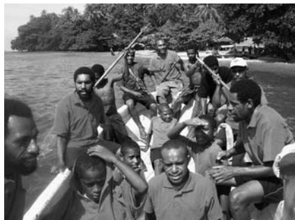
Some members of the youth group from Apotiko Adventist church on their way to Ruprup Island.

“Huge logs were rammed by the waves into the thatched-roof building,” he says.