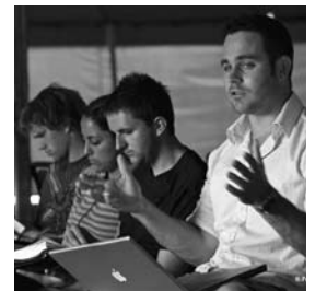
Leading discussion at the Tasmanian camp-meeting.