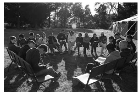
Young people from around Tasmania at the camp-meeting.