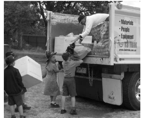
Students from Edinburgh Primary School (Lilydale, Vic) help load donated household items for delivery to bushfire survivors.