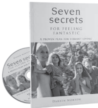
The Seven Secrets audio book is available from Adventist Book Centres.

More @ www.SevenSecretsForFeelingFantastic.com