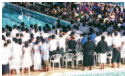
It took 20 pastors to baptise all 190 candidates.