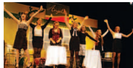
Students performing a scene in Runaway.

Apart from the three evening performances, the cast also held a matinee show, which was attended by 200 local primary school students. The production is an original interpretation of the prodigal story (see Luke 15:11-32) and highlights the special character of the school. The script was developed early in 2009, with auditions and rehearsals starting in March. None of the students in lead roles had performed in theatre before. The cast also performed the play at the Papatotoe Adventist church on September 26.— Carl Hergenhan