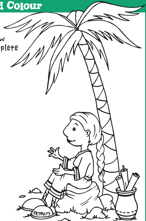
Answers: Jabih, Sisera, Deborah, Barak, Lappidath, Abinoam, Heber, Jael.

Deborah is talking to Barak. Draw him to complete the picture, then colour it in.