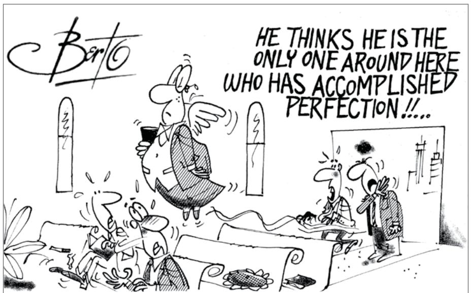
A "sin of the Church"? See article on page 14-15.