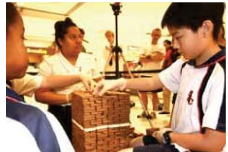
Students carefully place the biscuits.