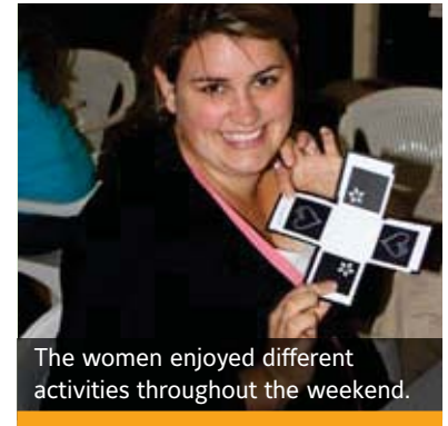
The women enjoyed different activities throughout the weekend.