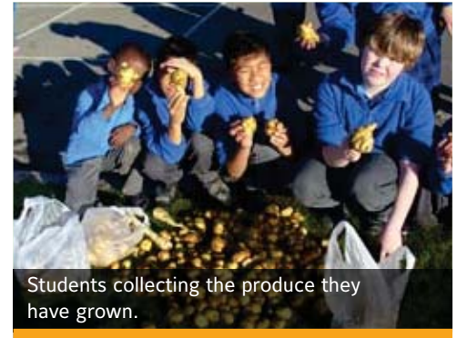
Students collecting the produce they have grown.