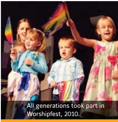
All generations took part in Worshipfest, 2010.