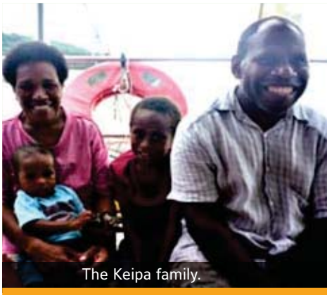
The Keipa family.

The Seventh-day Adventist church was full to capacity on the Sabbath of their visit. The tragic boat accident happened as the small 6m fiberglass 'banana boat' was making its way back to Tanna Island with 13 people on board.