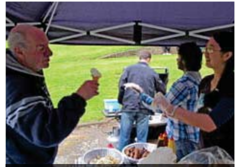
Enjoying a meal with the homeless.

The Kiwis Care Project is an opportunity to put Christianity into practice. It is planned that all of New Zealand's homeless will receive a care pack by the end of 2012.