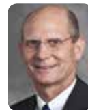
TED N. C. WILSON IS PRESIDENT OF THE SEVENTH-DAY ADVENTIST CHURCH AND LIVES IN MARYLAND, U.S.A.