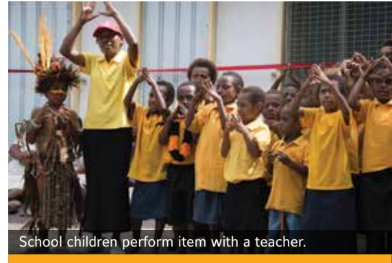
School children perform item with a teacher.