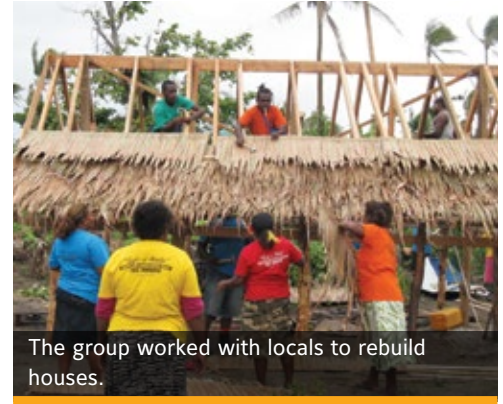
The group worked with locals to rebuild houses.