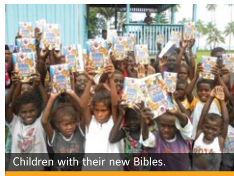
Children with their new Bibles.