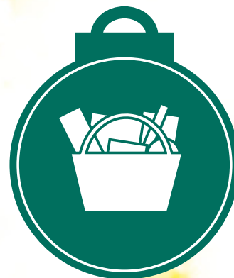
$50 Crisis Food Hamper