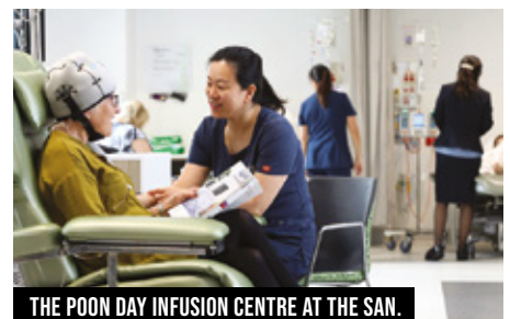
THE POON DAY INFUSION CENTRE AT THE SAN.