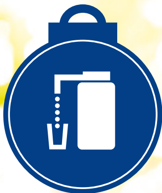
$13 Water Filter