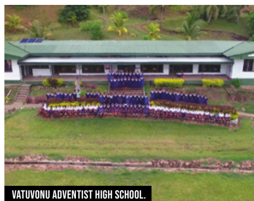
VATUVONU ADVENTIST HIGH SCHOOL.

He thanked the many people who had supported and prayed for Vatuvonu (on Vanua Levu, Fiji's second largest island) since the government commenced legal proceedings against the school and the Church on April 15. The orders blocked the Church's ability to run the school, including having any