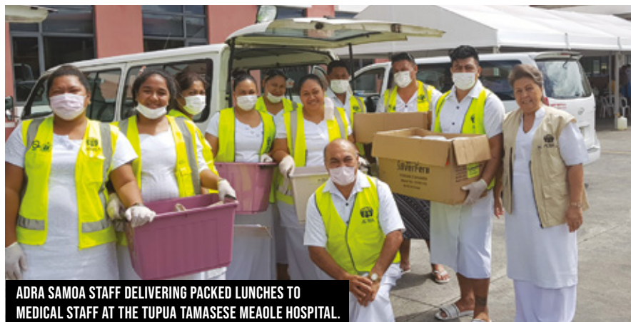
ADRA SAMOA STAFF DELIVERING PACKED LUNCHES TO MEDICAL STAFF AT THE TUPUA TAMASESE MEAOLE HOSPITAL.