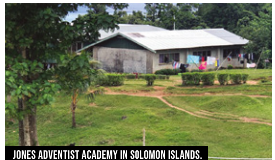
JONES ADVENTIST ACADEMY IN SOLOMON ISLANDS.

ADRA will provide tax-deductible receipts. To support the project, contact Kylie Humble at ADRA Australia.