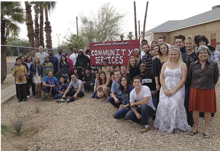
The young adult ministries team made compassion their theme during the event.