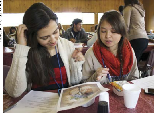
Two students review handouts during free time.