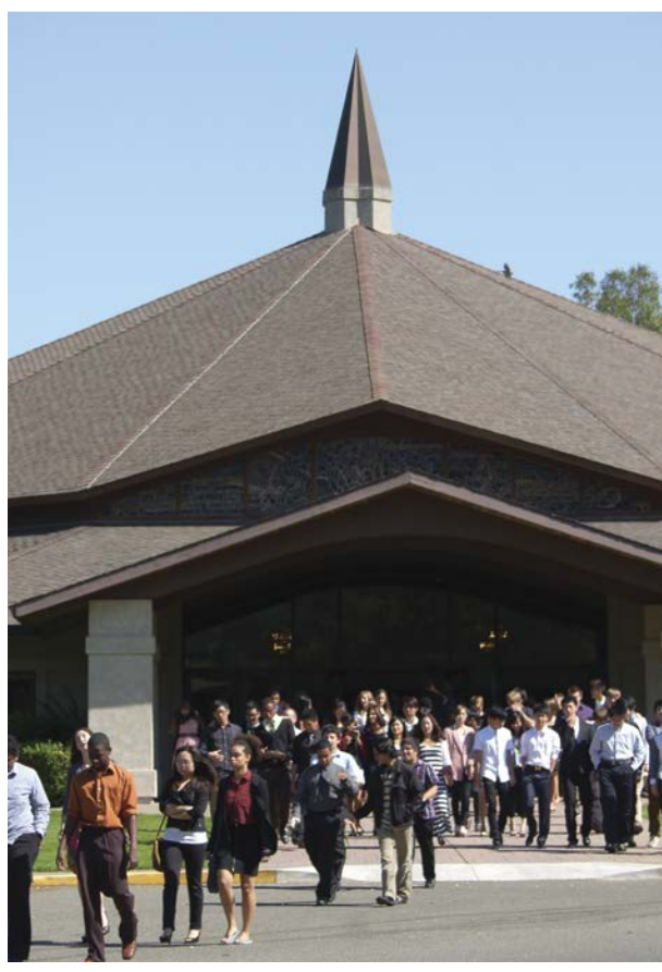
Completed in 1988, the church at Rio is a place for worship services, vespers programs and weeks of prayer.