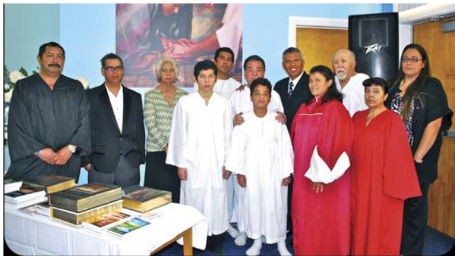
The 11 newly baptized members pose with their pastor at the end of the series.