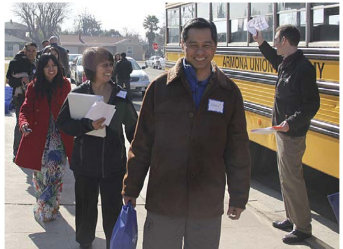
GLOW Rally attendees carrying bags of The Great Controversy board two busses to distribute to area homes and businesses on Jan. 19.

“They just loved them all and promised to read and watch them. Just before I left, the younger guy said, ‘I wonder what they [deceased loved ones] must think, looking down from heaven at all that goes on down here.’ The other guy softly said, ‘You know, the Bible teaches that they actually don’t know anything.