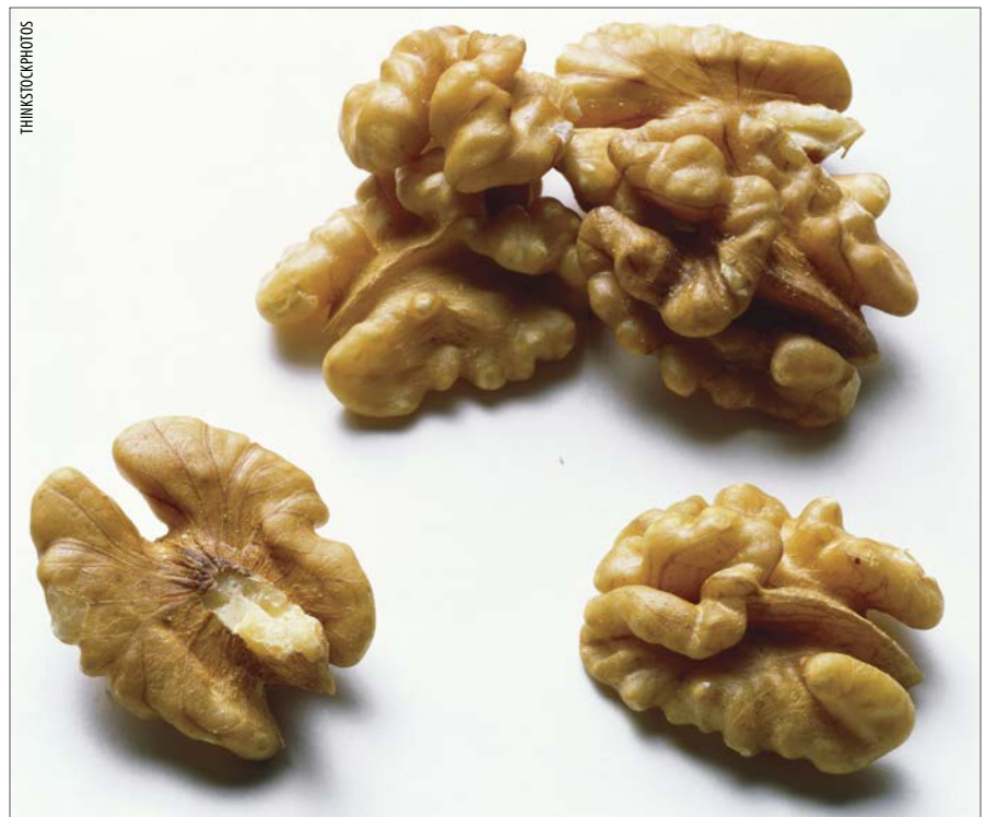
New research from Loma Linda University determines that a diet high in omega-3 fatty acids can accelerate recovery following a spinal cord injury. Walnuts are an excellent source of these fatty acids.