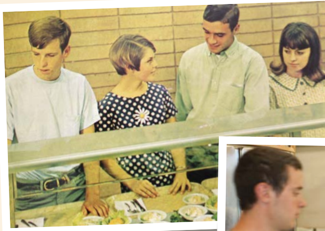
Students go through the cafeteria line in 1968 and 2012.

D uring the late 1950s, the Northern California Conference began a fundraising campaign that would provide Adventist education for thousands of students throughout Northern California. The conference's dream was to build a state-of-the-art boarding school — not only to offer a quality education to high school students, but also to lead them to Christ and prepare them for eternity. That dream became a reality on Sunday, Sept. 2, 1962, when Rio Lindo Adventist Academy registered the school's first 304 students. Fifty years later, by the end of this school year, Rio