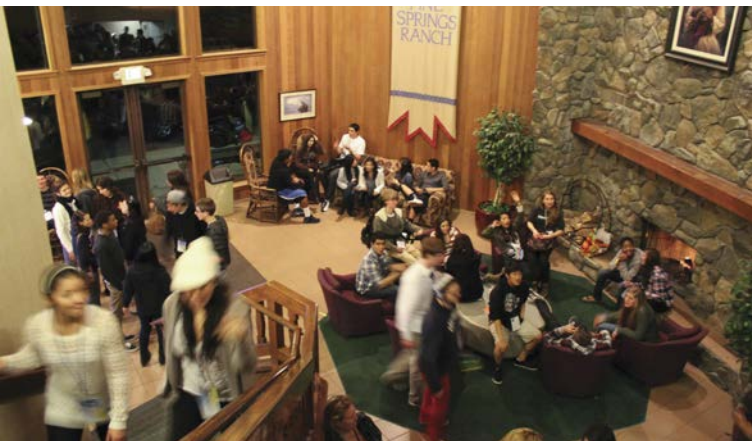
Students arrive at Pine Springs Ranch and socialize with friends from other schools.

to devotional thoughts. On Friday night, the last full night of the conference, there was an "Afterglow" program, at which students sang, conversed, prayed and had snacks together.