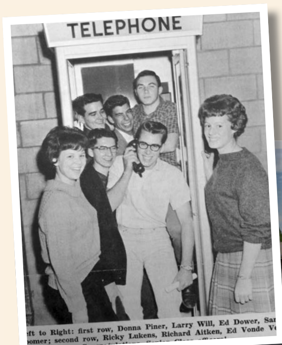
In 1962, the senior class officers were featured in the school's newspaper, Rio Lindo Currents.

Rio's mission statement: "We commit to reflect Christ, cultivate the relevancy and excitement of learning, and impact the world through service."