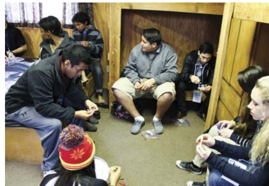
Students participate in a "family group" breakout session.