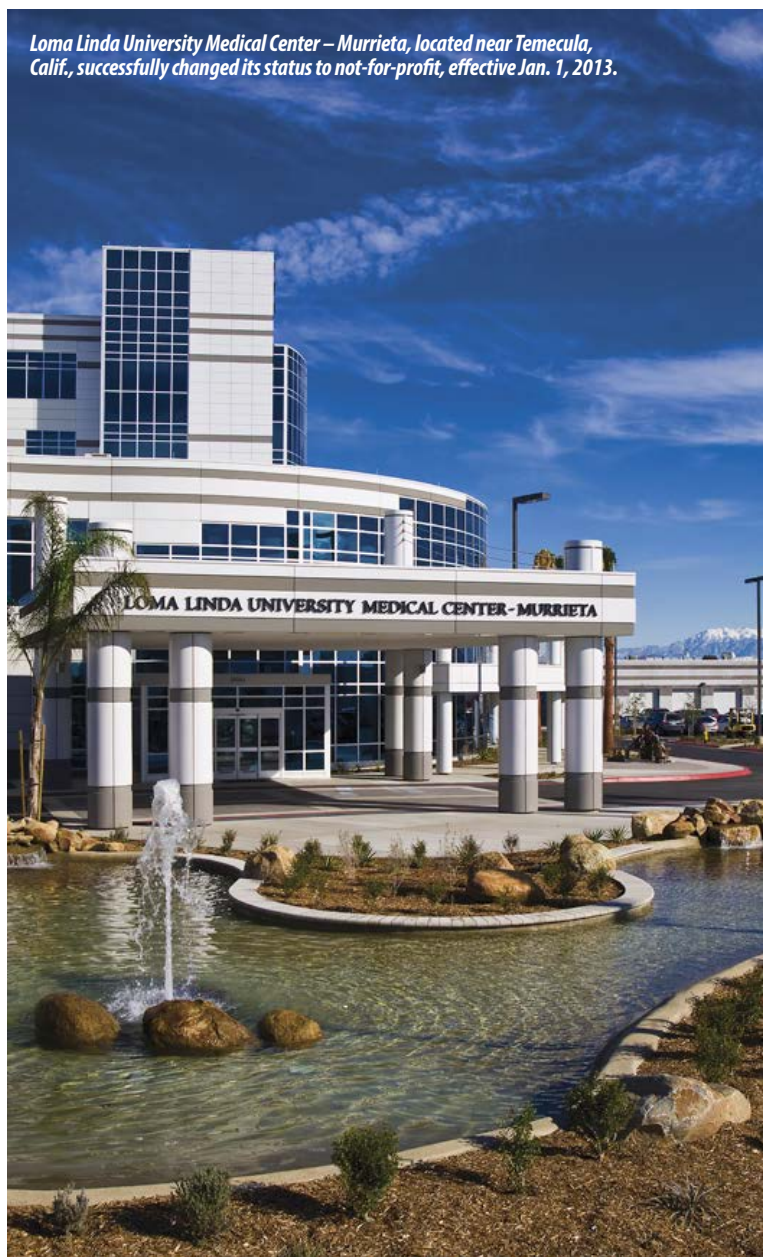
Loma Linda University Medical Center – Murrieta, located near Temecula, Calif., successfully changed its status to not-for-profit, effective Jan. 1, 2013.

Come be a part of our community at WWW.FACEBOOK.COM/LOMALINDAUNIVERSITY