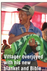
Villager overjoyed with his new blanket and Bible