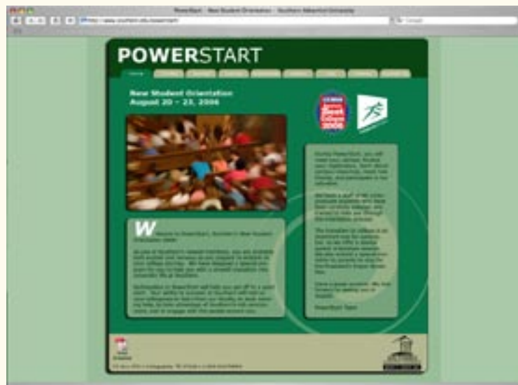
PowerStart's website is helpful for new students and parents coming to Southern in the fall.

Students have a new web resource for PowerStart, Southern Adventist University's four-day, new student orientation program.