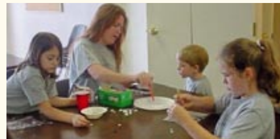
Each club led in a craft or game.

Each club led in a craft or game. There were pictures to color of activities of families, making tambourines, painting wooden maracas, creating hands and ears with Play-Doh, assembling a picture of the wall of Jericho and the scarlet cord, and a water relay