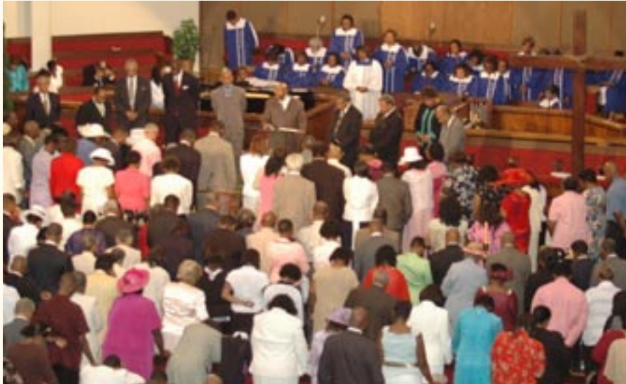
Hundreds respond to the altar call at South Central's 60th anniversary camp meeting.