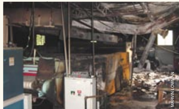
Fire began in the ironing-folding area of the Madison Academy Linen Service when lightning struck the electrical service.

Linen Service is owned and operated by Madison Academy, a day academy of the Kentucky-Tennessee Conference, located in Madison, Tenn. The academy has operated the industry since 1964, and provides employment for 17 full-time adults and up to 50 students of the school.