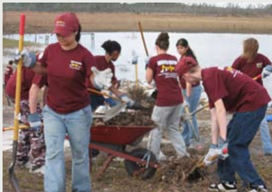
Disaster clean-up from Florida tornado, March 2007

Heritage Academy has a rich history. Its roots began at Madison College, dating back to 1904. The curriculum follows Tennessee state guidelines and is accredited as a Category II school with the state of Tennessee. On average, 80 percent of graduates choose to go directly to college, and many of them are involved in Church work around the world. They include pas-