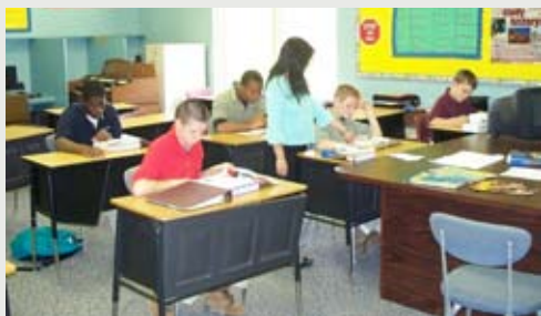
Small classes benefit students.

The ministry has changed its name, but not its mission. Advent Home Learning Center, Inc. (AHLC), formerly Advent Home Youth Services, Inc., remains a symbol of hope for reversing ADHD in teenage boys. During the years, the Center continues to provide quality remedial education for special students and to successfully mainstream them back into the regular school system.