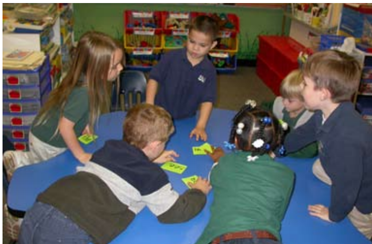
Children at Jacksonville Adventist Academy learn through hands-on activities.