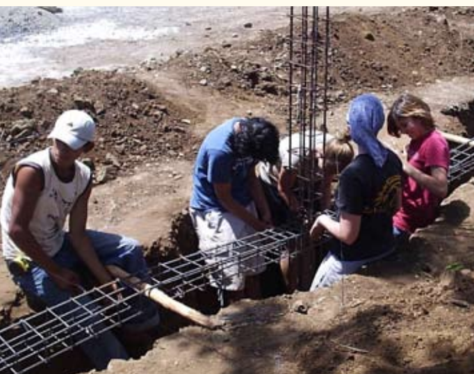
One project at the orphanage was to group rebar together by hand for the footers and columns of the maintenance building, in preparation for pouring of the cement.