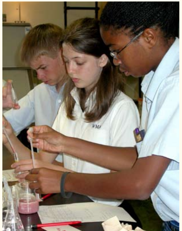
The science program at Walker Memorial Junior Academy is well-known for its relevant curriculum.

In the Florida Conference, the driving force behind all of this innovation is the heart of the child. Our impetus for excellence is best expressed by the opening lines of our mission statement: “Every child is a unique individual, created in the image of God with distinctive gifts, talents, and abilities. It is our belief that the work of true education is to equip students to think and to act with breadth of mind, clearness of thought, and the courage of their convictions. We believe that each child has a special purpose for being placed on this Earth.”