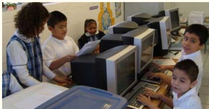
Students at the newly opened Atlanta Adventist International School enjoy using the computers as a part of their learning experience.