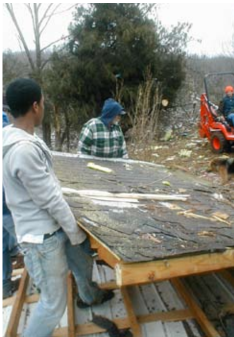
Tornado clean-up enlisted the help of 45 students.

Service for one another unites our campus. Prayer groups give students the chance to build their spiritual lives while building relationships with each other.