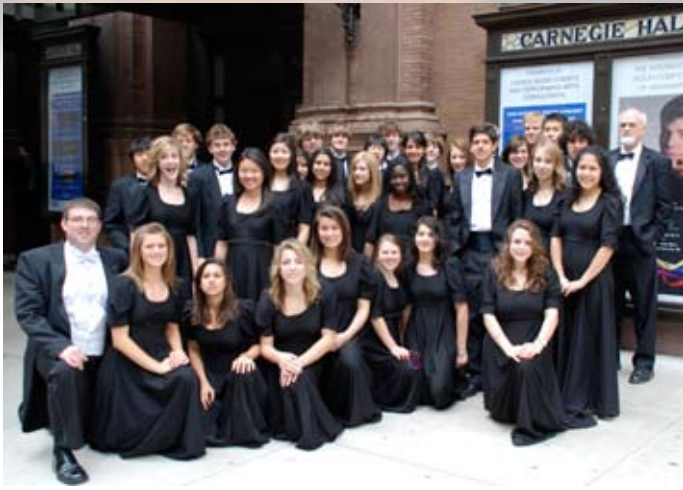
Orchestra members pause for a photo before a performance at Carnegie Hall.