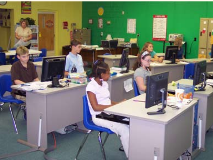
Ridgetop Adventist Elementary is on track to becoming an EDGE School of Excellence.

Adventist education is more than reading, writing, math, and computer classes. Every day Adventist teachers have worship and prayer with their students. During worship the teachers ask students if they have special requests for prayer, and most students will ask their classmates to pray for someone in their family.