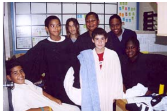
GMAA invites students to be baptized