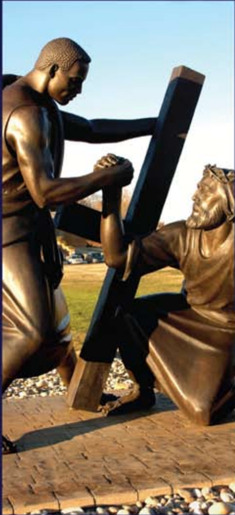
Monument to Service Enter to Learn, Depart to Serve

The Oakwood story began in 1896 with a dream, a former plantation, and 16 pioneering students. Today, Oakwood has attained university status. An award-winning campus, Oakwood University has received distinction in its undergraduate programs with more than 16 areas of study, and approximately 60 degree offerings. The first graduate students are working toward a Master of Arts degree in Pastoral Studies. Oakwood's multicultural student body comes from across the U.S.A. and forty countries around the world.