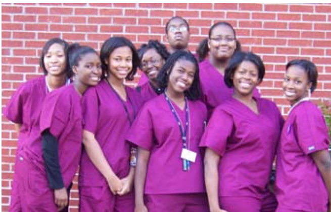
Nine students are participating in the Certified Nursing Assistant program this year.