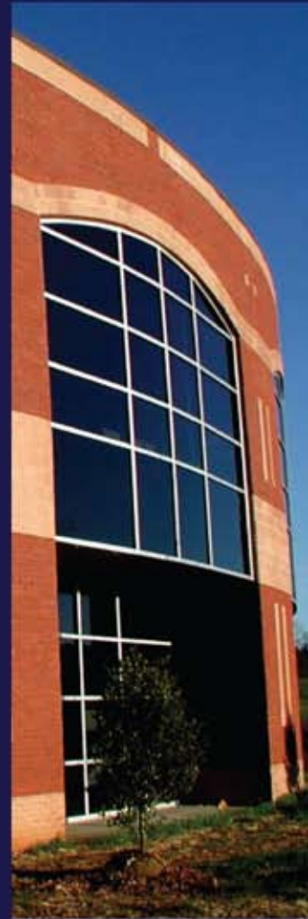
McKee Business and Technology Complex

7000 Adventist Boulevard, NW Huntsville, Alabama 35896 (256) 726-7000 www.oakwood.edu