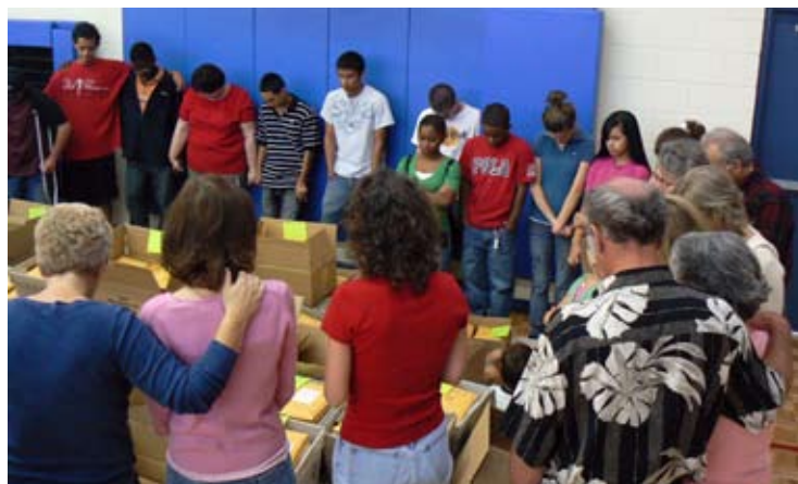
Volunteers gathered to pray before the books were mailed out to alumni.