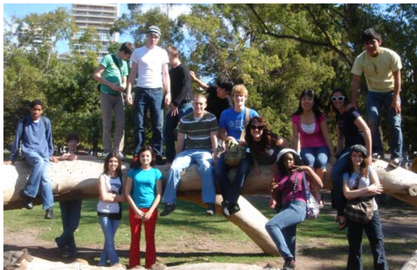
Madison Academy students enjoy a photo break during one of their visits in Argentina.

During the next week, while the building crew worked near River Plate College, the choir sang in Adventist churches and in large performing halls to the general public. Both groups made huge impacts in the communities they served.