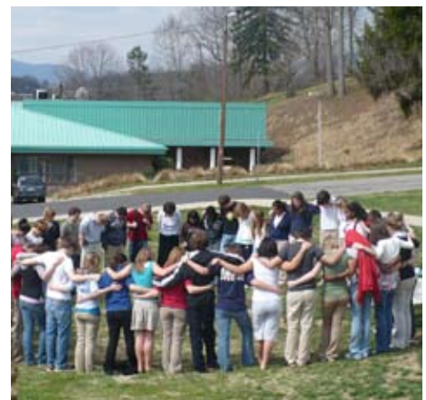
Students pray together, uniting the campus.