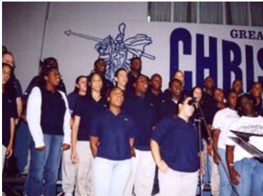
Students witness to others through song.

GMAA is a place for prayer, fun, friendship, teamwork, and sportsmanship. Every morning, teachers begin their classes with prayer and devotion. Many students travel with our ministries department to different countries, sharing God's Word on mission trips. Lifetime friendships are formed here. Our athletic department is an