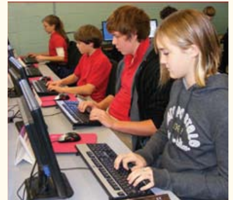
Students of Asheville-Pisgah test-drive the new computer lab.

shining example of the difference that Adventist education can make in the lives of God's kids.