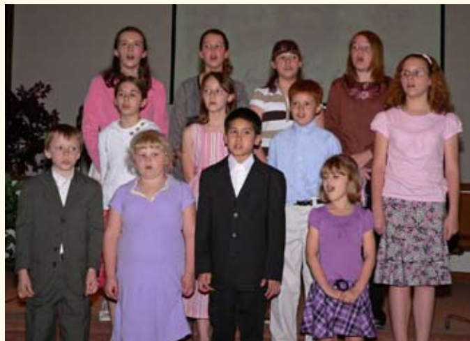
The student choir provided music for the meetings.