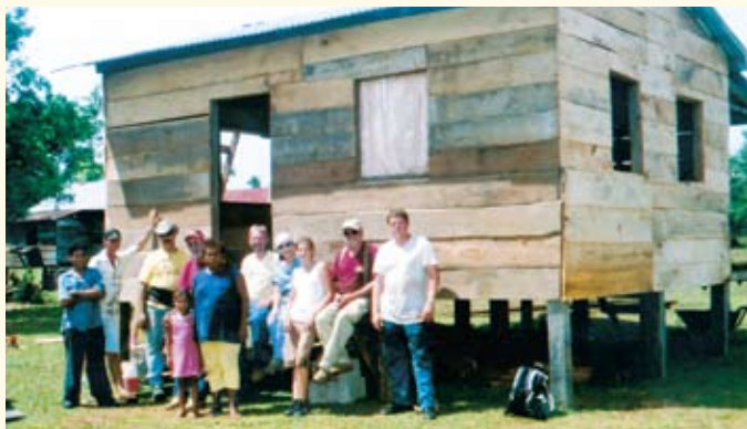
The mission group rebuilt this home for a mom and daughter.