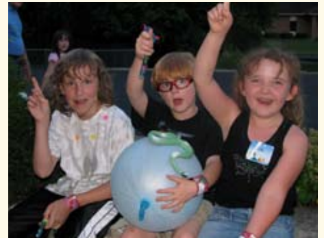
Kurt (left.), Max, and Golda are excited about discovering Jesus' miraculous power through the Power Lab program.

The VBS program, Power Lab, is endorsed by the General Conference. Children were placed in small groups called crews. They were led from one station to the next by crew leaders. The crews rotated through seven stations each night. At each station the leader reinforced the daily Bible point in different and exciting ways. Power Lab was science-themed and focused on "Discovering Jesus' Miraculous Power." Each time the daily Bible point was spoken, the