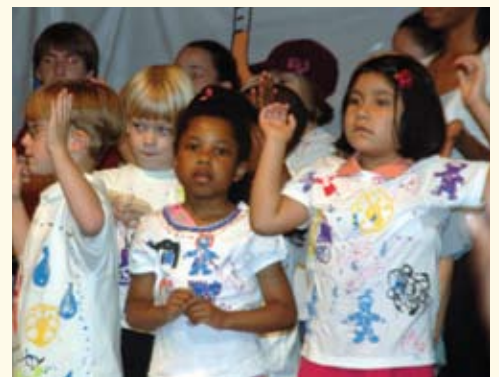
Because of WOW Wednesday, the fun doesn't have to end for these VBS graduates.

This year several of the school's teachers were involved with VBS, and one parent whose child attends the school, but is a member of another faith, also volunteered to help.