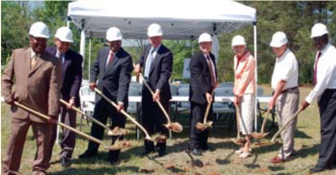
Local church and Conference leaders symbolically scooped up dirt to commence the construction of the new church building.

April 22, 2008 marked a special milestone for the Opelika, Ala., First Church. For three years, the church has met in a renovated house on their current property of 7.3 acres. The members agree that this prime property, with frontage to a main thoroughfare, will provide a visible setting to their new church building,