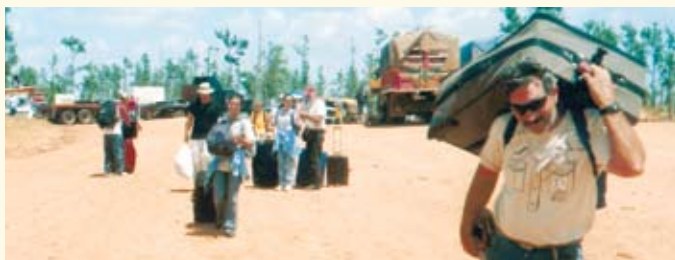
When political unrest created road blocks in Puerto Cabezas, the Naples mission team was the only mission group given clearance to proceed to the airport. Transportation to their plane included bus, taxi, truck, and walking for more than half a mile.