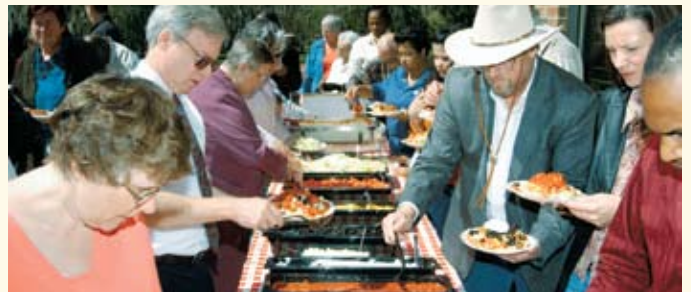
Haystacks and fellowship provided a memorable Sabbath meal.