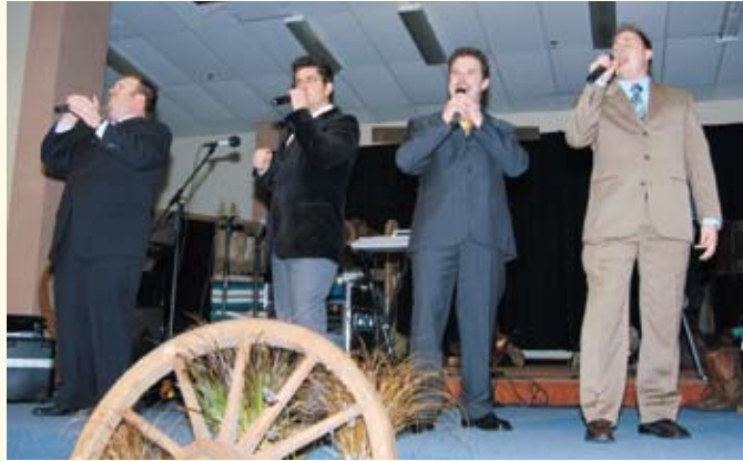
Driven Quartet provided sounds of Southern gospel music.

Appreciation for the weekend prompted a North Florida Camp Meeting Committee vote to host Cowboy Camp Meeting again — March 6-8, 2009.