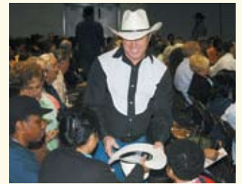
Cowboy hats stood in for traditional offering plates.