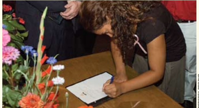
Members sign the charter member list of the Conyers Hispanic Church.