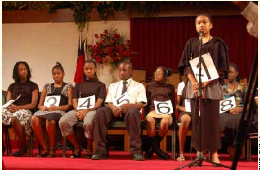
Contestant number one is preparing to spell the word that was given to her during the 11th Annual Spelling Bee.