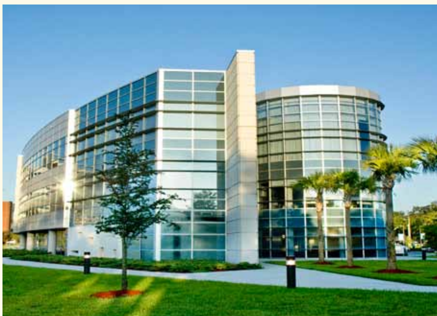
Students find the FHCHS campus a peaceful place for studying.

learning environment. Learning modalities, coupled with cutting-edge technology and hands-on learning labs, provide a unique blend of educational excellence. The College is committed to provid-