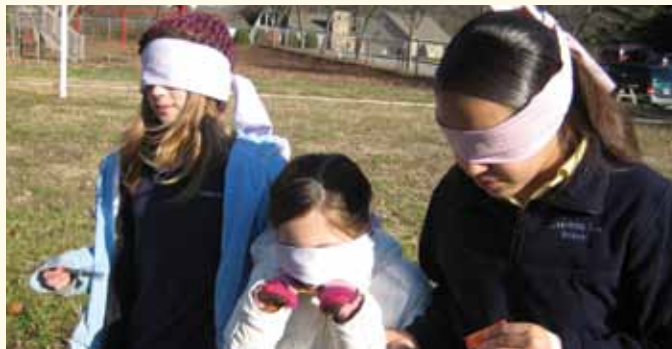
Students made unique, meaningful connections with God during the Spiritual Emphasis Week at Learning Tree Elementary School in Dalton, Ga. The Making Connections theme included team building, a variety of guest speakers, and a prayer room.