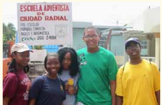
Students from Berean Junior Academy in Charlotte, N.C., pause for a picture in front of the school they helped to repair.