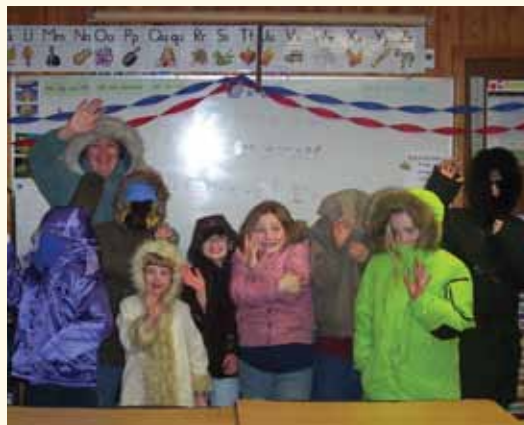
Students at Murphy Adventist Christian School walked to Anchorage Alaska in time for the Iditarod Race. They are now headed for Hawaii.