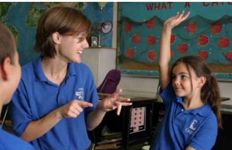
Student-teacher interaction is important at Ooltewab Adventist School, Ooltewab, Tennessee.