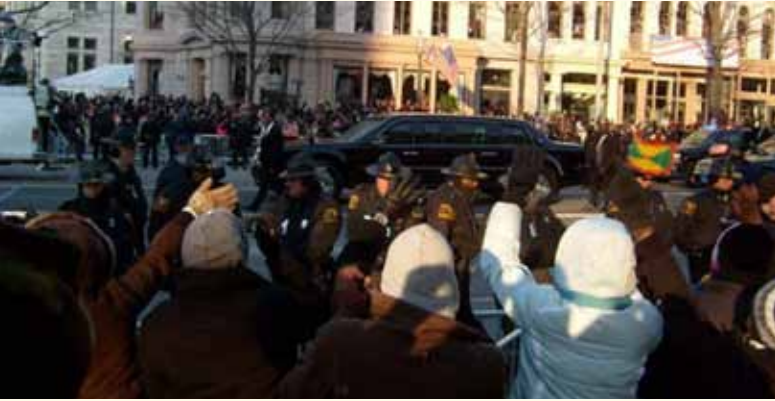
Students from Napoleon Smith Adventist Academy in Greensboro, N.C., wave as the limousine carrying U.S. President Barack Obama passes them during the inaugural parade.

The traditional classroom setting is beneficial to most students. However, there is a wealth of learning experiences beyond the classroom walls that is an essential part of the educational and personal development of students. Allowing youth to experience what they have seen and read in their textbooks is an invaluable educational tool.