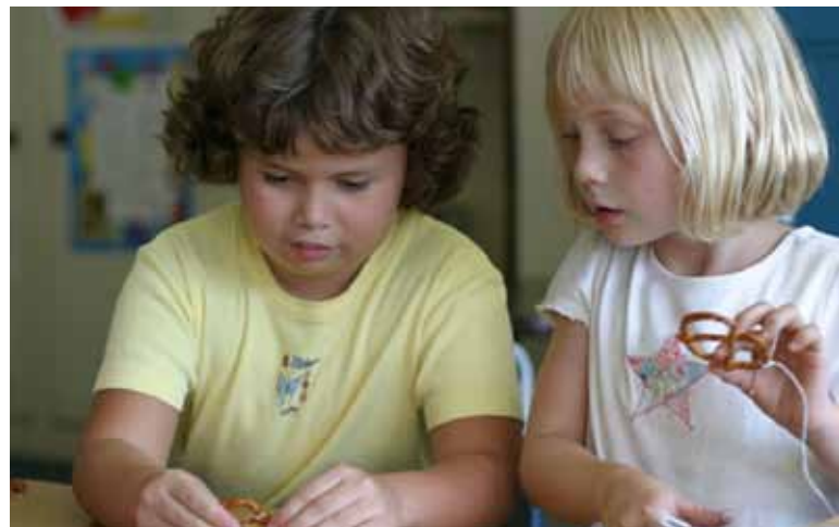
Early Childhood students from Big Cove Christian Academy in Owens Cross Road, Alabama, share an educational, fun-filled moment.