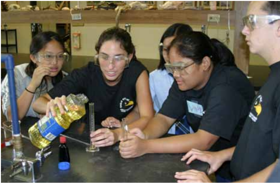
Students at Walker Memorial Academy in Avon Park, Florida, enjoy the experiments during lab projects.

We can thank God that, amidst various challenges and questions about the quality of public education in the United States, Seventh-day Adventist students perform consistently strong academically compared to national norms. Our students, at every grade level, and regardless of the size of the school, are performing above their predicted ability according to the performance indicators from the current CognitiveGenesis national study. We are now in the third year of this four-year comprehensive study of K-12 Adventist students. This is a clear indication that the Lord is blessing our school system.