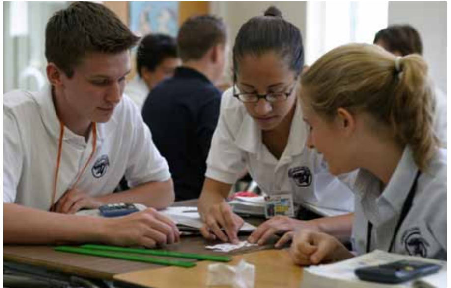
Students enjoy working together on a special project at Forest Lake Academy, Apopka, Florida.

The North American Division Journey To Excellence challenges the will of each school to meet the changes in Adventist education required in today’s world. Our schools, although doing well academically, need to fully implement the Journey To Excellence Goals and Preferred Practices recom-