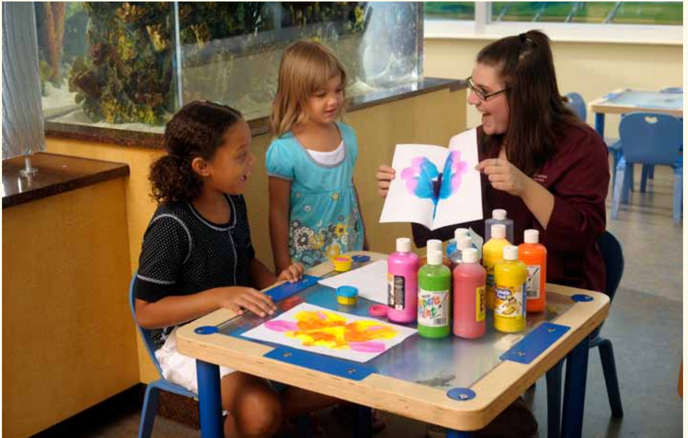
Service learning activities are a vital part of the FHCHS college experience.

development of students is an important part of the mission of this institution,” 92 percent of freshman and 91 percent of seniors, either agreed or strongly agreed with this statement. Comparison groups rated 54 percent and 45 percent respectively.