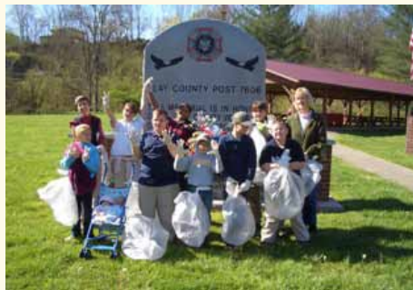
Students at Appalachian Christian Academy donate their time to help keep the city’s parks clean.

been encouraged to raise money for this project. Donations to date are approximately $2,000. This is an average of more than $330 per student, compared to