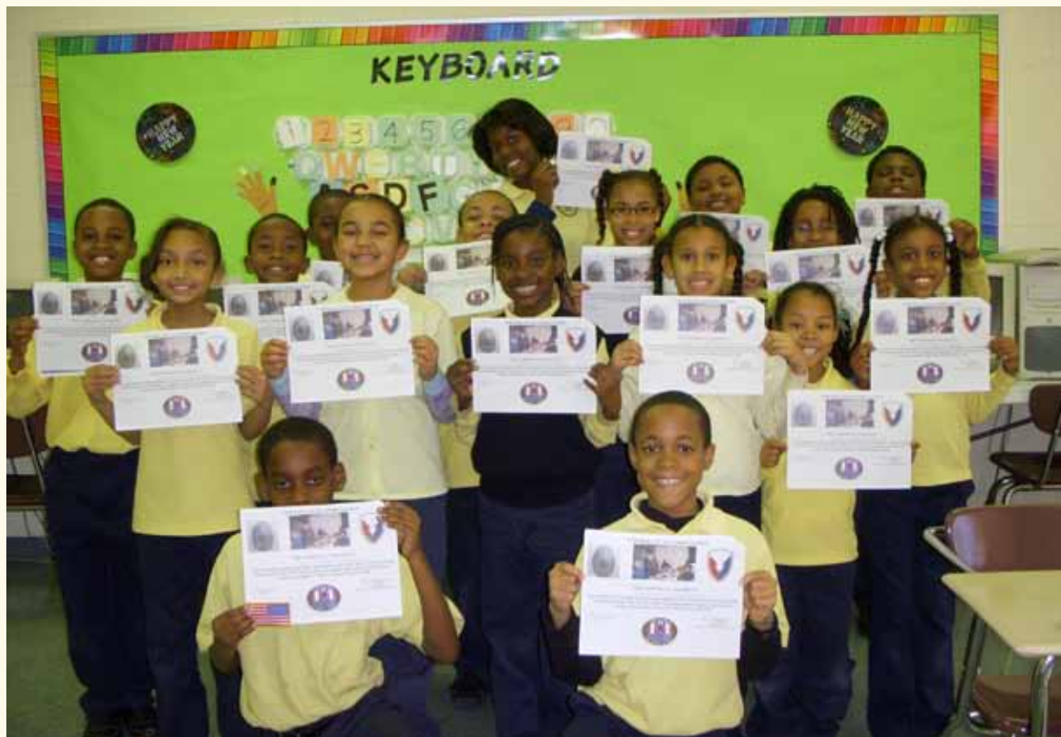
Students received Certificates of Appreciation. On the certificate was a photo of Army Material Command civilians who are in the war supporting the soldiers, and a picture of the jade coin given to students.