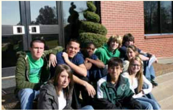
During this time of economic challenge, Highland Academy students are still the best advertisers.

other educational options, Highland held Academy Days over Friday and