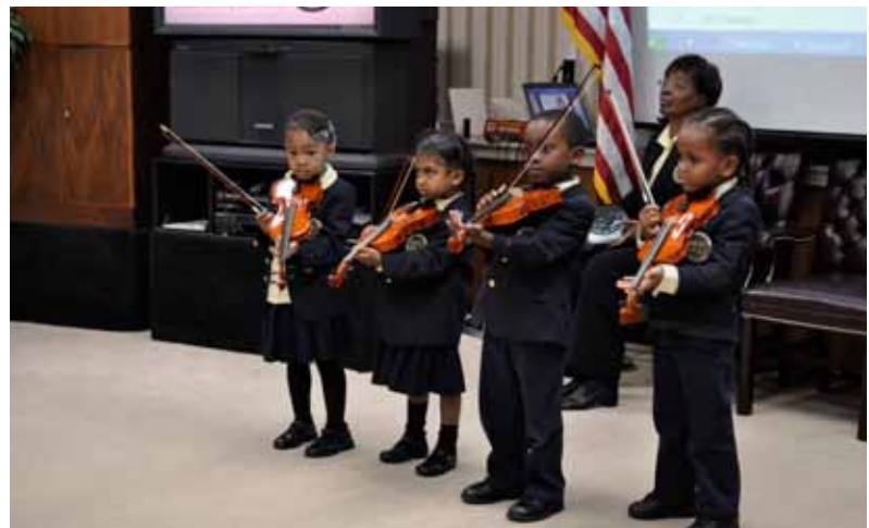
Students from Berean Early Childhood Development Center in Atlanta, Georgia, provided worship during the Southern Union Board of Education meeting in March.