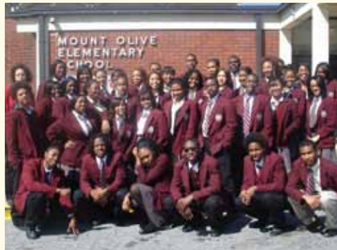
Students from Greater Atlanta Adventist Academy in Atlanta, Ga., pose for a picture in front of the elementary school where they participated in Read-A-Book Day.

In an attempt to develop a closer bond among the student body and staff, family groups have been established. In these groups,