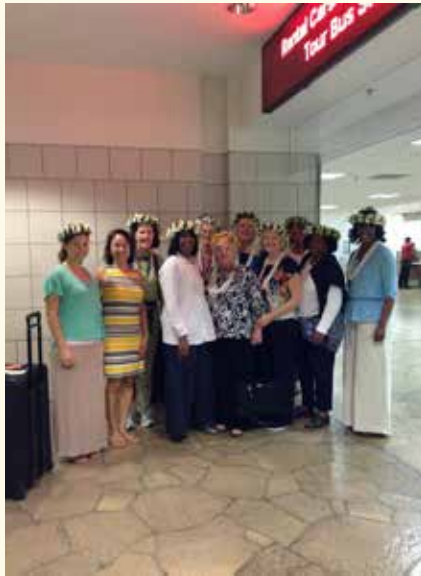
Upon arrival to Guam, the ministerial spouses were greeted with a marmar.