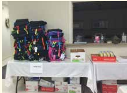
The donated book bags are ready to be filled with school supplies.

the book bags with school supplies and snacks, which