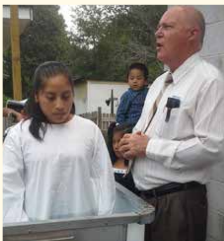
Momento de la ceremonia bautismal

El 26 de Julio la congregación de Saluda, NC, recibió gozosa a un alma más que tomó la decisión de bautizarse y unirse al camino que lleva al Reino de los Cielos.