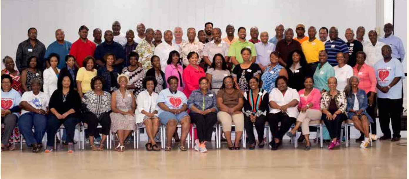
Couples from central Mississippi