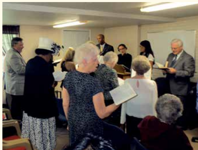
Worship service at La Grange Company on Sabbath, August 9, 2014