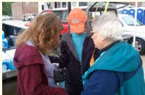
Health problems, financial worries, and stress were the focus of an impromptu prayer time.

At Franklin County, Tennessee's, first one-day community outreach event, the two Decherd Adventist churches were poised