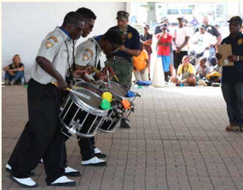
Members of the Shiloh Eagles Pathfinder Drum Corps perform a routine as judges mark the judging rubric. The Eagles received a First Place Award for their performance during the International Camporee Drum Competition in Oshkosh, Wisc.

sion to get baptized before attending the camporee. "I love the Lord. This is a big step for my life," she added.