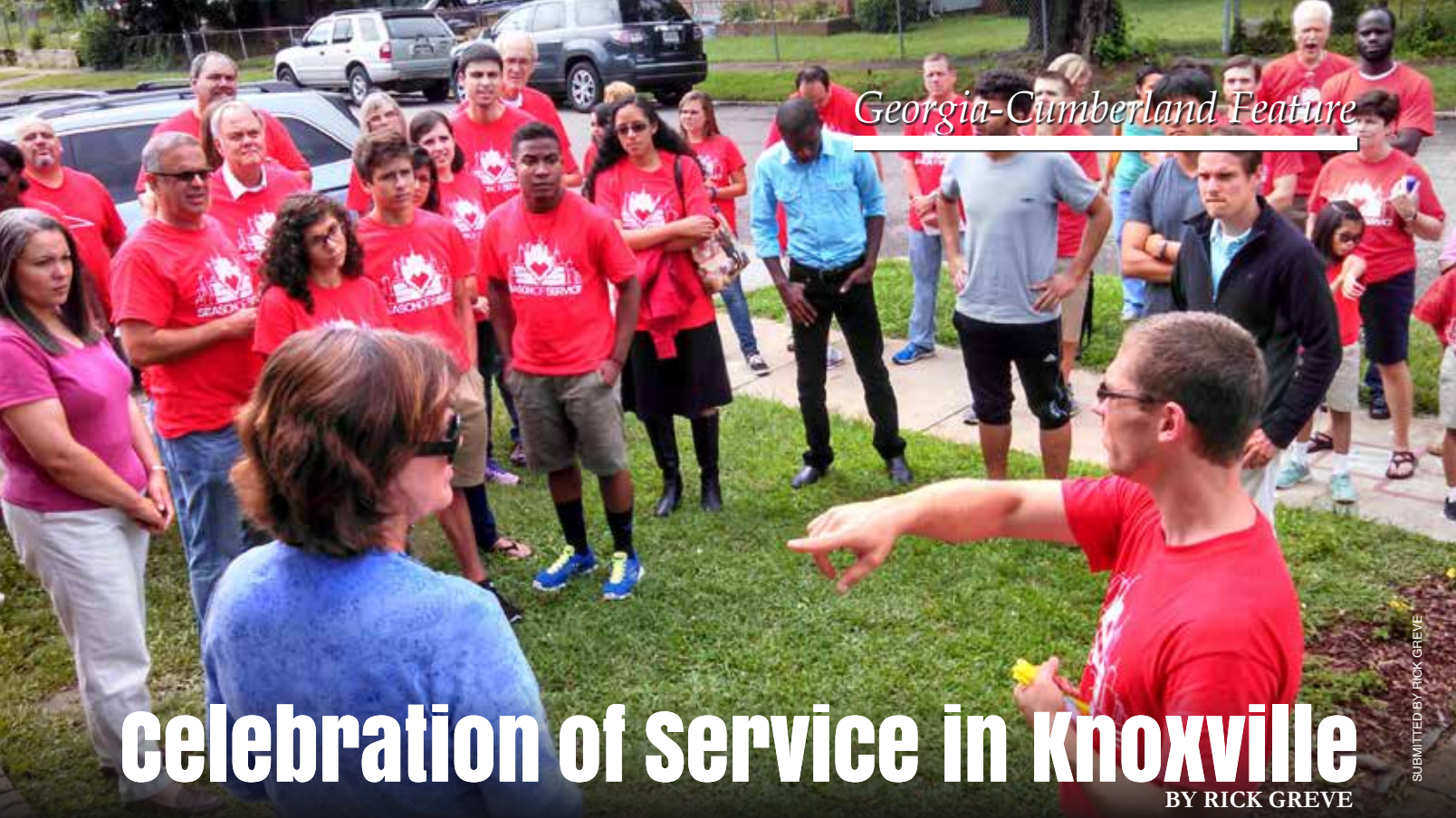
SUBMITTED BY RICK GREVE