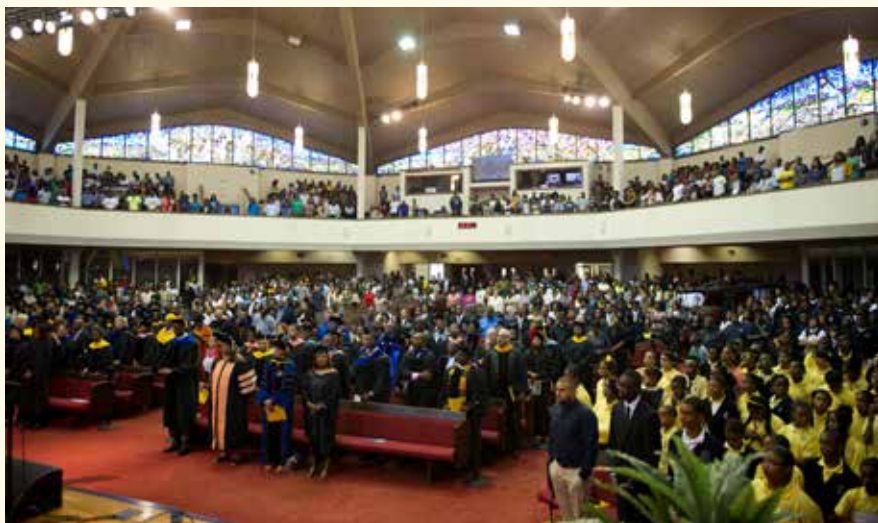
Individuals from Oakwood University community, faculty, and staff, and students from Oakwood Adventist Academy joined in a special dedicatory service at Oakwood University Church in Huntsville, Ala.