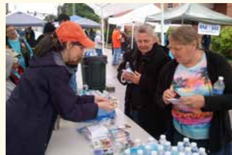
A variety of practical pamphlets addressing common life issues of physical and emotional health caught the attention of two guests at the Adventist tent.

First Church and Decherd Church continue to create ways to reach beyond their own interests, and put the community first. July's combined Vacation Bible School and this