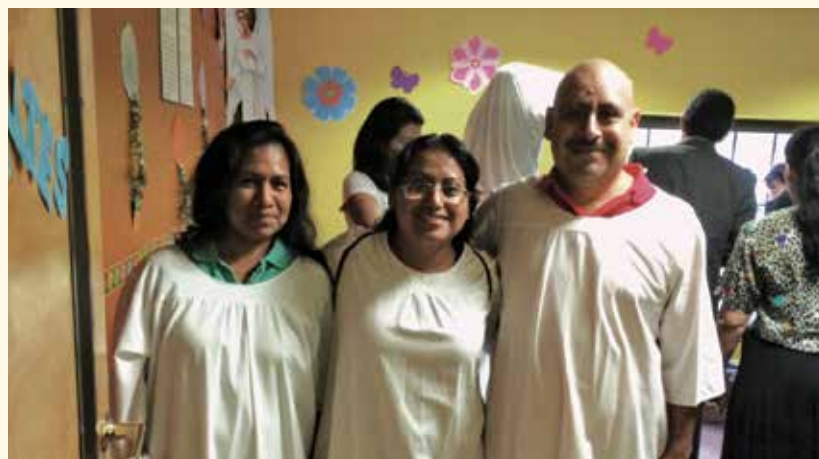
Candidatos de bautismo antes de la ceremonia