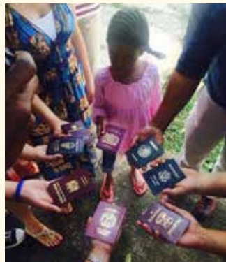
Eight countries, one mission... Mission Guatemala

Stepping into the river, the cold water would take a person's breath away. Though the temperature of the water was cold, the atmosphere was full of excitement. People were singing praises to God all around while others stepped into