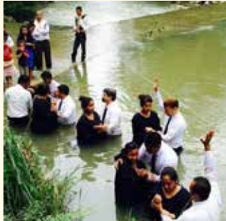
Most of the 98 new converts were baptized in the Machaquila River, as seen in this photo.

Mission Guatemala began as a collaboration between three churches — Ridgetop, Highland, and Madison Campus. However, what began as a mission trip made up of three churches has now turned into something much greater. This year Mission Guatemala had teams that included small groups from Texas, east Tennessee, and Columbia County. In all, the team of 62 had representatives from at