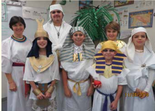
SUBMITTED BY HOLLY ABRAMS

then made and wrapped a child-sized mummy and put it in a decorated Egyp-