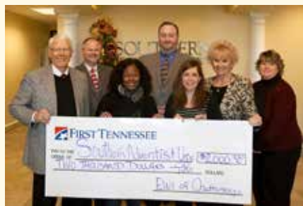
Two student scholarship recipients (center), are surrounded by campus administrators and an EWI representative (second from right) during the ceremonial check presentation.

Executive Women International (EWI) of Chattanooga, a nonprofit that addresses the businessperson's quest for personal achievement and drive for professional development, recently presented two $1,000 scholarships