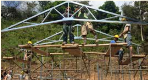
The steel structure begins to take shape with the help of students from Georgia-Cumberland Academy.

Members of the Cerro Campana Church in Panama are now worshipping in a newly constructed sanctuary, thanks to an international partnership that included the Decherd Church members.