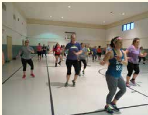
Participants who attended the REFIT® classes

following a plant-based diet for six years and enjoyed the sample recipes.