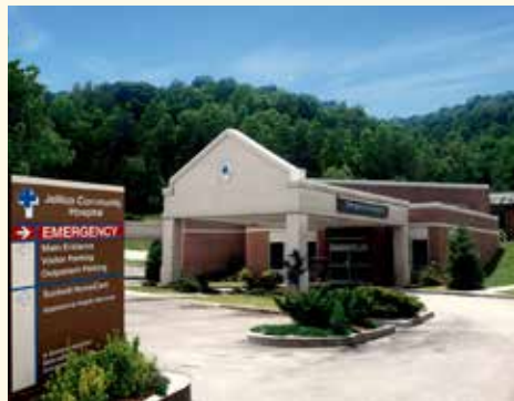
Jellico Community Hospital in Jellico, Tenn.

Under the agreements, Jellico Community Hospital in Jellico, Tenn., as well as the hospital's CarePlus Center in Williamsburg,