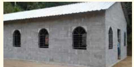
Less than two weeks after groundbreaking, the new Cerro Campana, Panama, Church is ready for occupancy.

With just days to spare, all the pieces of this international partnership came together. The Cerro Campana Church was built, and Decherd gained a new sister church. Now members of both congregations are praying that God will