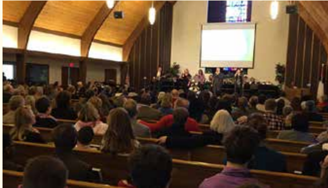
Members of eight local congregations came together for the Festival of Faith in Louisville, Ky.

Approximately 350 people from eight churches came together for the second Louisville area Festival of Faith on March 27 and 28, 2015, hosted by the Pewee Valley Church. The convocation was a beautiful blending of believers of different ages, nationalities, and languages, with all parts of the service available in English, Spanish, Korean, and Karen/Burmese to accommodate members of the attending congregations.