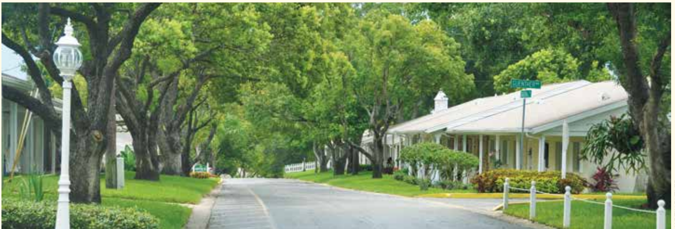
The beautiful Florida Living Retirement Community campus has 95 dwellings that can accommodate up to 200 residents.