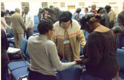
Prayer is the focal point.