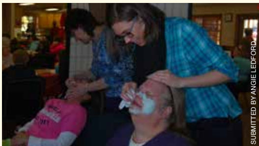
SUBMITTED BY ANGIE LEDFORD

Nothing beats a day of relaxation. The Fannin County women’s ministries and community services recently offered a God In Shoes event, and now are holding Bible studies with 10 women.