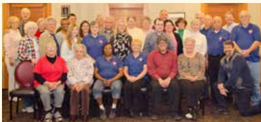
Adventist Community Service Center volunteers

The volunteers from the Adventist Community Services (ACS) Center in Madison, Tenn., were treated to an appreciation luncheon on February 27, 2015. Approximately 40 volunteers