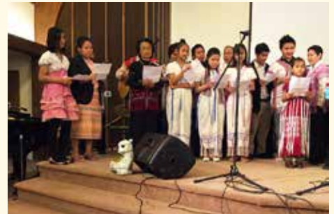
The Karen/Burmese youth wore their native dress as they shared special music during the afternoon program.

Some even came to the Festival of Faith with hurts so deep they didn’t think they could ever forgive, but went away with a transformed attitude and the tools to let go of the blame