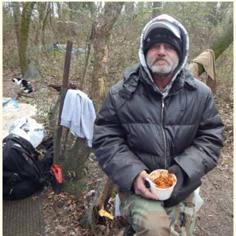
One resident is grateful for the hot meal during the cold temperatures.