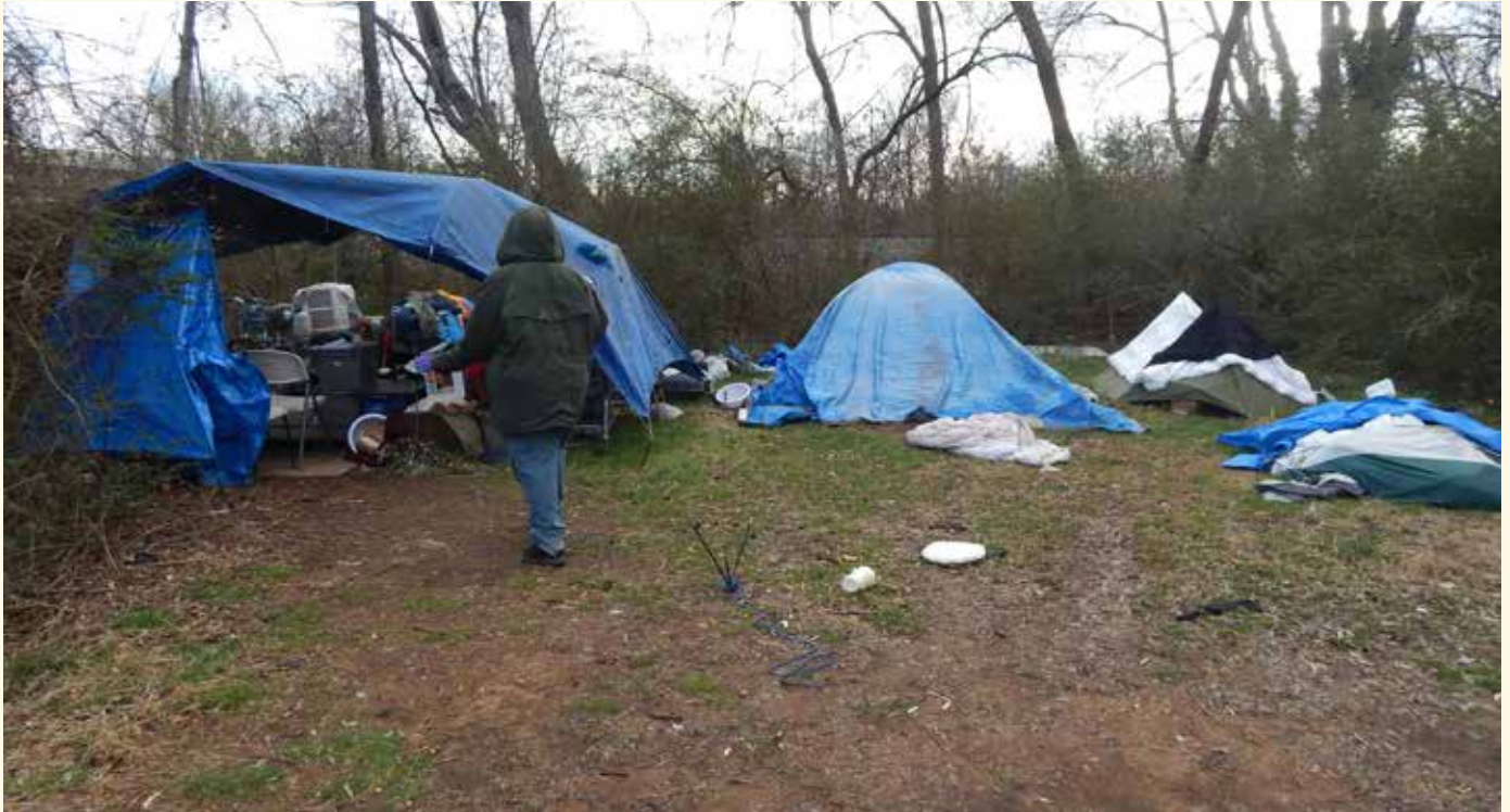
Homeless camp in Triana, Ala.

Have you ever had so much prepared food with pans of rice, vegetables, and vegetarian meats that you did not know what to do with it? That’s the situation Mt Calvary Church in Huntsville, Ala., faced after a typical Sabbath lunch. One Sabbath a young woman suggested that the extra food be taken to the homeless. With trays of warm food, plates, knives, forks, and napkins in hand, this began Mt. Calvary’s Feeding Program.