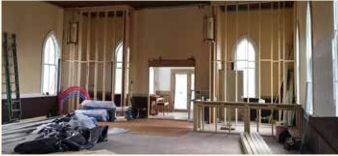
Interior renovations will include brand new wiring throughout, two new accessible bathrooms, refinished hardwood floors, and restoration of the beautiful tongue-and-groove ceiling.