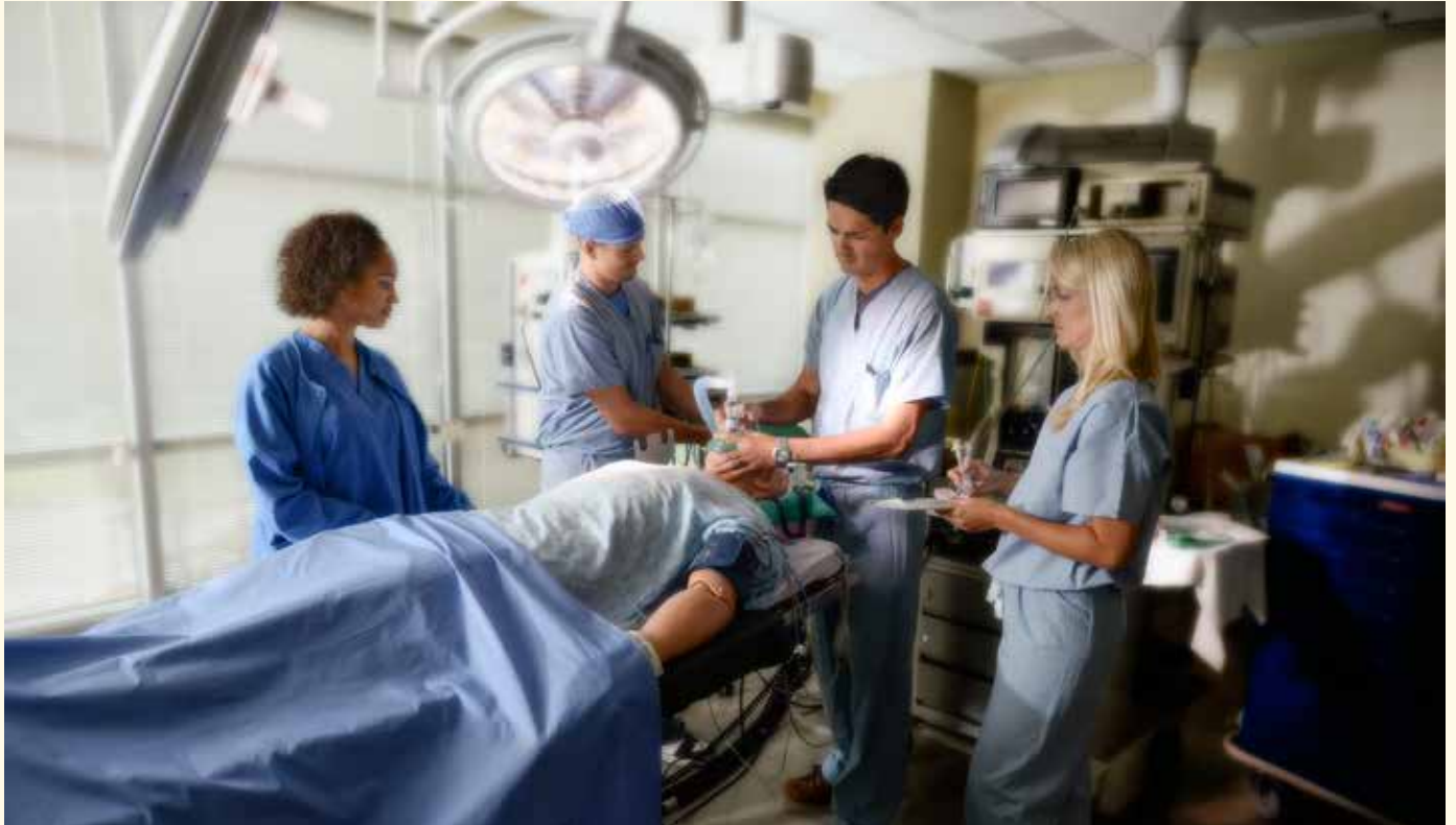
ADU's master of science in nurse anesthesia students receive hands-on training on state-of-the-art equipment.

One hundred percent of Adventist University of Health Sciences' (ADU) master of science in nurse anesthesia (MSNA) graduates of April 2015 have passed the national certification examination (NCE) on their first attempt. The graduating class was composed of 20 students who completed the program on April 20, 2015.