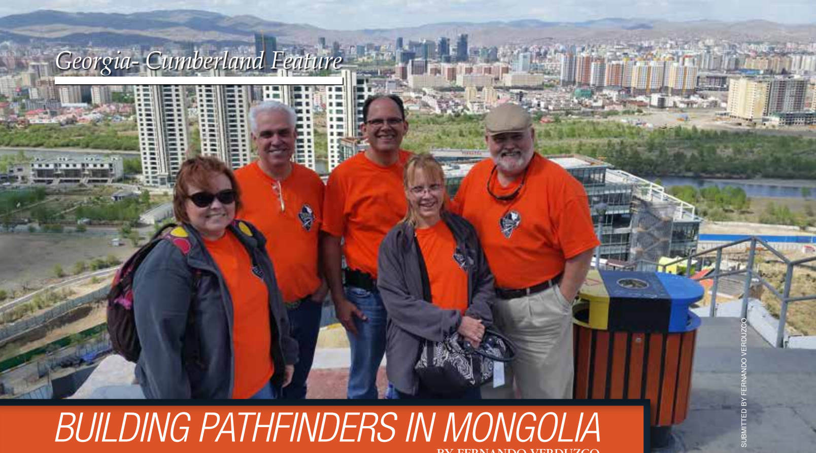
SUBMITTED BY FERNANDO VERDUZCO