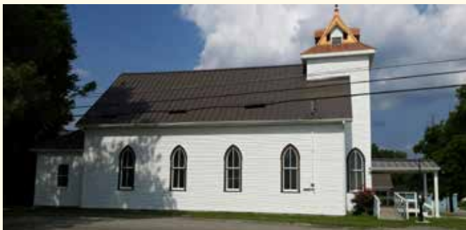
Decherd First Church

The first Seventh-day Adventist Church in Decherd, Tenn., has been through a lot since 1856. It was burned down during the Civil War, and in 1909 it