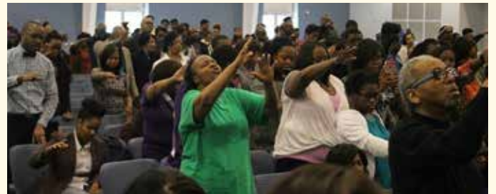
Attendees at the Convocation give God praise.