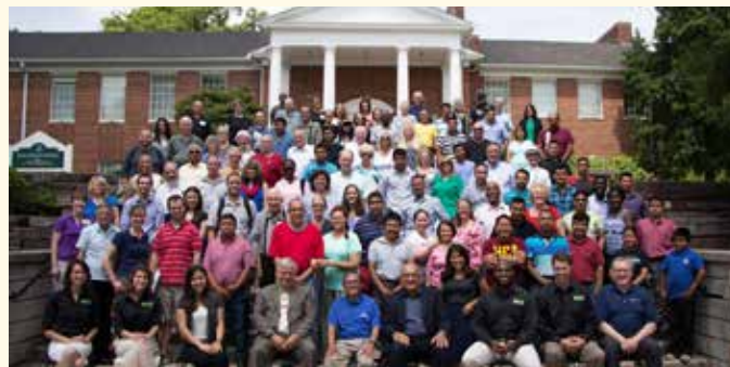
More than 60 people attended evangelistic training at Southern, June 17-21, 2015.

The citywide series, meant to commemorate It Is Written's move from California to Chattanooga, is set for October,