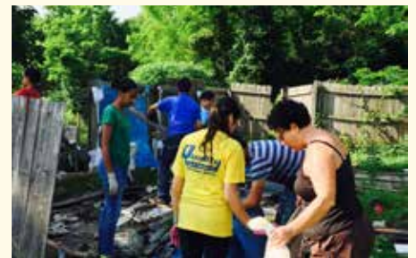
Pathfinders work hard in service to clean a farm owner's land.

The farm owner was so happy to see her land clean. For more than two years, people had dumped garbage on her property. These good deeds were a reminder that God often allows His followers to be the answer to someone else's prayers.