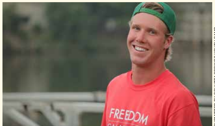
SUBMITTED BY COHUTTA SPRINGS YOUTH CAMP