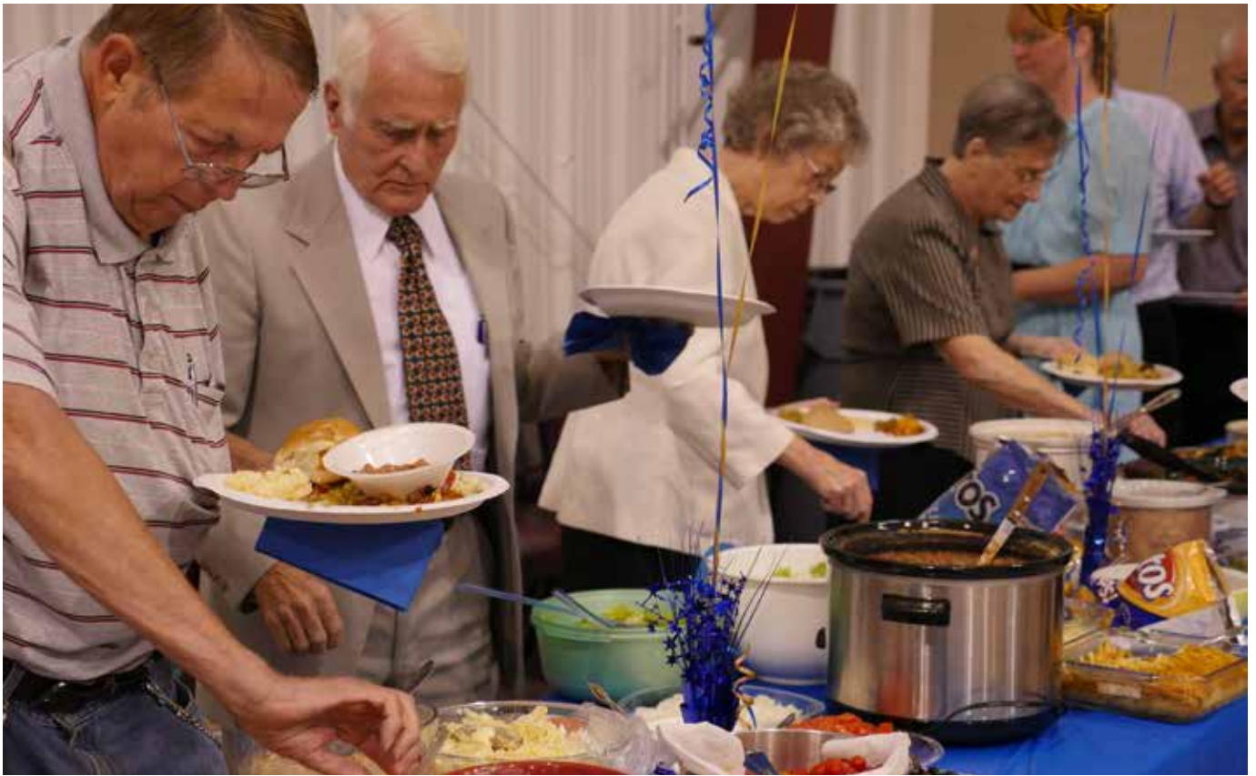
The members and guests enjoyed the Sabbath potluck meal.