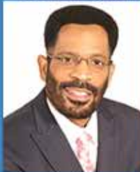
President of Southern Union Conference