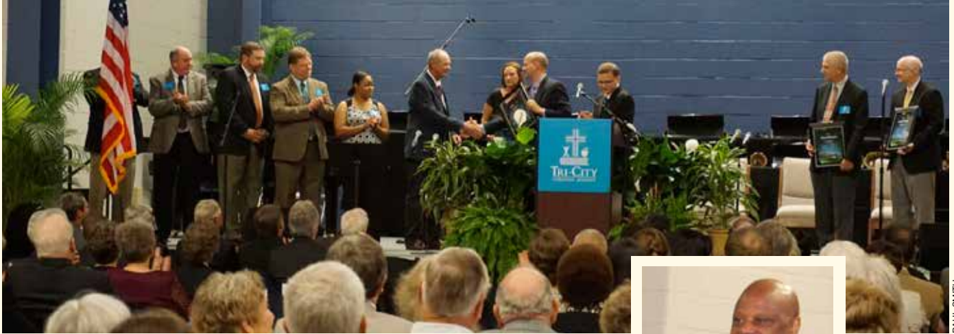
The building team and project managers receive a commemorative plaque.

The Tri-City Christian Academy in High Point, N.C., was packed with supporters celebrating the grand opening of their new school facility on Sabbath, September 19, 2015.