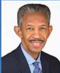
Pastor & Host of 3ABN's A Sharper Focus