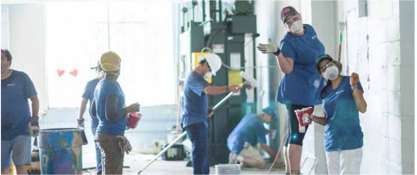
One of the many projects was to paint the CFOC warehouse, and the team enjoyed beautifying the campus.