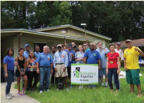
The ADU team stands in front of the central Florida home they helped transform into a more beautiful, safe place of residence for a local family.

Strong communities are built on trust and unity. Orlando is one that pulls together to strengthen and improve the entire area. Adventist University of Health Sciences (ADU) values collaborative service and sees the importance of giving back to those in need. That is why the entire campus closed for a day for staff and faculty to participate in various volunteer projects, one specifically working with Rebuilding Together Orlando (RTO).