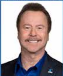
Founder of Three Angels Broadcasting Network