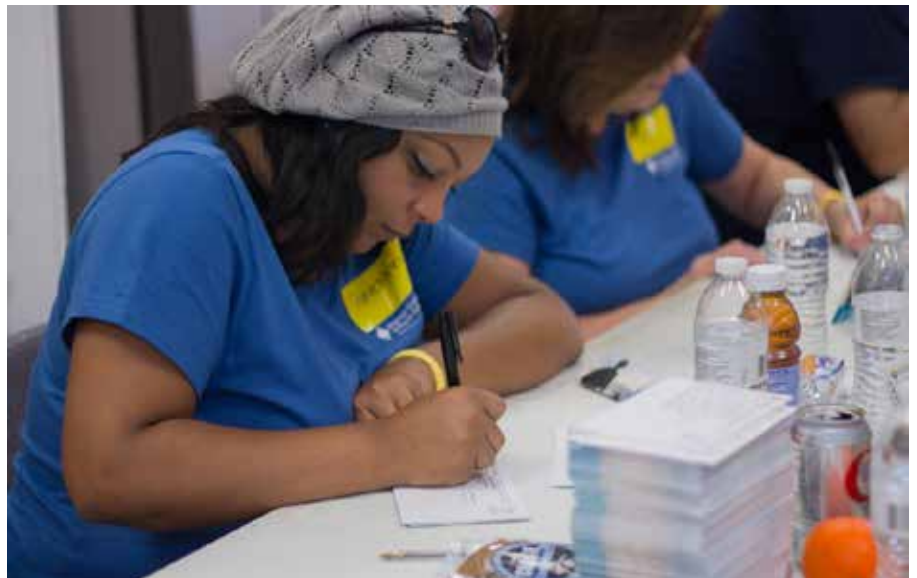
Hundreds of handwritten thank-you letters were composed by the ADU team, thanking donors for their contributions.

The leadership at Adventist University believes in giving back to the community, and sees the value in dedicating the time and manpower to make a difference. This is the second consecutive year that ADU has volunteered at the CFOC, and for its past efforts the University was awarded by the Heart of Florida United Way as the 2015 Corporate Volunteer Group of the Year. 🌟