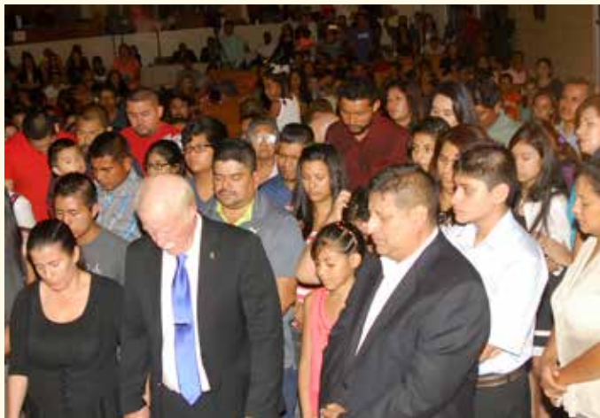
The church was full every night during the Memphis, Tenn., evangelistic series.

Recently, three conferences, Gulf States, South