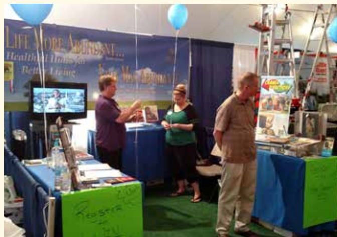
Murfreesboro Church fair booth

The fair was held during a nine-day period in August. During that time, 557,702 individuals attended. "Life More Abundant