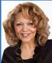
General Manager of Dare to Dream Network