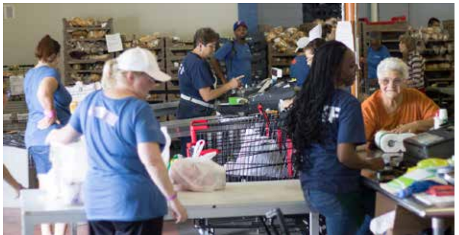
ADU volunteers helped run the CFOC Cost Share Grocery Program and Thrift Center where local residents can take advantage of lower priced essentials.