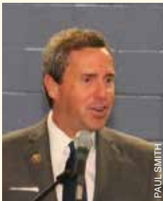
Congressman Mark Walker addresses the congregation.

an overview time-lapse video of the start-to-finish building project of the school, and a presentation of thanks to the builders and project managers.