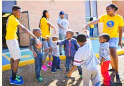
Oakwood students interact with Oakwood's Child Development Lab pre-K and kindergarten children on AGAPE Day.

AGAPE Day 2015 was October 6. The day began at 8:45 a.m., when 500 volunteers in their bright yellow T-shirts boarded the buses to be transported to work sites in the greater Huntsville area. Work projects included painting, planting, weeding, general cleanup, assisting senior citizens, and reading to elementary school children. There were 35 work sites