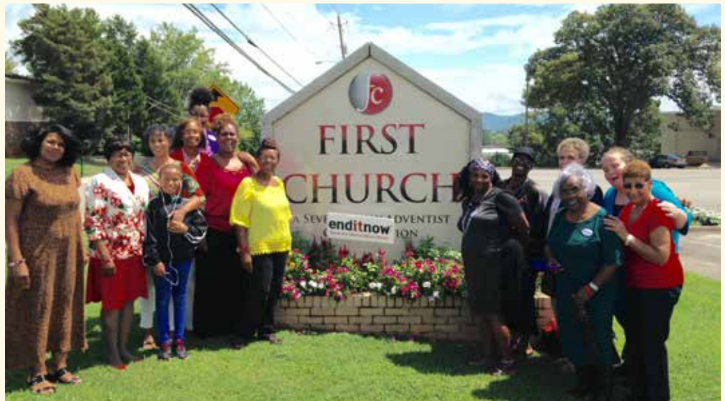
Enditnow campaign supporters for First Church in Huntsville, Ala.

a partner. (Source: National Domestic Violence Hotline.)