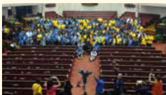
Pictured are Oakwood University guests, students, and chaperones who participated in the Oakwood Live! program last month.

More than 700 guests, 586 students, and their 136 chaperones enjoyed a plethora of activities throughout the Oakwood Live! program, with some groups arriving as early as Thursday evening, October 8, 2015, to experience a weekend on the Oakwood University campus