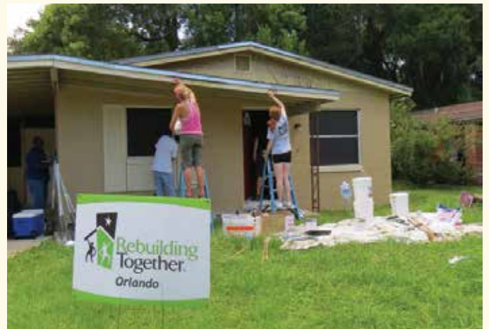
The house received an exterior makeover with fresh paint and light landscaping.

Strengthening a community takes a team, like ADU and Rebuilding Together Orlando , who both felt compelled to give back, and understand the impact one day of work can make in someone's life. The groups did much more than just paint a home.