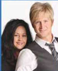
Internationally Renowned Singers as seen on 3ABN and Gaither's Home Coming Concerts

Prices start at $1,045 per person all taxes, port charges & fees included PRICES ARE SUBJECT TO CHANGE $50 CANCELLATION FEE GRATUITES NOT INCLUDED