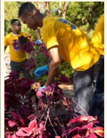
Oakwood students and staff volunteers helped beautify the grounds at the Huntsville Botanical Garden on AGAPE Day 2015.