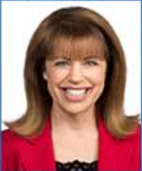
General Manager of 3ABN Kids Network