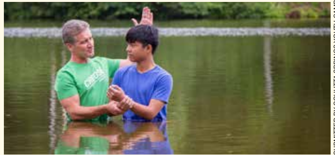
SUBMITTED BY COHUTTA SPRINGS YOUTH CAMP