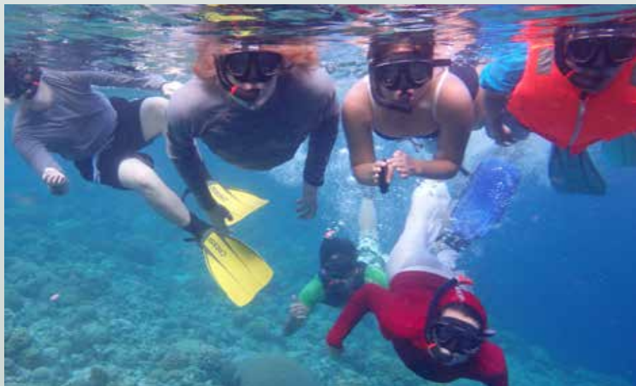
Participants on the Tropical Biology Trip to Indonesia witness the country's enormous underwater biodiversity, with more than 2,500 species of fish, corals, and anemone.