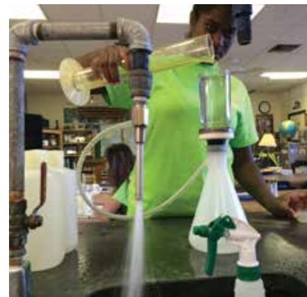
A Walker Memorial Academy student filters lake water to collect algae to determine the amount of chlorophyll “a” contained in the lake.