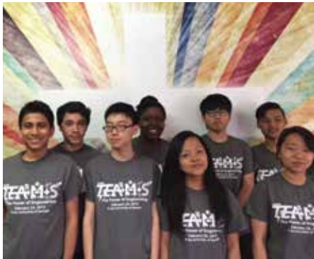
First place winners for overall high score in the state of Georgia, advancing them to the national level, the Duluth Adventist Christian School team chose not to participate in the nationals due to Sabbath competition.