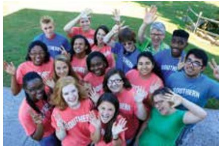
Participants from Southern’s 2015 Christian Media Camp

“Our favorite part of the journalism camp every year is seeing high school students awoken to new ways they can use their gifts for God’s glory,” said assistant