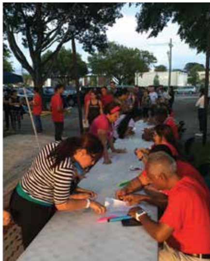
El evento en sus diferentes etapas

En esta ocasión se contó con el auspicio de la oficina del sheriff del condado de Palm Beach, quienes apoyaron durante el evento ayudando en la entrega de regalos e información a las familias. También estuvieron presentes representantes de otras iglesias del área como la de