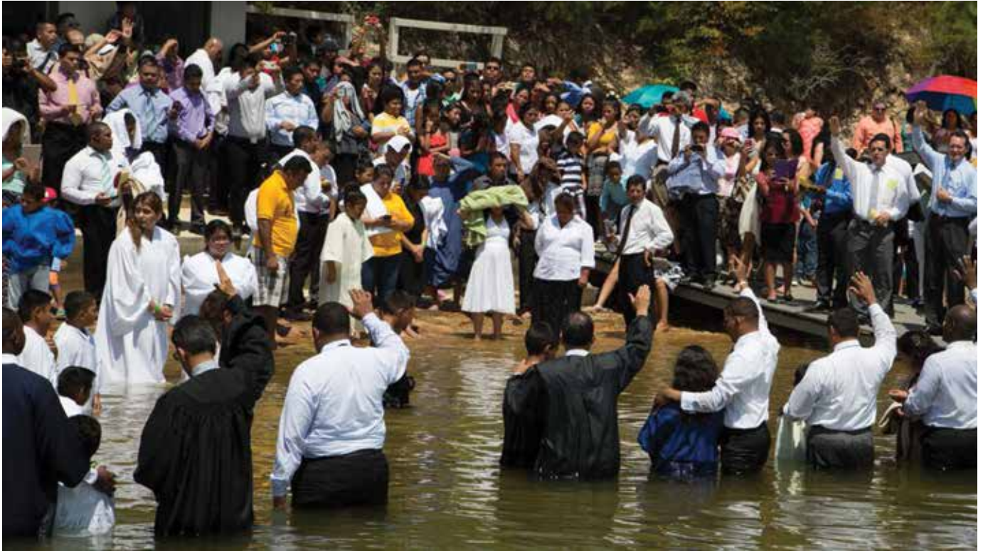
Bautismos durante una de las campañas llevadas a cabo

El departamento hispano comenzó el 2016 con entusiasmo. El recuerdo de las bendiciones recibidas el año anterior, es motivación para continuar la tarea en el año que acaba de comenzar.