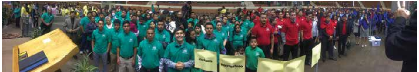
Participantes de grupos pequeños

El sábado 16 de enero, el Ministerio Hispano de la asociación Gulf States llevó a cabo su primera convención de grupos pequeños en el Garrett Coliseum de Montgomery, AL. El evento dio comienzo a la iniciativa “Grupos Pequeños + Esperanza 2016.” Se contó con la asistencia de más de 1,250 personas entre laicos, pastores, y administradores de la Asociación y Unión.