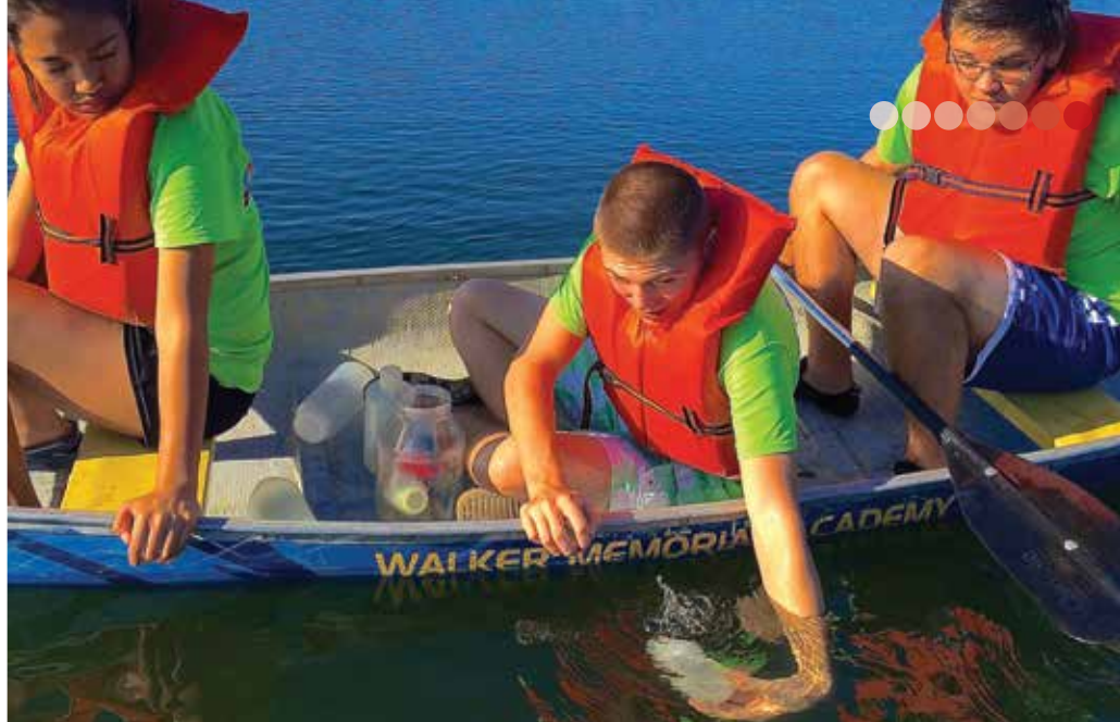
Walker Memorial Academy students participate in the University of Florida's Lakewatch Program, Global Learning and Observations that Benefits the Environment (G.L.O.B.E.), and Highlands County Lakes Association, collecting water samples to determine quality control. Walker Memorial ranks first in Florida K-12 schools according to the number of data points contributed to the G.L.O.B.E. program.

in STEM fields. Careers in STEM fields are very important because, during the past 10 years, STEM jobs grew three times faster than non-STEM jobs. Non-STEM workers are more likely to face unemployment than those in STEM occupations. Those employed in STEM careers earn 26 percent more than those in non-STEM jobs. Less than one-third of non-STEM workers have college degrees when compared to more than two-thirds of STEM employees who have completed college programs. Individuals with degrees in STEM make more money regardless of whether they are employed in STEM jobs or not.