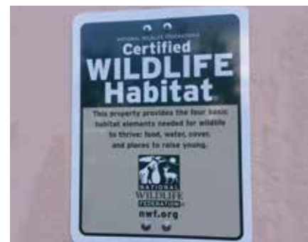
Sawgrass Adventist School became a National Wildlife Certified school in August 2015. This sign is posted on a column at the school’s entrance.

technology evolution. Students are invited to test their STEM knowledge at regional and national competitive levels. Southern Adventist University hosts the Southern Challenge, an annual tournament featuring LEGO robotics and research projects of students in grades 5-12. The Southern Challenge is a member of the Adventist Robotics League, a consortium of educators working in Seventh-day Adventist education that sponsor and promote classroom learning through robotics. The North American Division Robotics Challenge is the national tournament for the Adventist Robotics League. This activity will be held May 1, 2016, in Sacramento, California. Additionally, there are numerous national, non-Adventist STEM competitions.