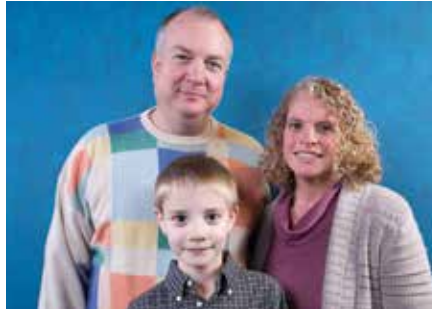
Camp Yorktown Bay.