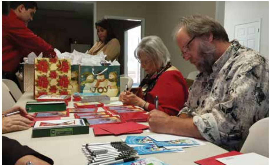
Members prepare Christmas bags to distribute to the community.

Earlier in 2015, a brand new One-day Church had been erected in Cerro Campana, Panama, through a partnership with Maranatha Volunteers International, students and staff from Georgia-Cumberland