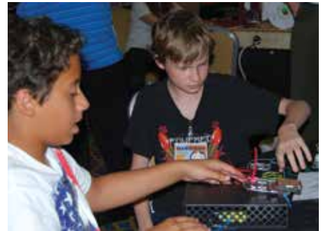
Two boot camp participants from the Kentucky-Tennessee Conference discuss their invention and the next steps needed to complete it.

Kissimmee Valley Archaeological and Historical Conservancy (KVAHC) has accepted the Honors Class of Archaeology at Walker Memorial Academy (WMA) in the Florida Conference, as members of its chapter since 1995. As members, the students have been mentored by several avocational and professional archaeologists to experience the analytical and inquisitive thought processes of the archaeologists. Students participate in all aspects of archaeology, including excavation, screening, bagging the artifacts, mapping in the features, working in the lab, and the paperwork — record level form and feature form.