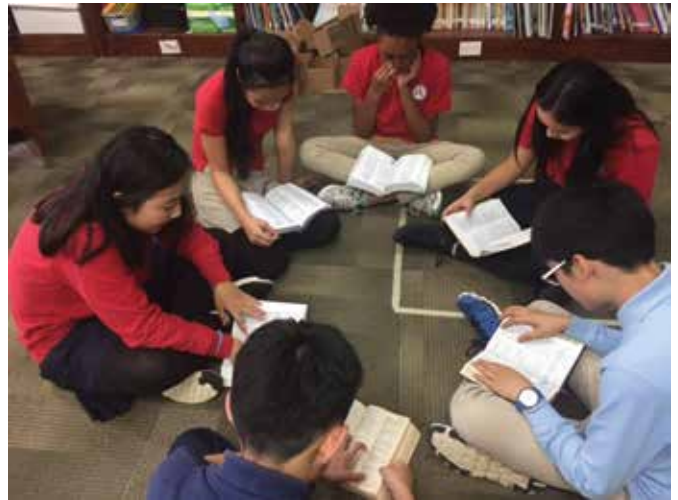
A group of fifth- and sixth-grade students study a lesson from the Encounter Bible curriculum together.