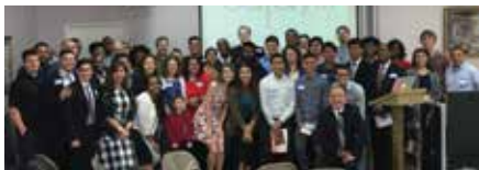
Attendees of the Campus Catalyst Training Event held March 25, 2017, in Nashville, Tenn.