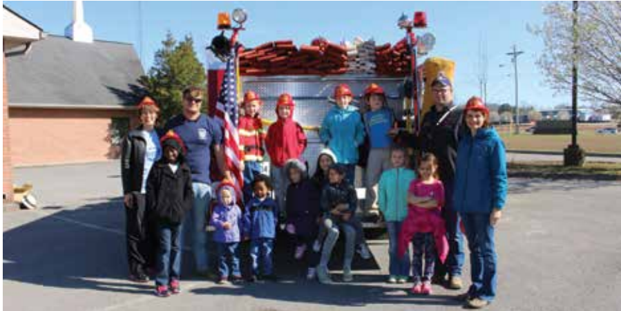
SUBMITTED BY: KATHY KANE