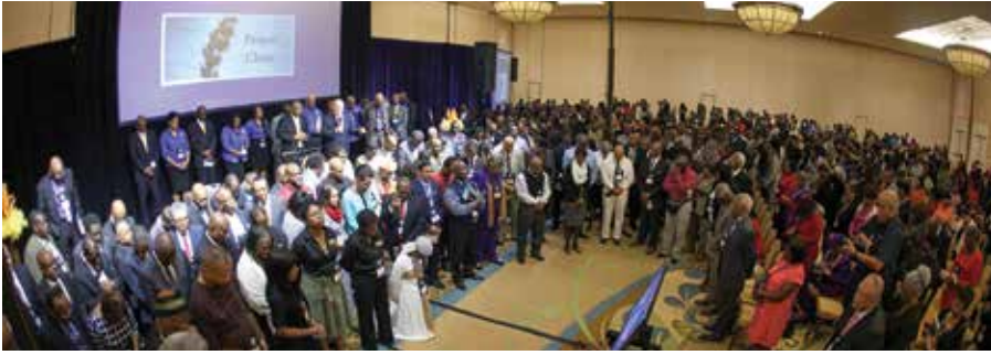
Southeastern church and Conference officers committed themselves to mission-driven leadership.