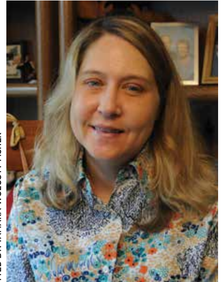
SUBMITTED BY: TAMARA WOLCOTT FISHER