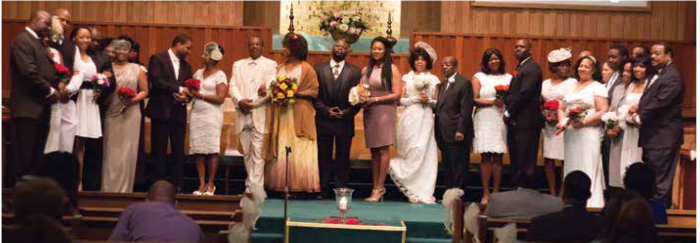
Fourteen couples participated in the Vow Renewal Ceremony at East Market Street Church in Greensboro, N.C.

The Word of God tells all in Genesis 2:24, “Therefore shall a man leave his father and his mother, and shall cleave unto his wife: and they shall be one flesh.”