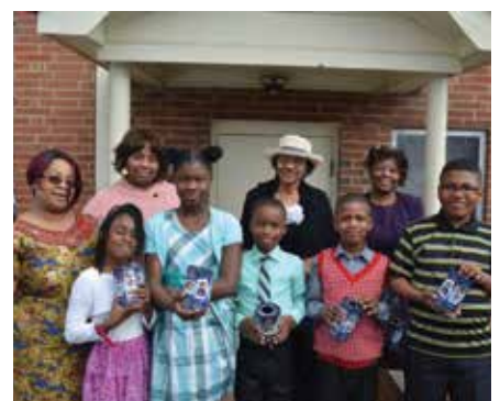
Charlotte Berean children and adults display their “Mission Banks,” used to collect their 13th Sabbath offering for children in the Inter-European Division.