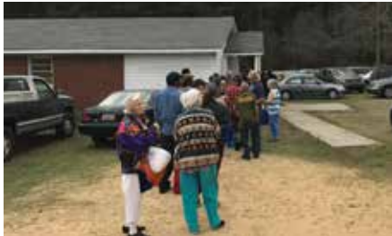
Pageland, S.C., clients stand in line to pick up food bags and household products.