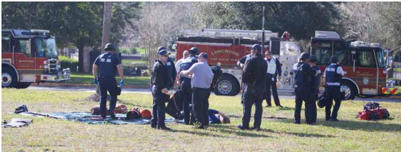
First responders demonstrate how to care for actors simulating victims with injuries.