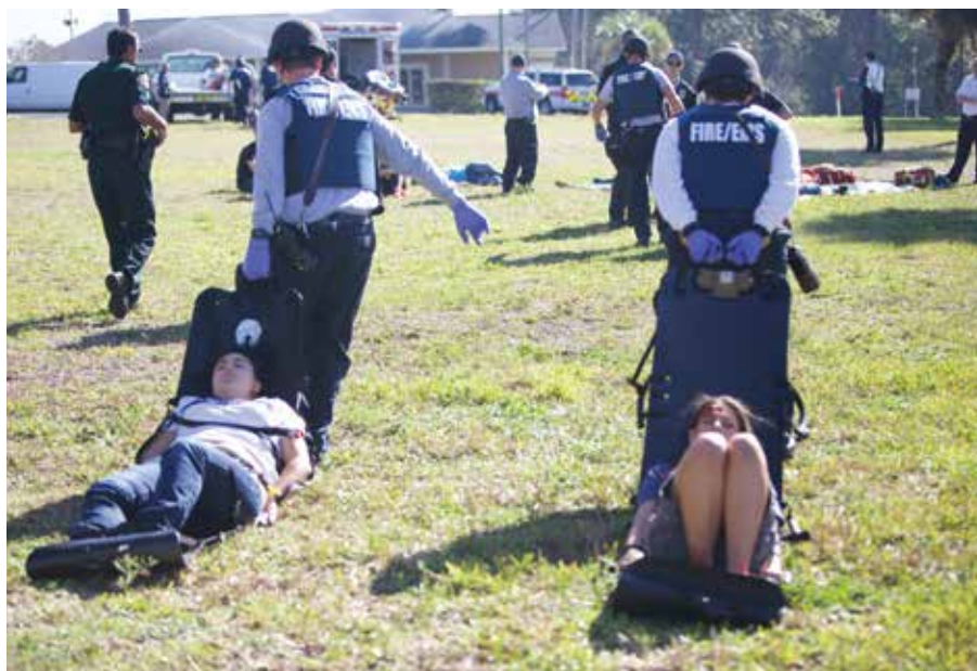
First responders transport actors imitating shot victims to safety.