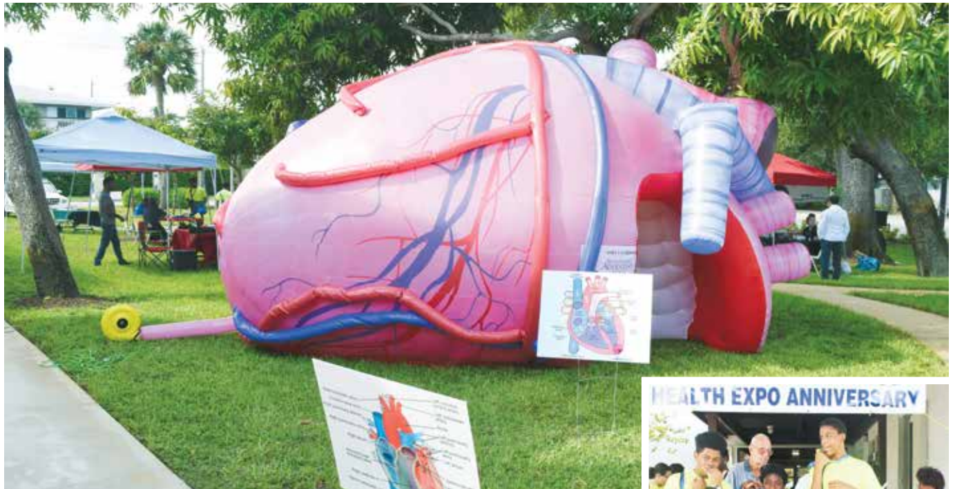
The inflatable heart tent was an attention getter at the Fort Lauderdale Church Health Expo.

An inflatable heart tent for children was the focus of the 21st Annual Health Expo, held November 4, 2018, on the Fort Lauderdale, Fla., Church grounds. “Race to Wellness” was the theme for the Expo, with more than 50 displays by providers.