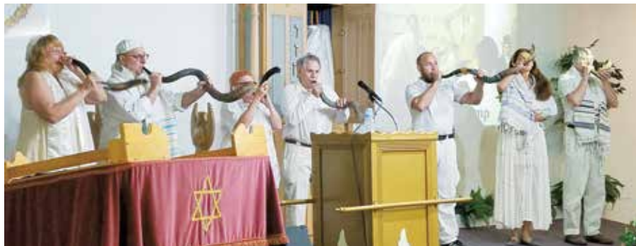
The last shofar being blown at the end of Yom Kippur