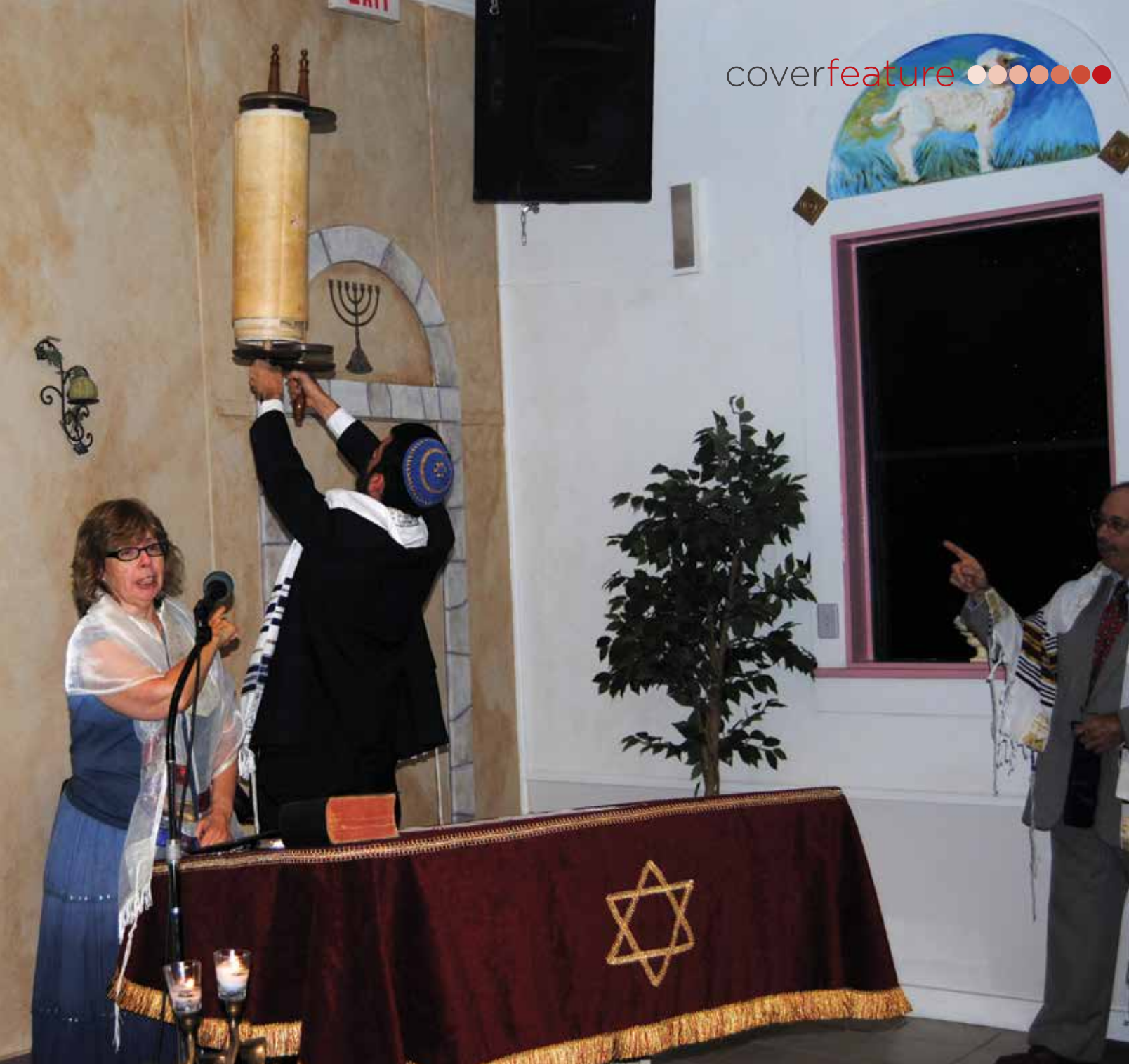
The Torah is lifted up to exalt God's Word.

Jesus. Jesus rose on Sunday and the Holy Spirit descended on Sunday, they reasoned, so they could return to Sunday. From the second through the fourth centuries, church leaders and politicians negotiated a way not only to stop the persecution, but also to become the state religion. Constantine made this happen in the fourth century.