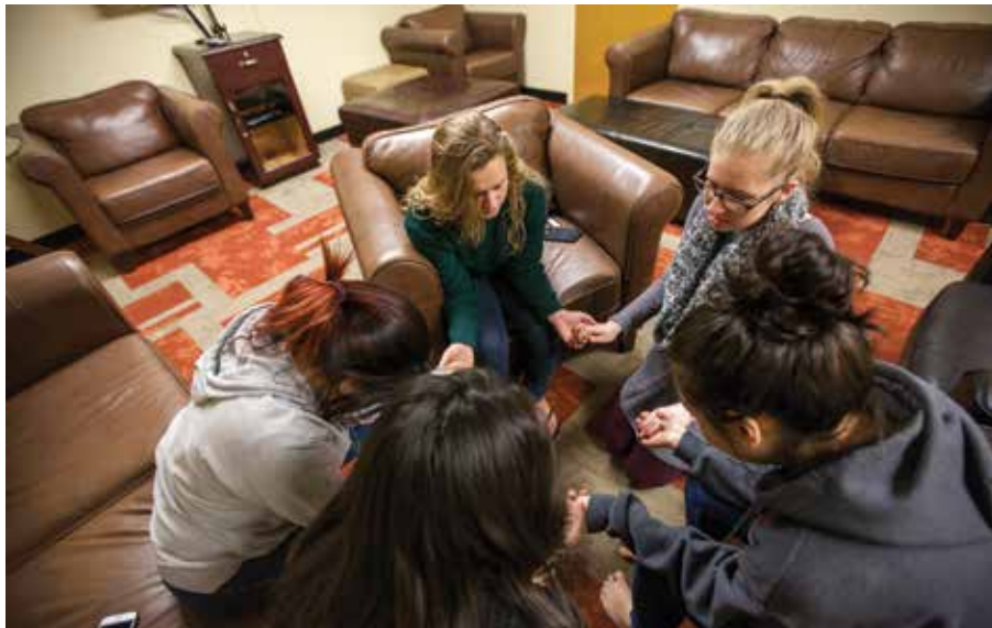
LifeGroups give students an opportunity to develop lasting friendships and a sense of community as they build a deeper, personal relationship with Jesus.

These student-led groups are as varied and unique as the students who gather together. Some delve into the prophecies of Daniel and Revelation, others focus on gaining a deeper understanding of the men and women God wants them to be; one group of guys meet for an intense mountain bike ride that ends sitting in a circle, unpacking what God is doing in their lives. Other groups, like one for returning student missionaries (SMs), serve