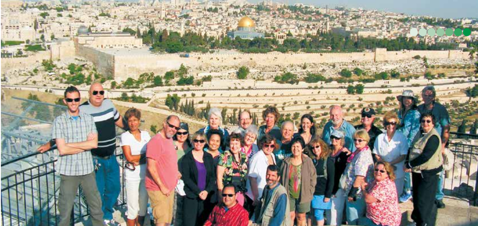
Tour group overlooking Jerusalem from the Mount of Olives