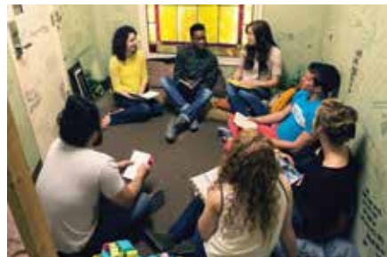
These student-led groups are as varied and unique as the students who gather together.

a special role for students who may feel different than their peers.