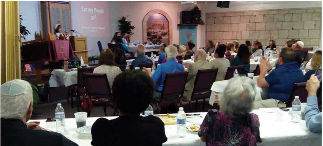
A Passover Seder was held in New Port Richey, Florida.

This process fanned anti-Semitic feeling like throwing gas on the fire, bringing 17 centuries of intense persecution of Jews that resulted in between seven and 15 million Jews being killed. Therefore, when Hitler brought the holocaust, he only sped up the process that had been going on for 17 centuries, and almost no one spoke up.