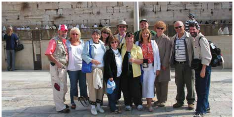
A group in Israel at the Western Wall

take away one's ethnicity. Therefore, when a Jewish person accepts their Jewish Messiah, we have no right to say they are now Christian and no longer Jewish. We do not say someone is no longer Spanish, African, etc., when they accept Christ.