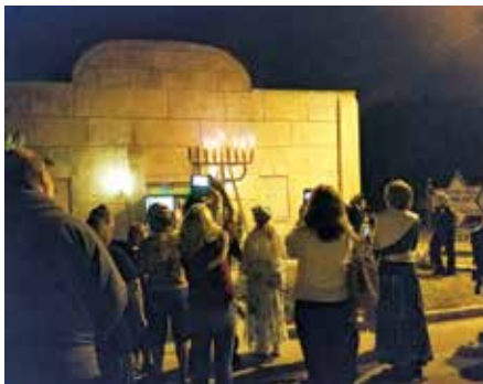
Outside lighting of the menorah during Chanukah