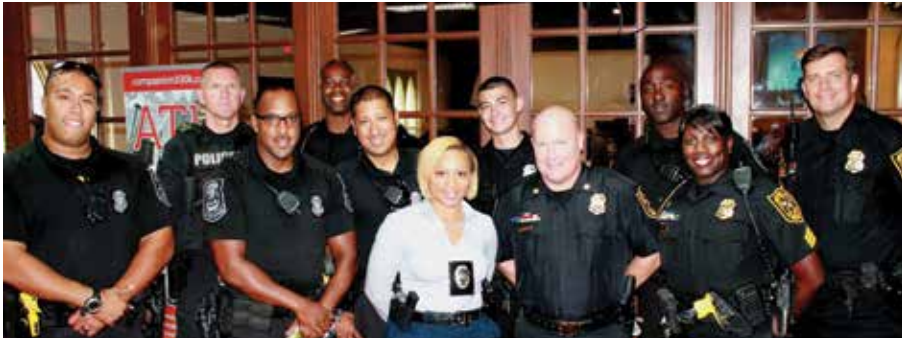
Stone Mountain, Georgia, Church members hosted the Community-Cop Talk with the DeKalb County Tucker Precinct police during the annual event.